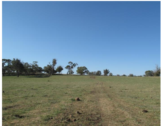
Typical open grassland on ridgetop