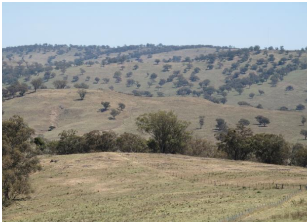
Typical ridgeline proposed for location of turbines