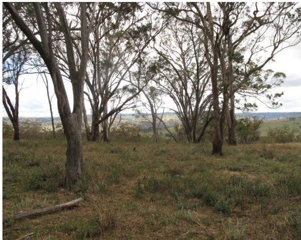
Typical open woodland patch on ridgetop