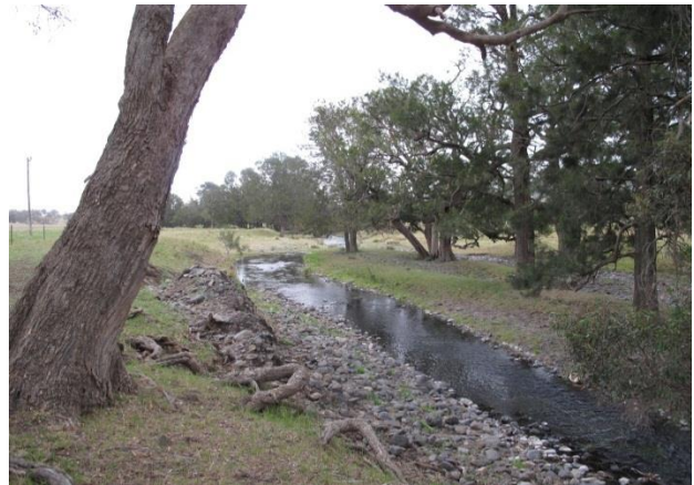
Typical riparian habitat with fringing woodland