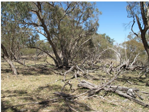
Typical area of fallen logs and leaf litter