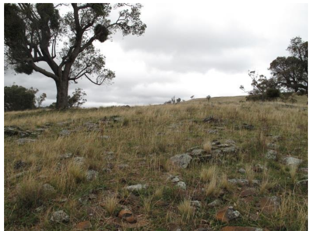
Typical grassland with scattered surface rocks