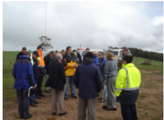
Planning Focus Meeting: Gullen Range Wind Farm

The Community Open House information day will seek to inform the community about the wind farm as well as seeking individual and community views on issues that the community perceives as being important. A summary of the project and the expected impacts will be presented, with professional and expert staff available to respond to queries and better understand issues raised. Follow up phone calls, emails, letters can progress individual issues raised.