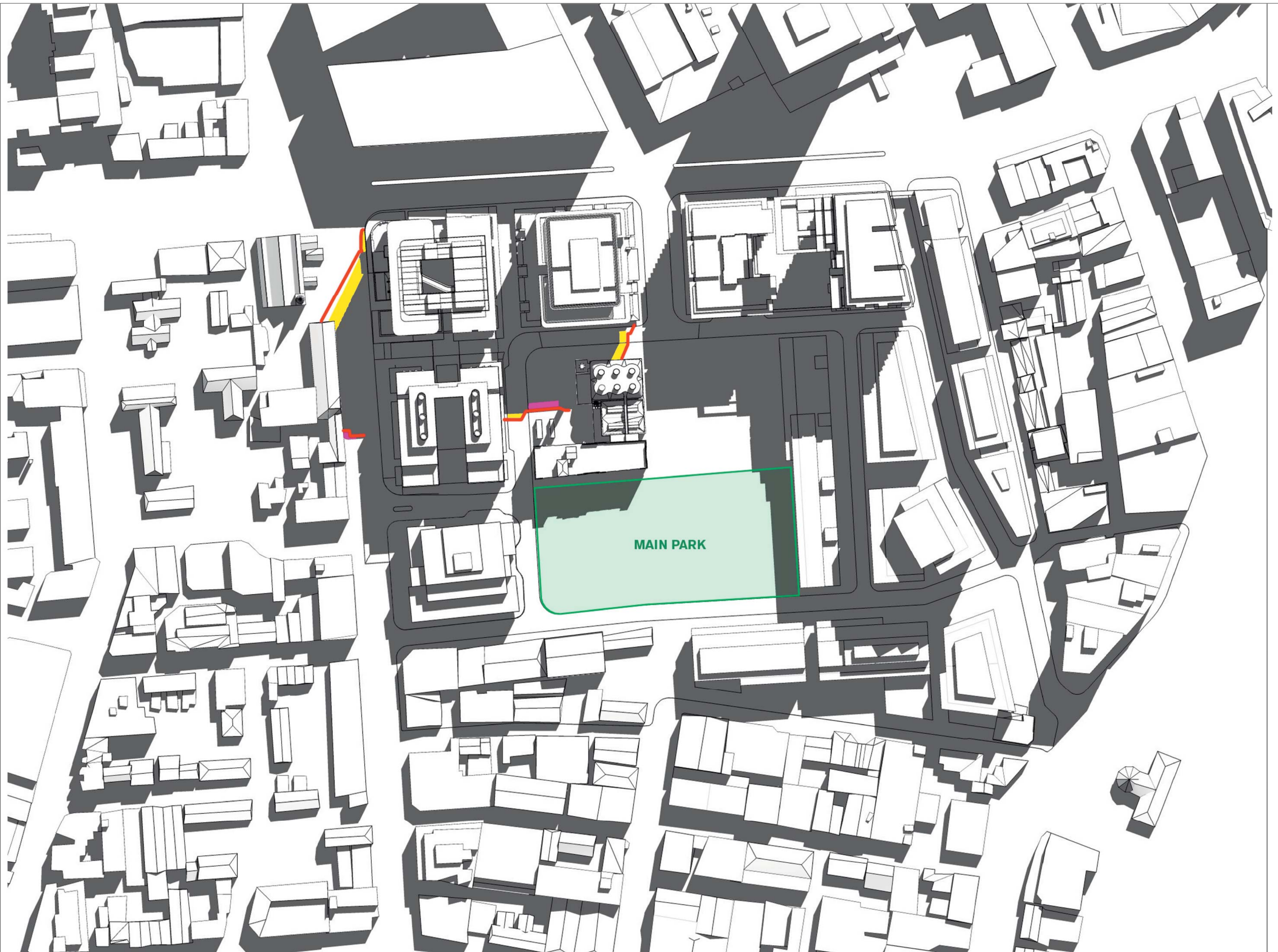
05 22 March 11:00 AM