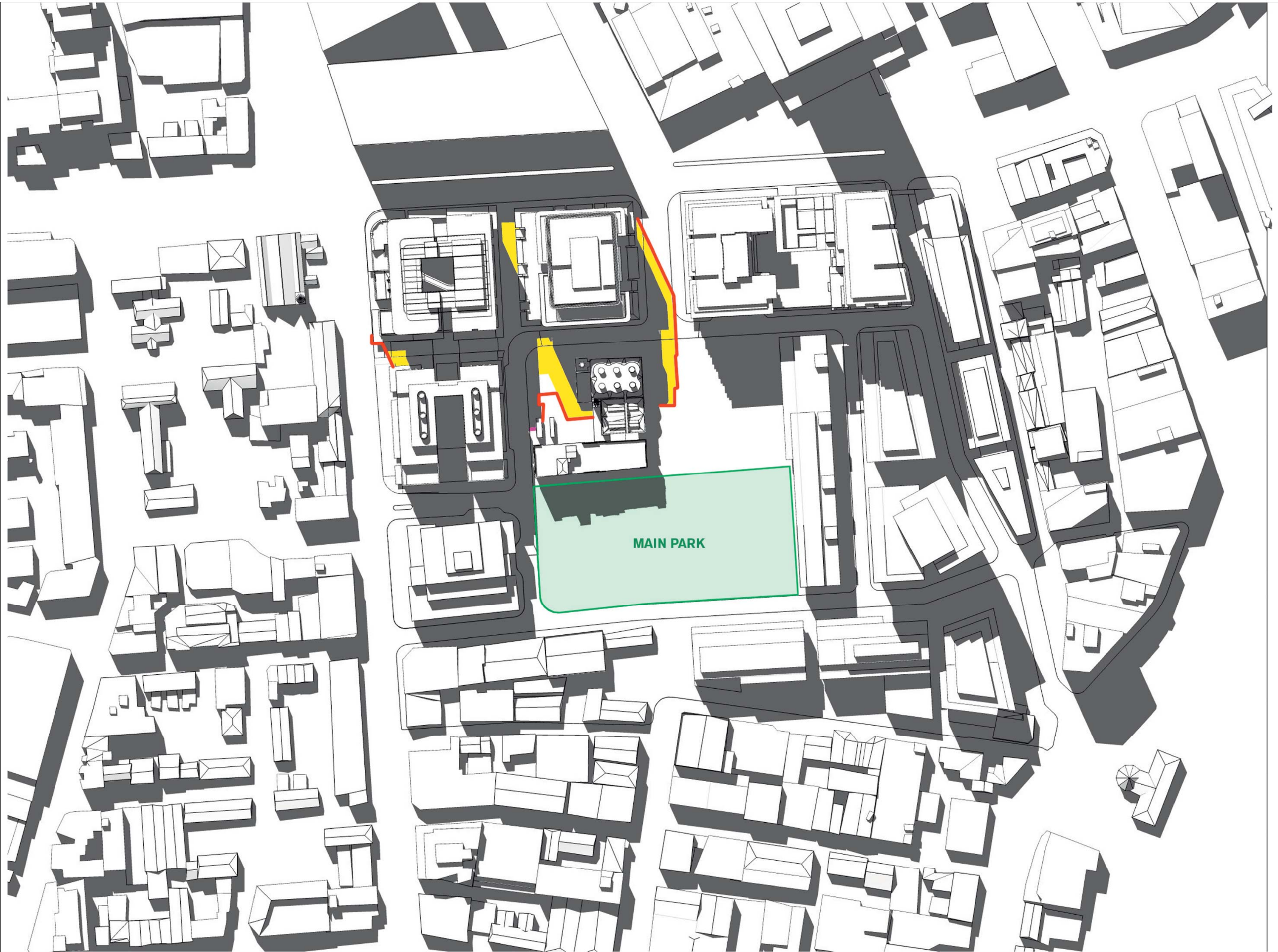
07 22 March 02:00 PM