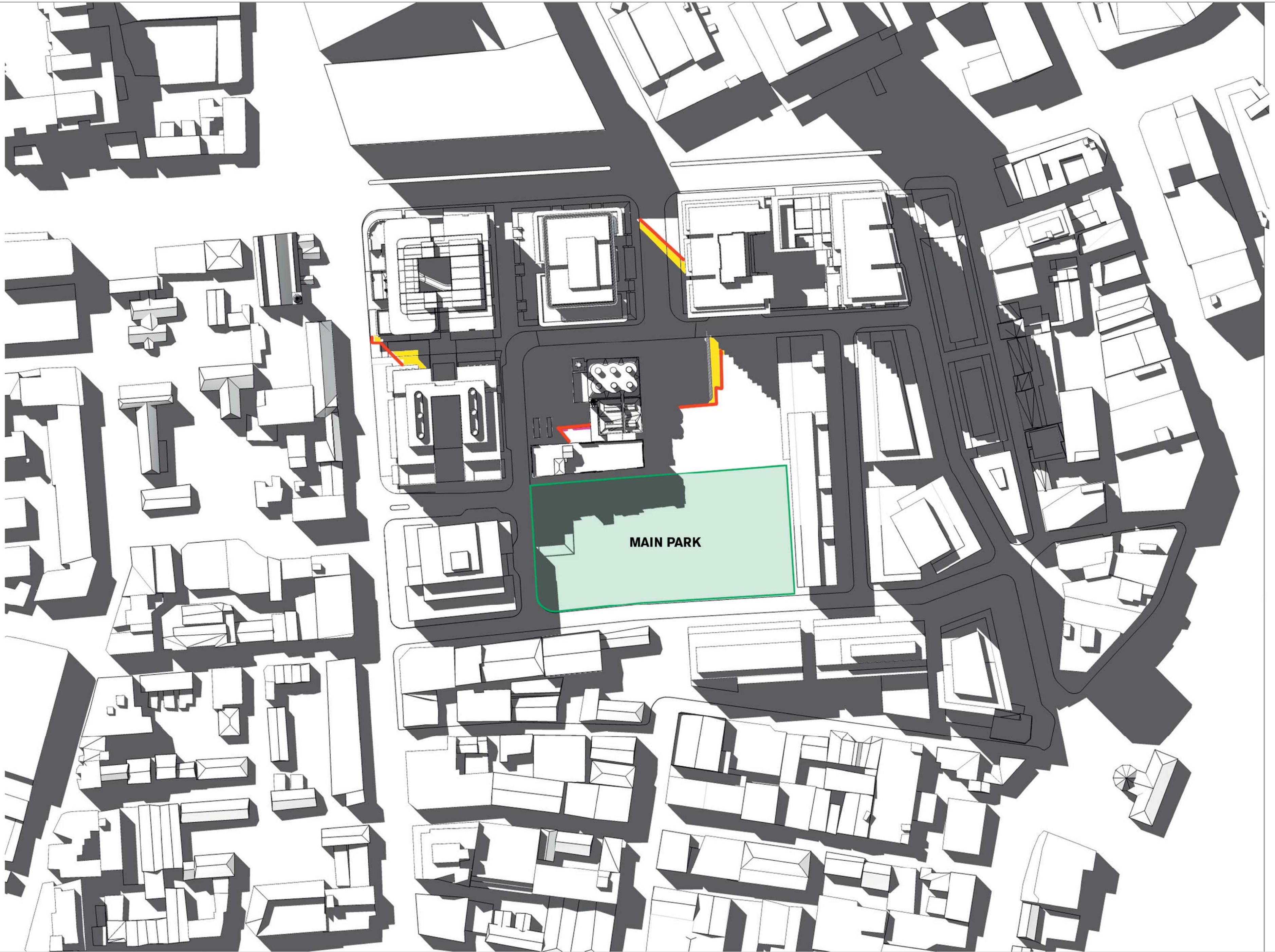
08 22 March 02:00 PM