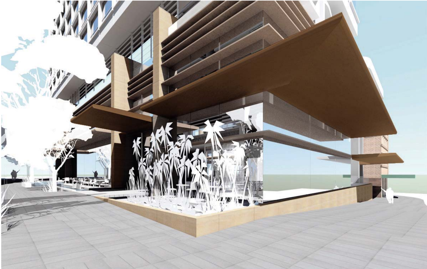
Revised PPR Scheme