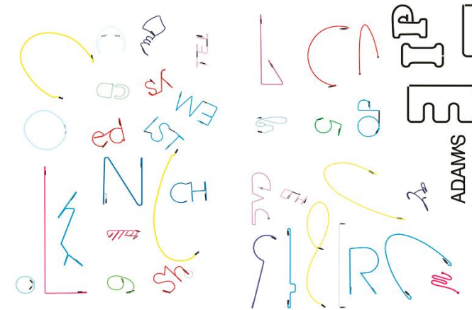
Little Hay St Public Artowrk – Character and Symbolog