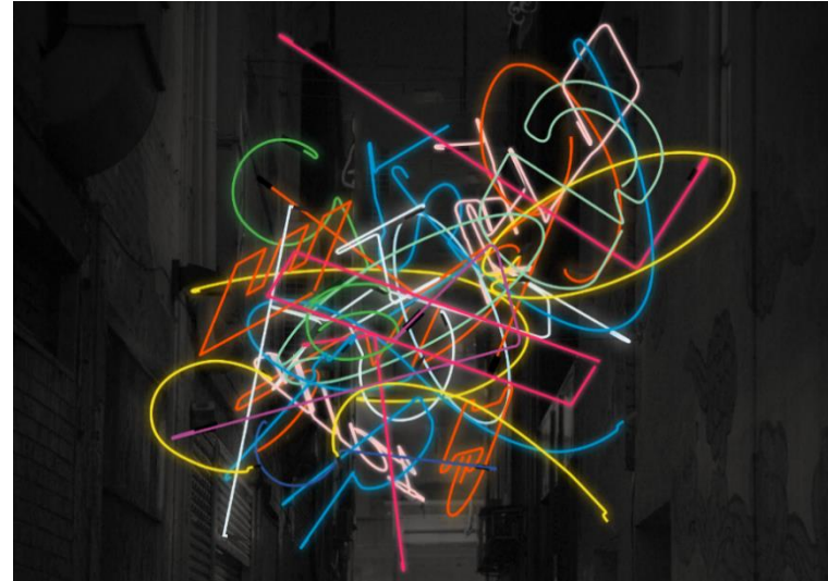
Little Hay St Public Artwork – Catenary Peice C1 Render

Providing a cue to the installation as a whole, the single element fixed high on the wall at the entrance of the street reminds us of signage, but the neon doesn't quite spell out words or even letters. It is based on an ongoing series of works that use recycled neon (text, numbers, symbols and remnant off cuts of advertising signs) collected from manufacturer throughout Australia. The neon fragments although in part recognisable lose their ability to communicate as written language and instead become a cacophony of marks and lines that communicate the idea of a lived history of the city and its social history. The work recalls the street scape of Chinatown and city façades with signage and bright colourful lights. Along the length of Little Hay Street the almost recognisable letters and words are like chatter on the street, you hear a fragment of a sentence, a single word, from the trill of voices in conversation at cafes or strolling on the street. Taking neon collected from signage parts as a starting point, the work upscales these into large elements that can be assembled into compositions to respond to the scale, the layout and the energy of the street.