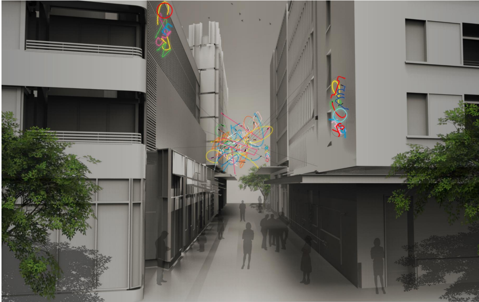
Little Hay St Public Artwork – Catenary Perspective