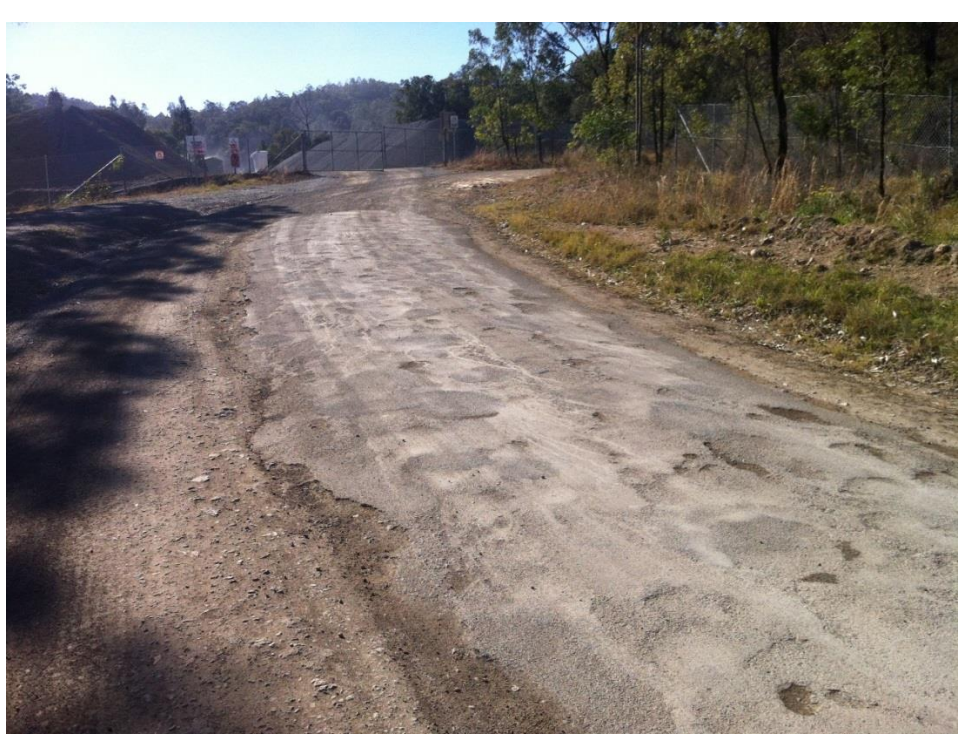
Photo 16: Alternative access on Douglas Street (Viewed to the north, with processing area in the background)