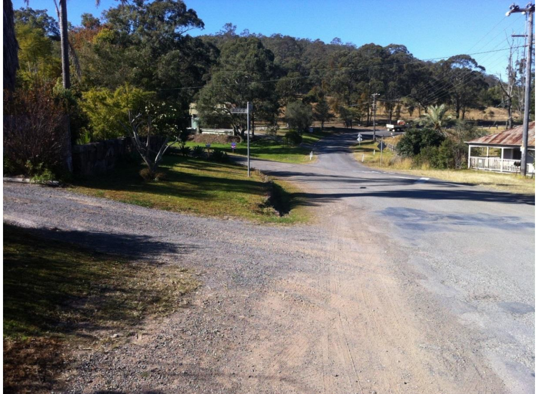
Photo 13: View towards Douglas Street along Cory Street in a southerly direction

Photo 12: Intersection of Station Street and Grace Avenue/Cory Street