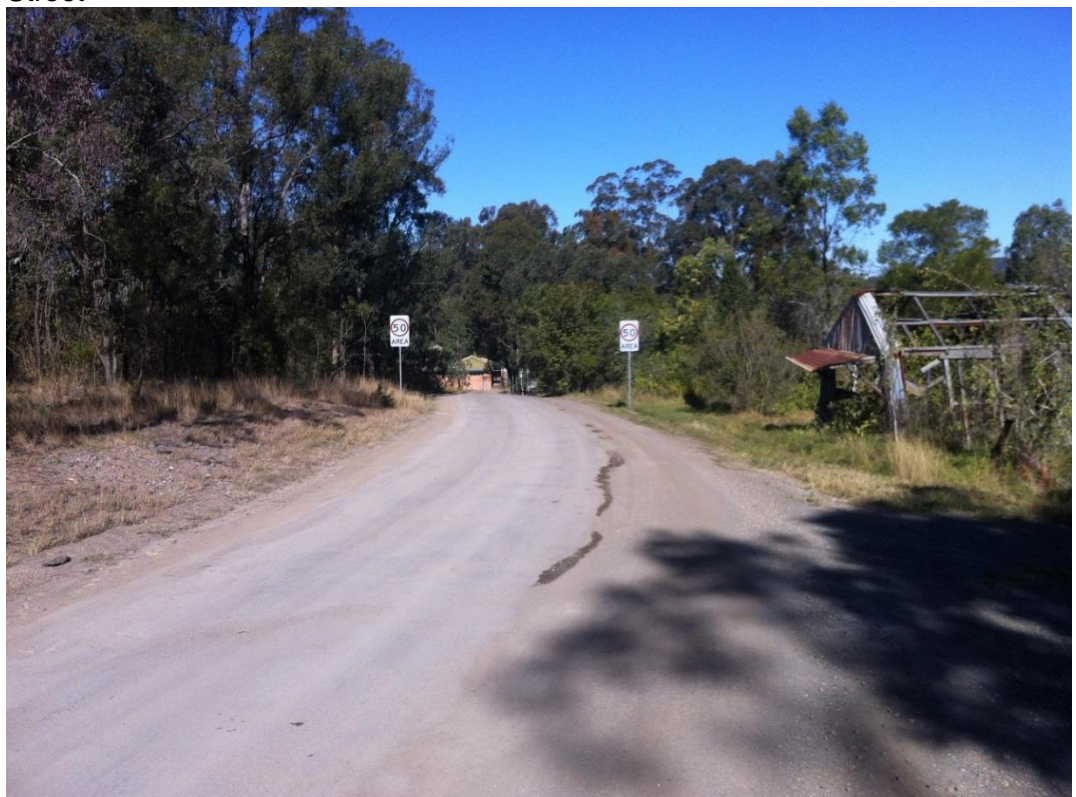
Photo 15: Alternative access on Douglas Street (Viewed to the south)