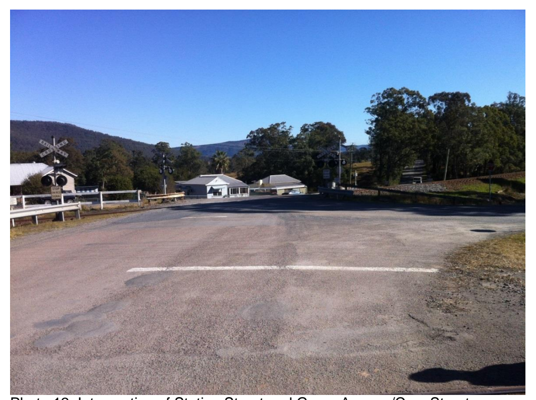
Photo 12: Intersection of Station Street and Grace Avenue/Cory Street