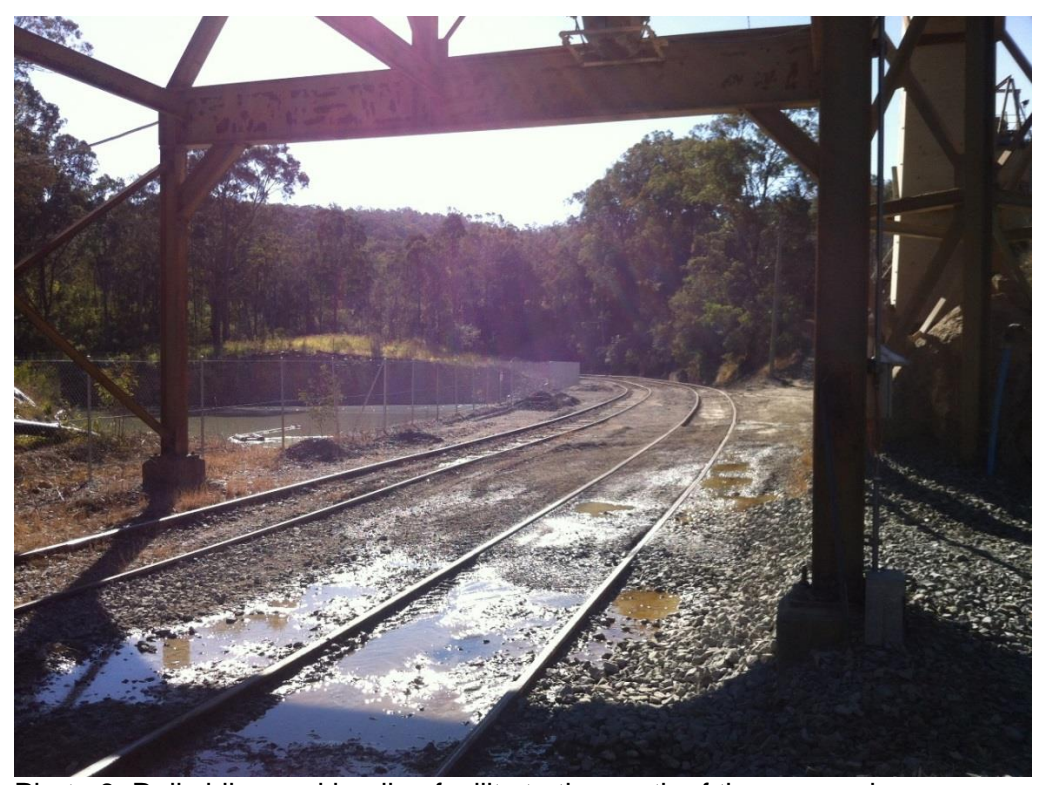
Photo 9: Rail siding and loading facility to the south of the processing area