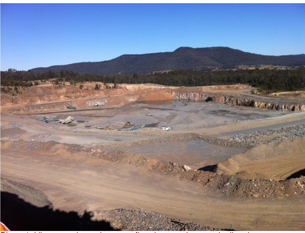
Photo 1: View over the main quarry floor in a south westerly direction