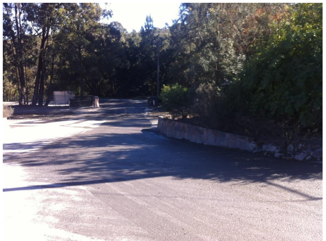
Photo 7: View of the main site access from the administration building