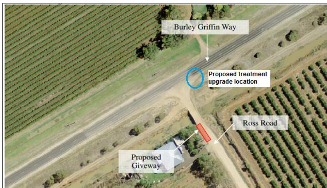
Figure 2: Burley Griffin Way and Ross Road intersection

The key difference would be the inclusion of a left turn shoulder lane from Burley Griffin Way onto Ross Road under the proposed modified scenario (see Figure 2 ).