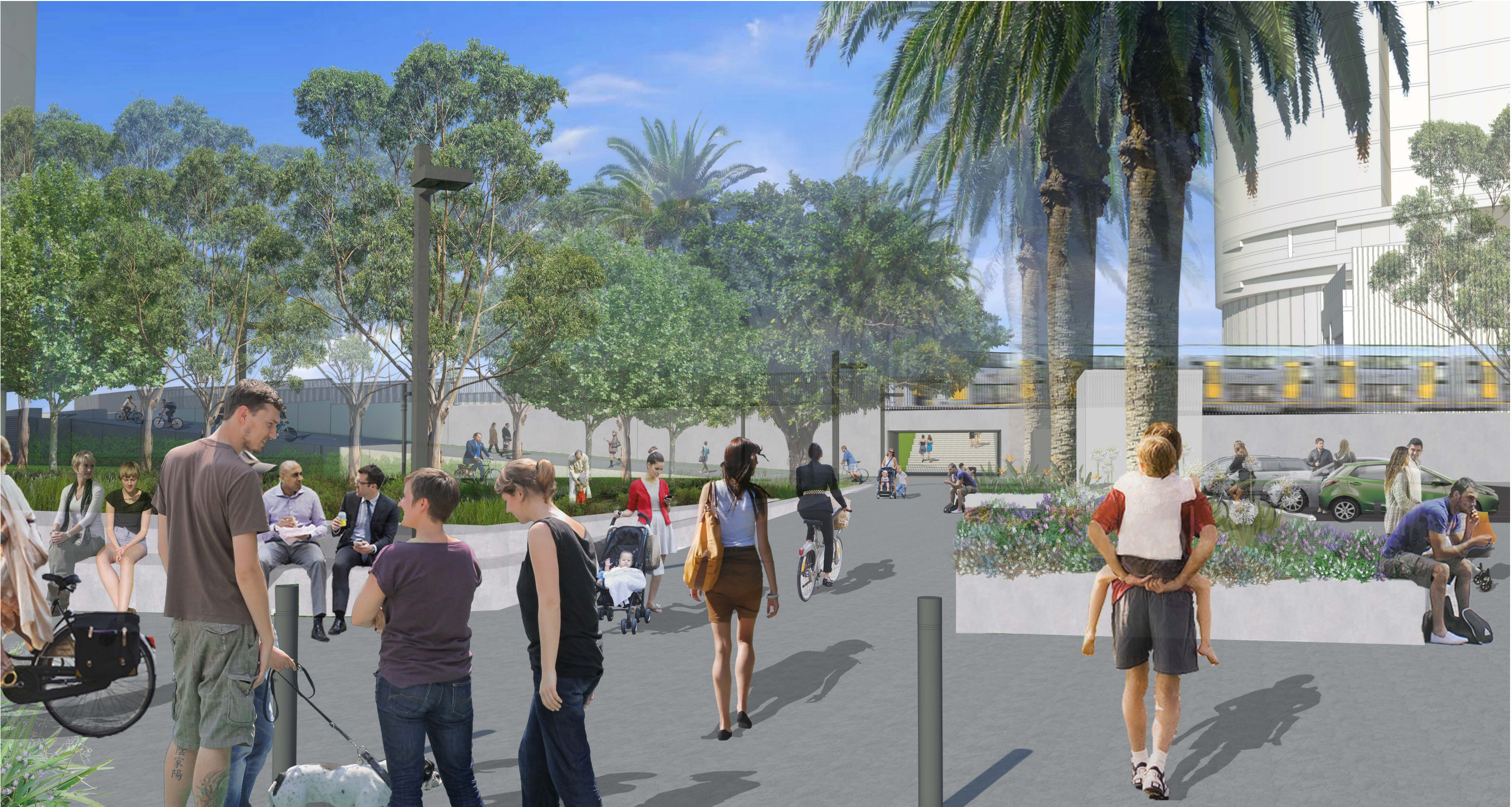
PICTURED View across Site 68, looking west towards proposed underpass