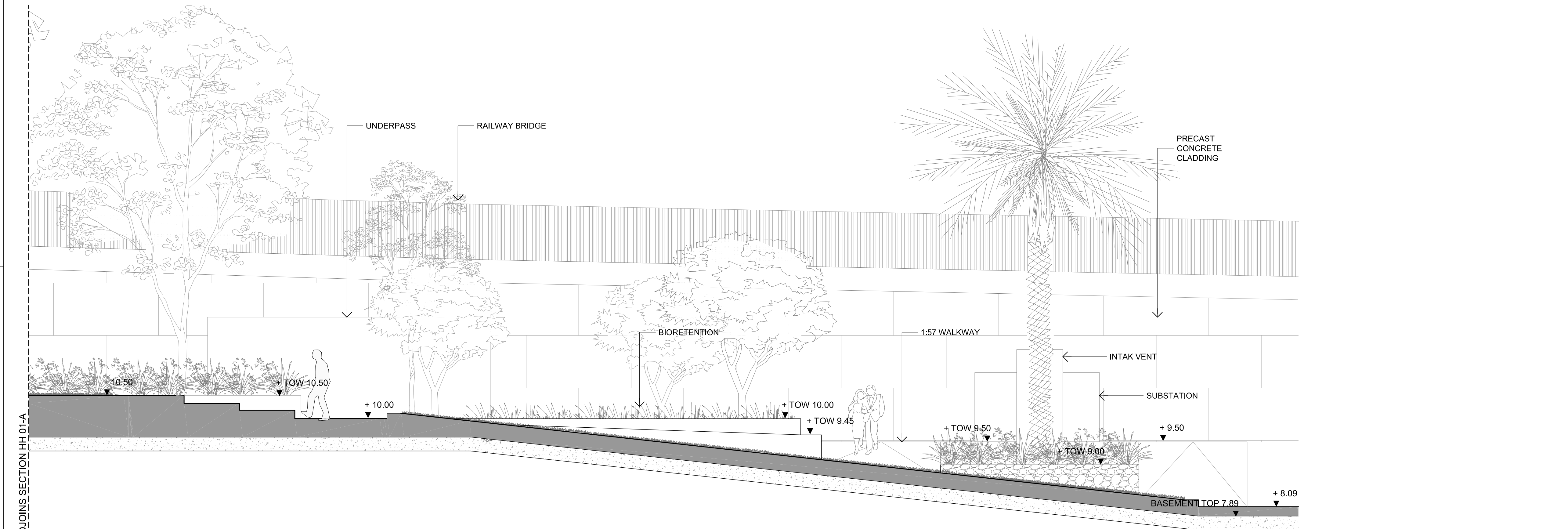
2 SECTION HH 01-B SCALE - 1:50 @ A1 1:100 @A3