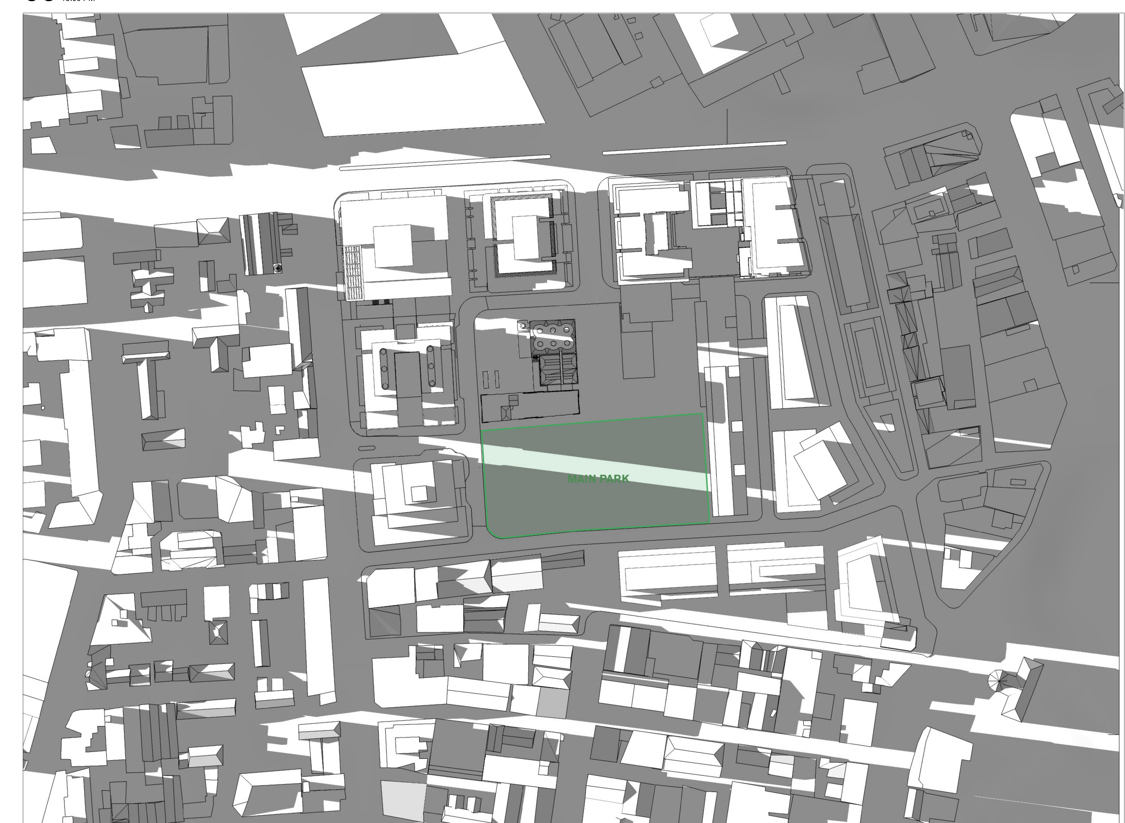
1 1 21 September