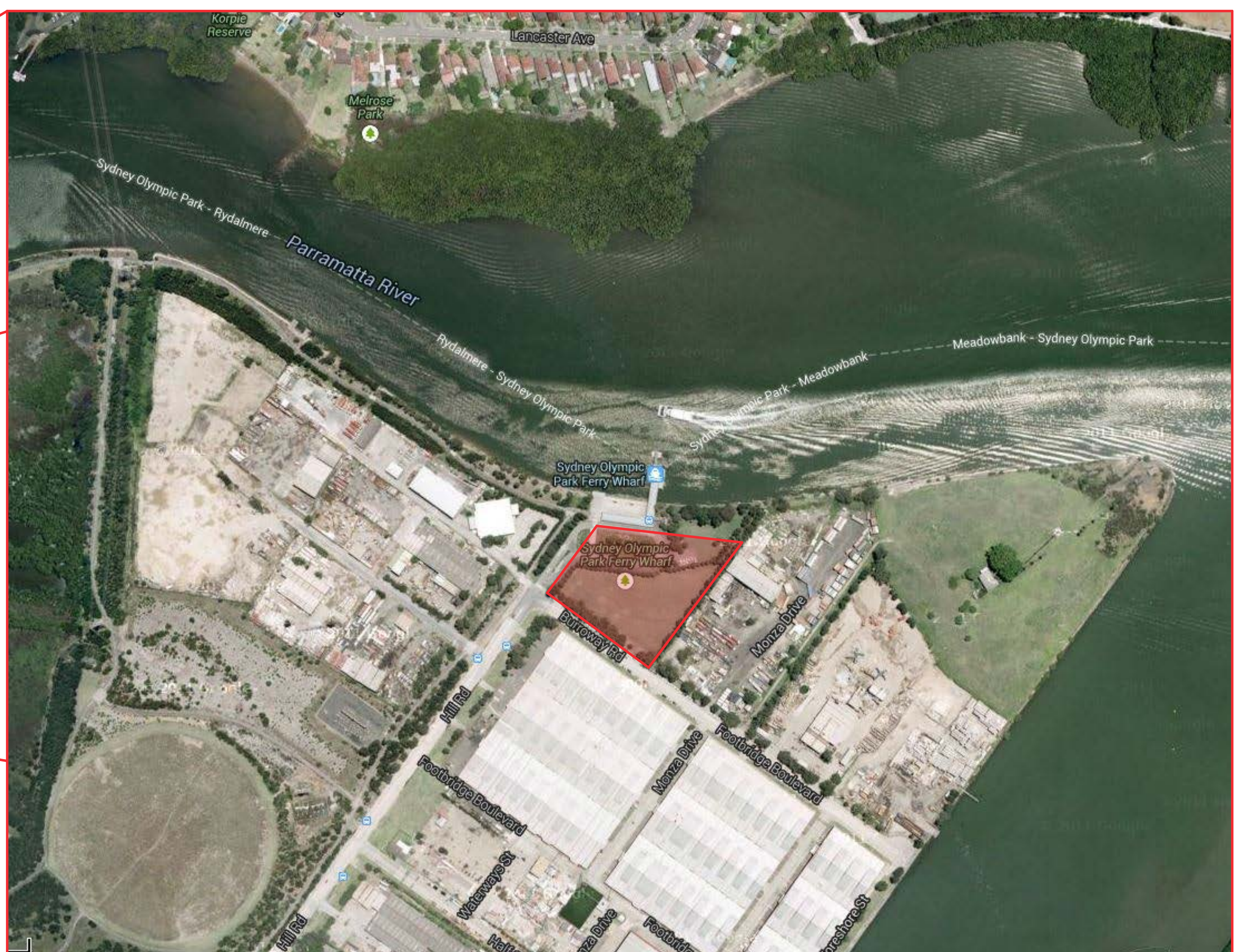
AERIAL VIEW FERRY WHARF SITE (not to scale)