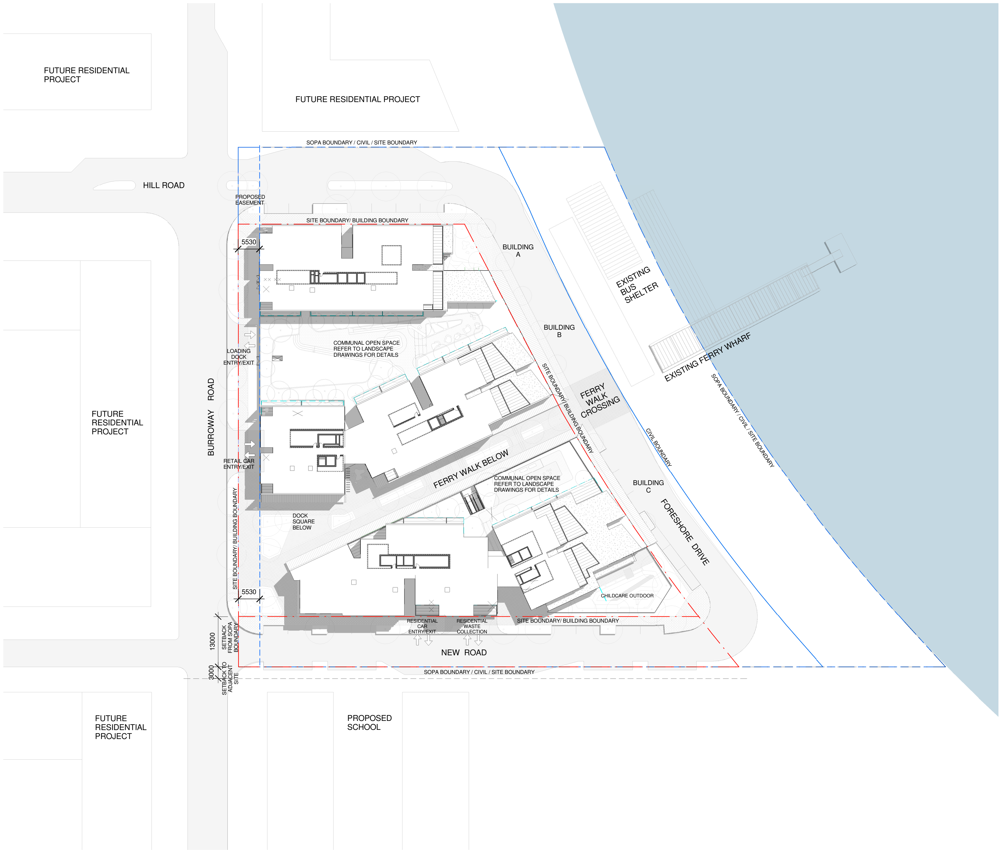
1 PLAN SITE PLAN 1 : 500