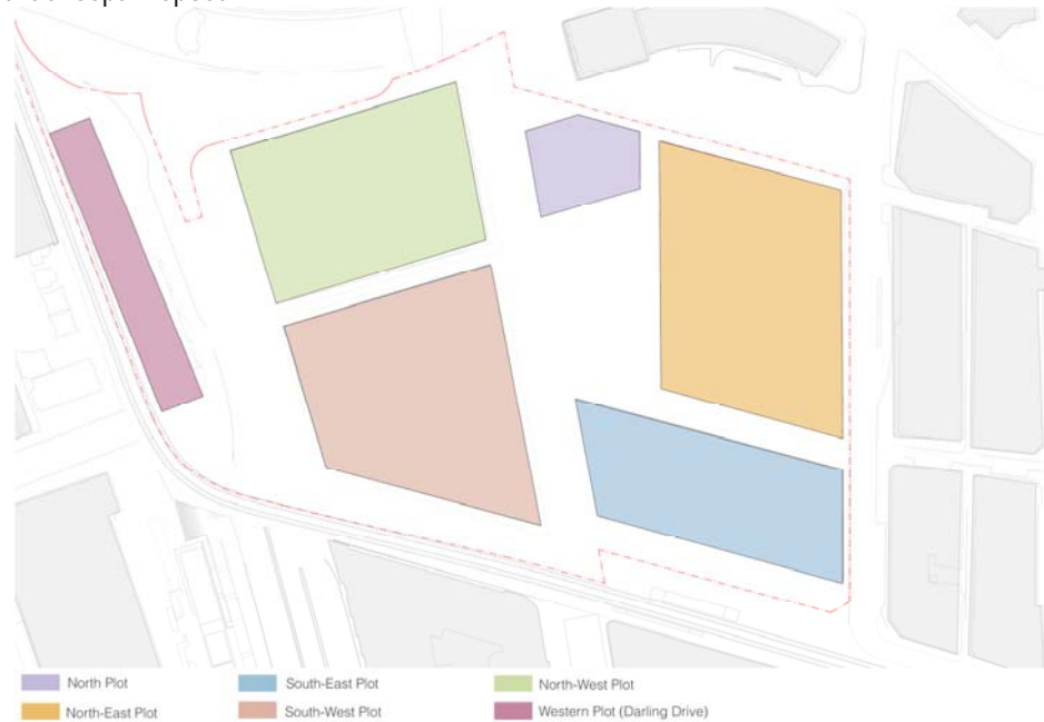
Figure 2 – Concept Proposal Development Plots

The Modification Application Site relates to the North West Plot and surrounds as detailed within the architectural and landscape plans submitted in support of Modification Application. Figure 2 illustrates the North West Plot in the approved Concept Proposal.