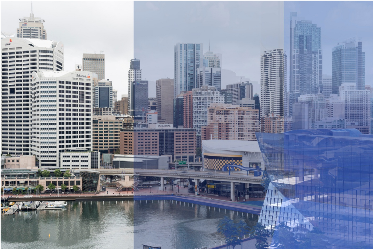
SICEEP-Novotel Room 1017