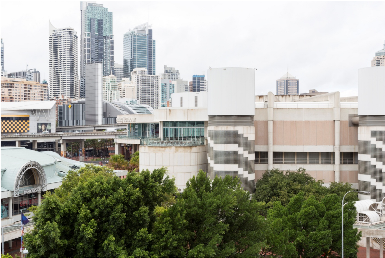
SICEEP-Novotel Deck 2 EXISTING