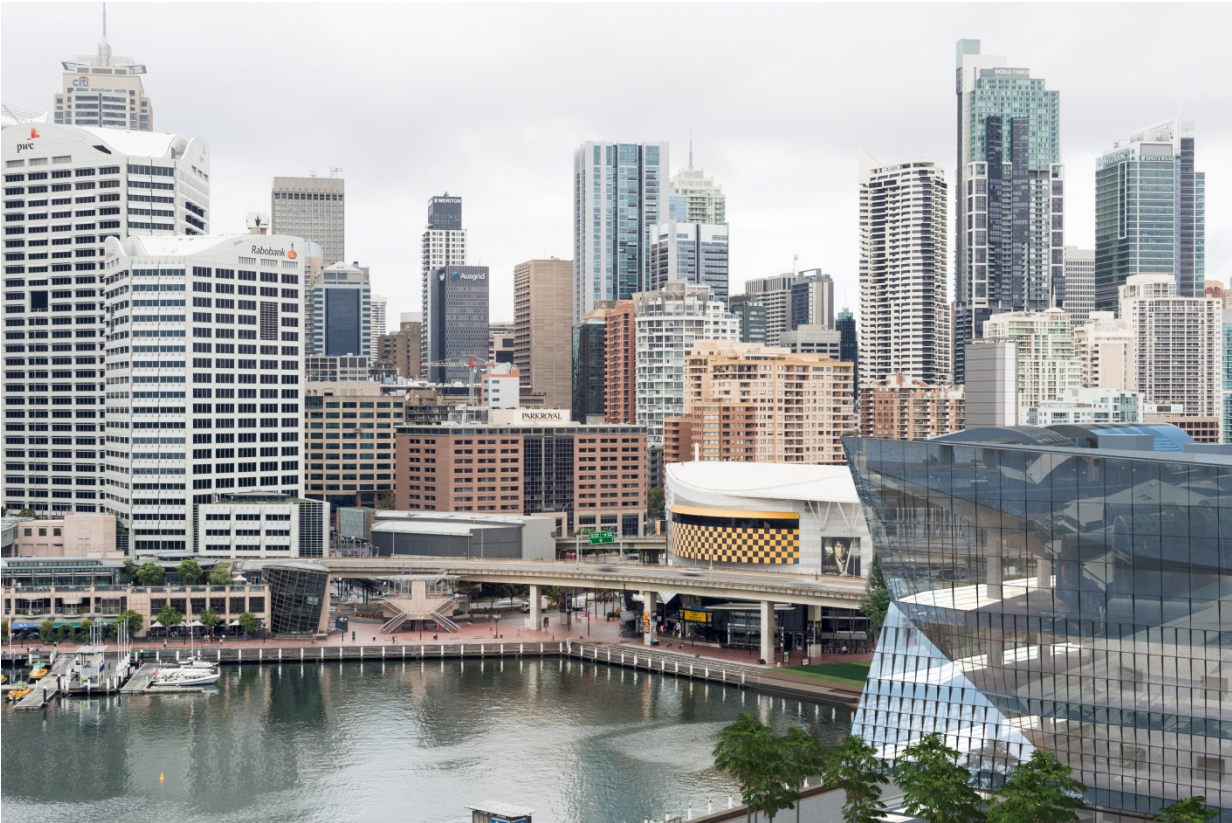
SICEEP-Novotel Room 1017