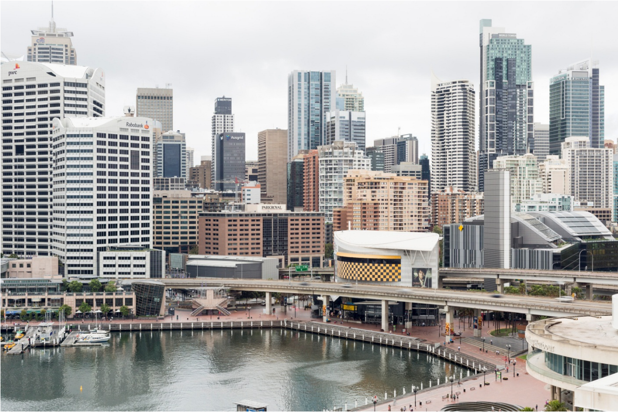
SICEEP-Novotel Room 1017 EXISTING