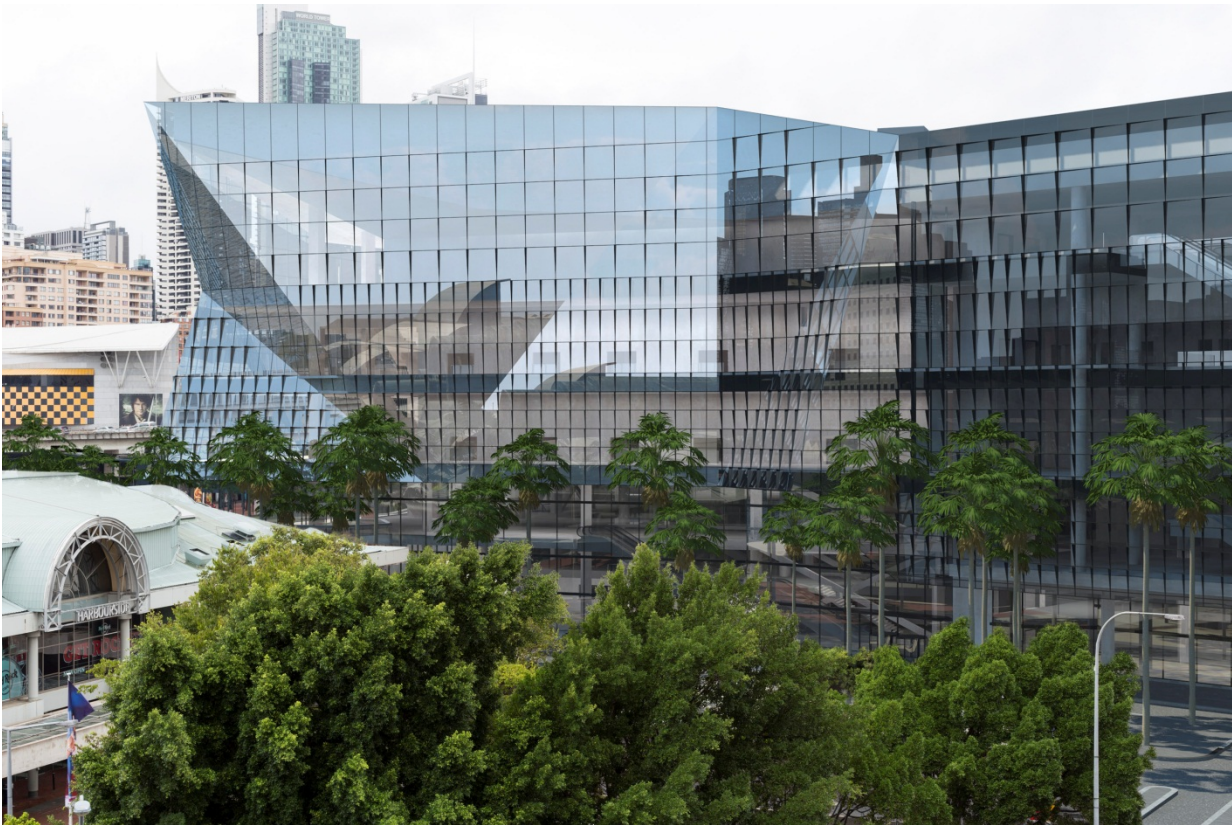
SICEEP-Novotel Deck 2