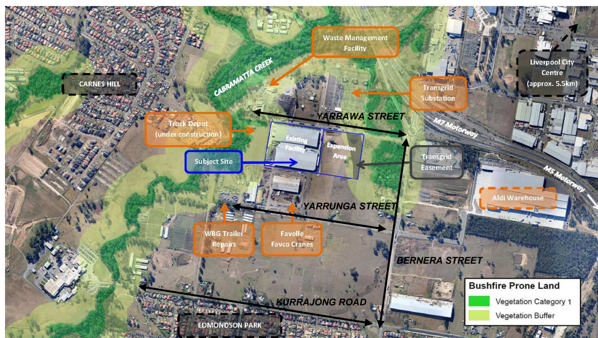
Figure 2: Mainfreight's Preston Site (Local Context)

Recent developments surrounding the site include Mainfreight's existing facility and Aldi's warehouse and distribution centre to the east. Other smaller scale industrial development includes Favelle Favco Cranes, W.B.G. Trailer Repairs to the south and a truck depot which is currently under construction to the west. A container storage facility and warehouse is proposed on the site immediately to the south of the expansion area site.