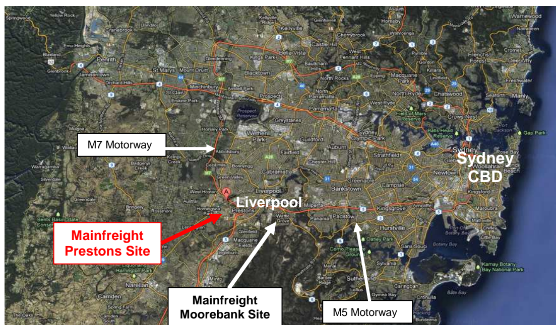
Figure 1: Mainfreight's Prestons and Moorebank Sites (Regional Context)

Mainfreight are a New Zealand based global logistics company operating over 200 branches worldwide. Mainfreight currently operate two warehouse and distribution facilities in the suburbs of Moorebank and Prestons in the Liverpool local government area. Liverpool is around 45 kilometres southwest of the Sydney CBD (see Figure 1).