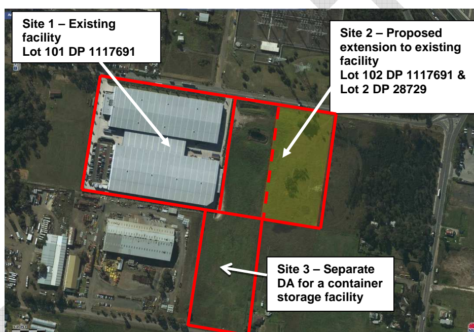
Figure 3: Mainfreight's Prestons Site

Site 3 is the subject of a separate application with Council for a container storage facility and warehouse for Southern Logistics.