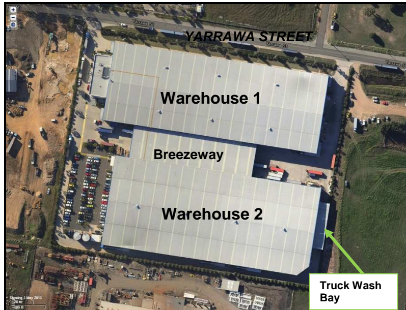
Figure 3: Existing Mainfreight Facility

'Warehouse 1' (or 'Transport Shed') (north/front) is used only for the collection of products for distribution. Pick Up and Delivery vans (PUD's), B-Doubles and Semitrailers drive through the Transport Shed to collect the goods.