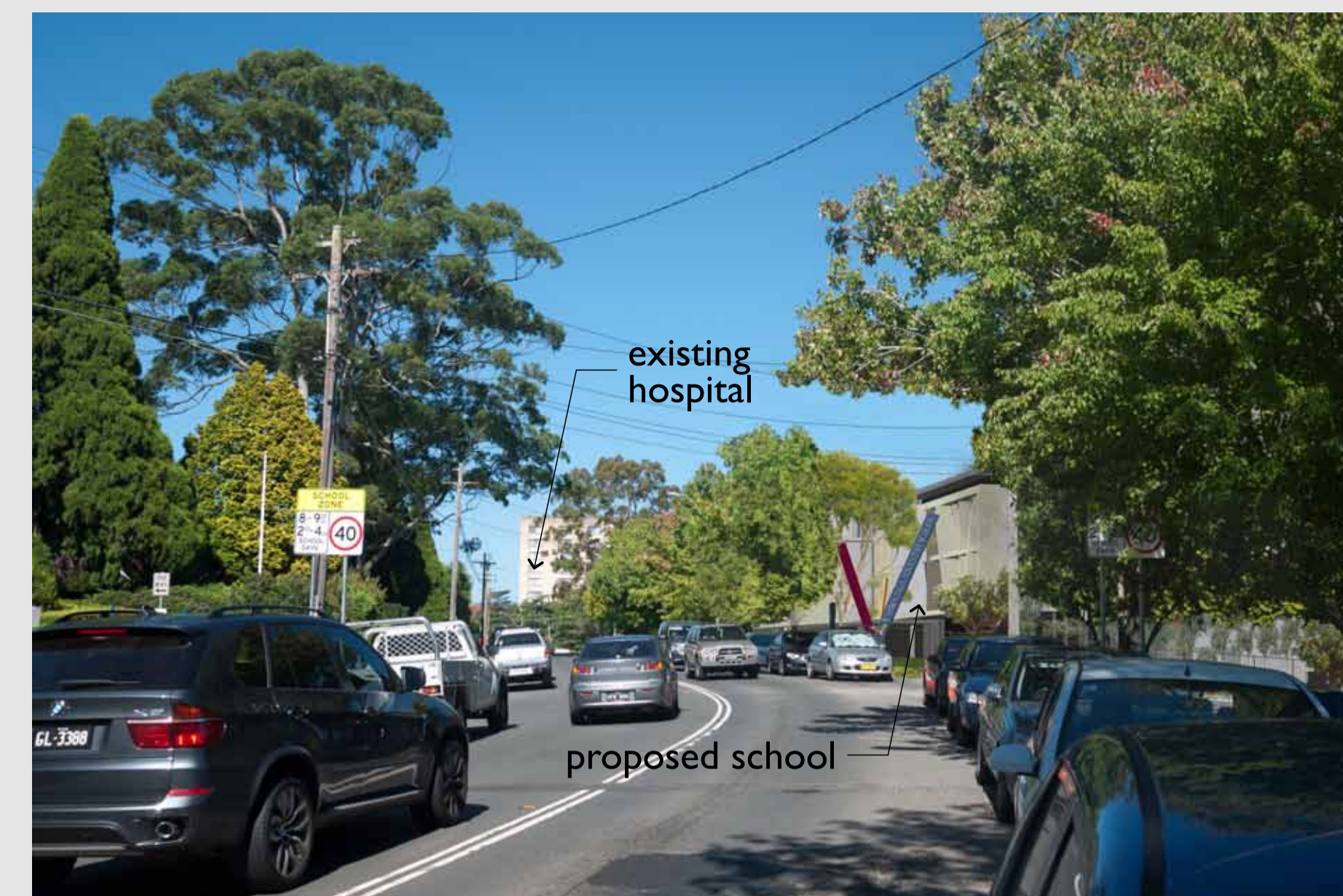
view c south along Fox Valley Road