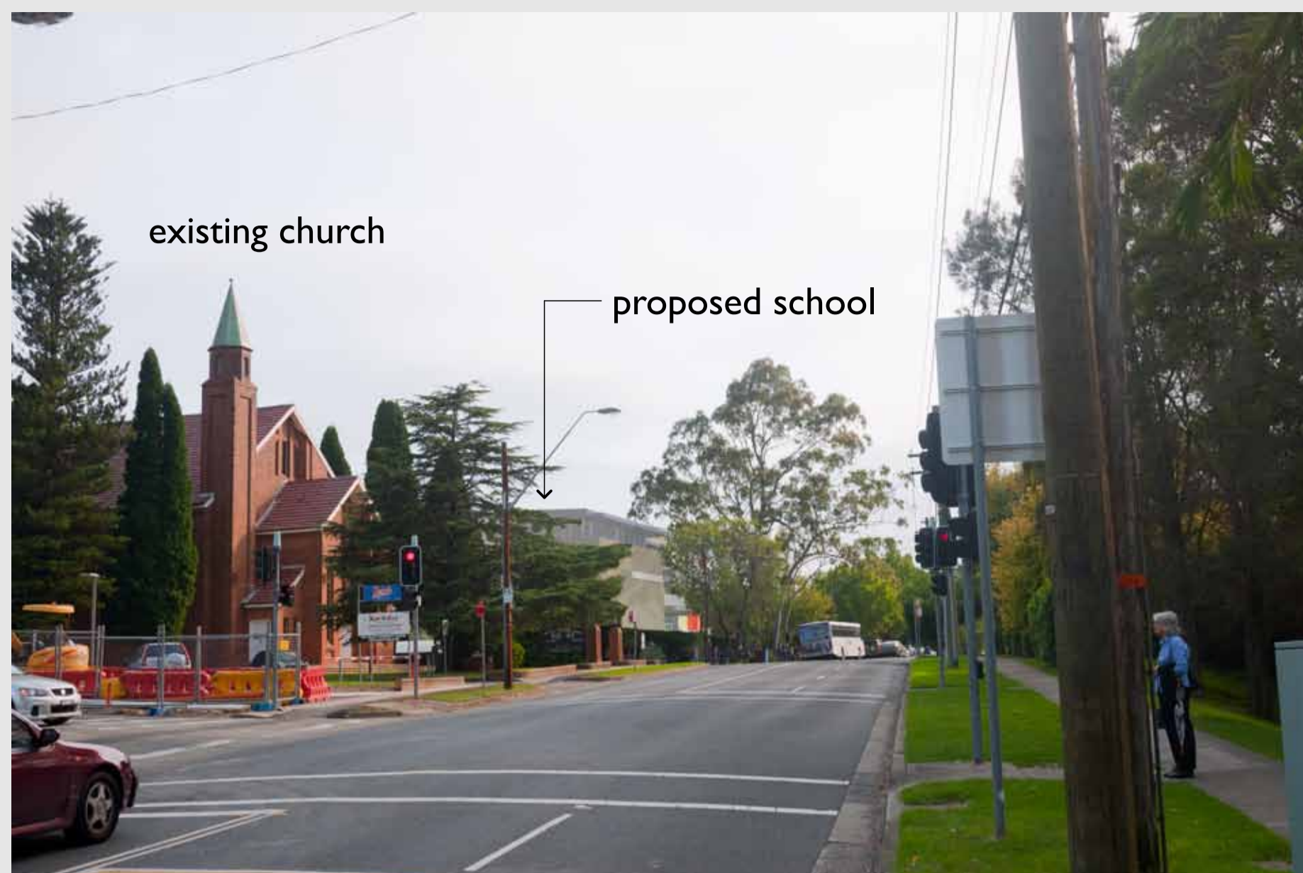
view a north along Fox Valley Road