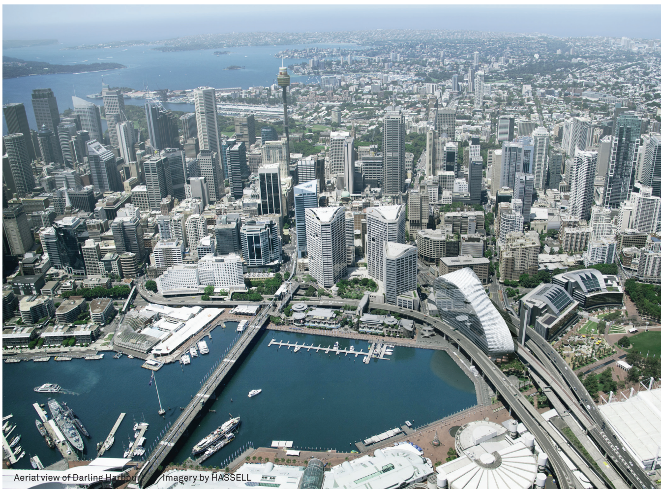
Aerial view of Darling Harbour

The Ribbon also downplays the dominant Western Distributor. With the addition of a prominent built form to the south, the highway is subdued and becomes part of the built language rather than an eyesore.