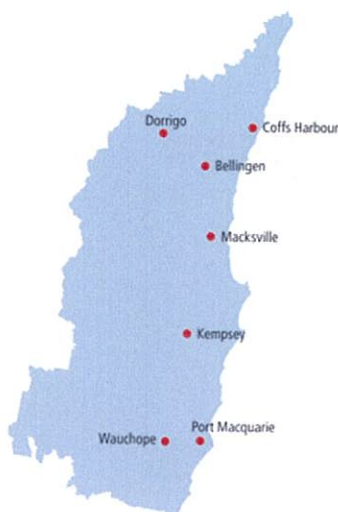
Figure 1 – Mid North Coast Local Health District

The Kempsey District Hospital is part of the Hastings Macleay Clinical Network of the Mid North Coast Local Health District, which also includes Port Macquarie Base Hospital and Wauchope District Memorial Hospital. Port Macquarie Base Hospital, the major tertiary referral hospital for Kempsey residents who require higher complexity health care services, is approximately a 50 minute drive away.