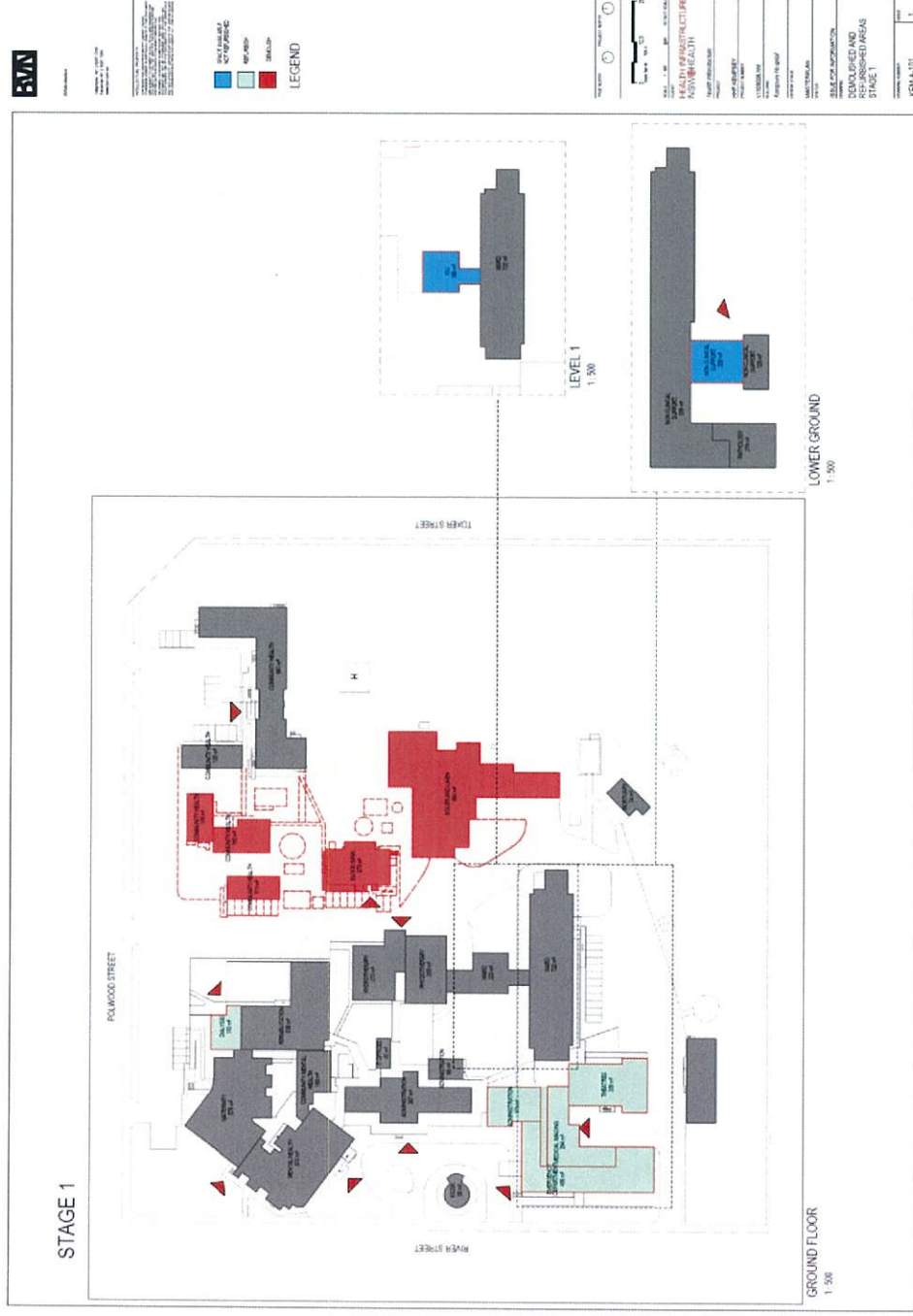
Site demolition and refurbishment plan