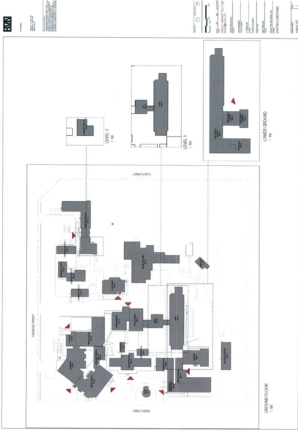
Existing building site plan