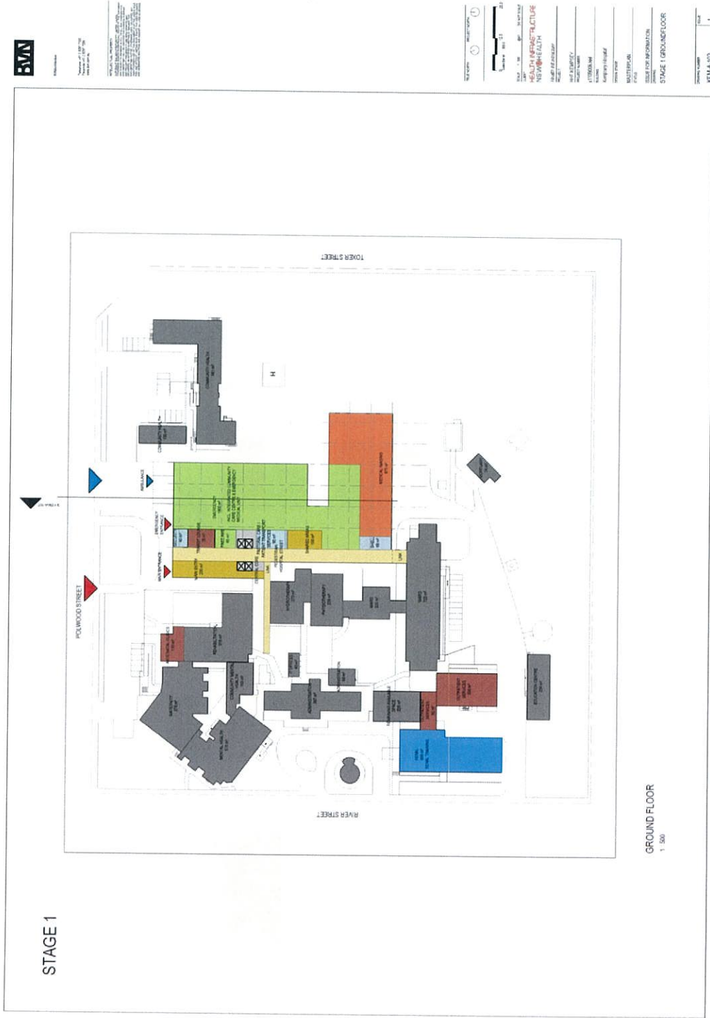
Site plan and new hospital building ground floor plan