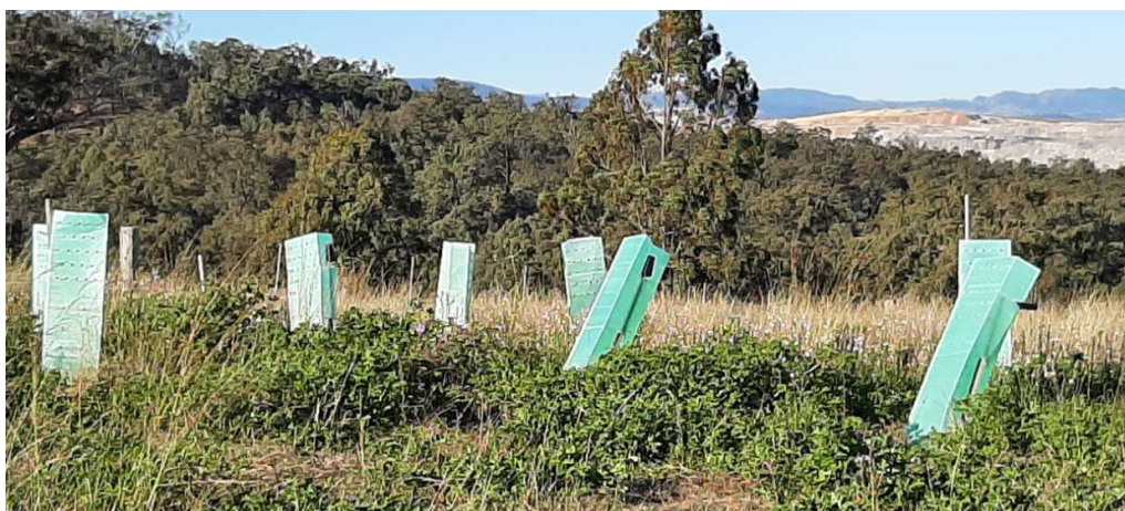
Example of tube stock planting.