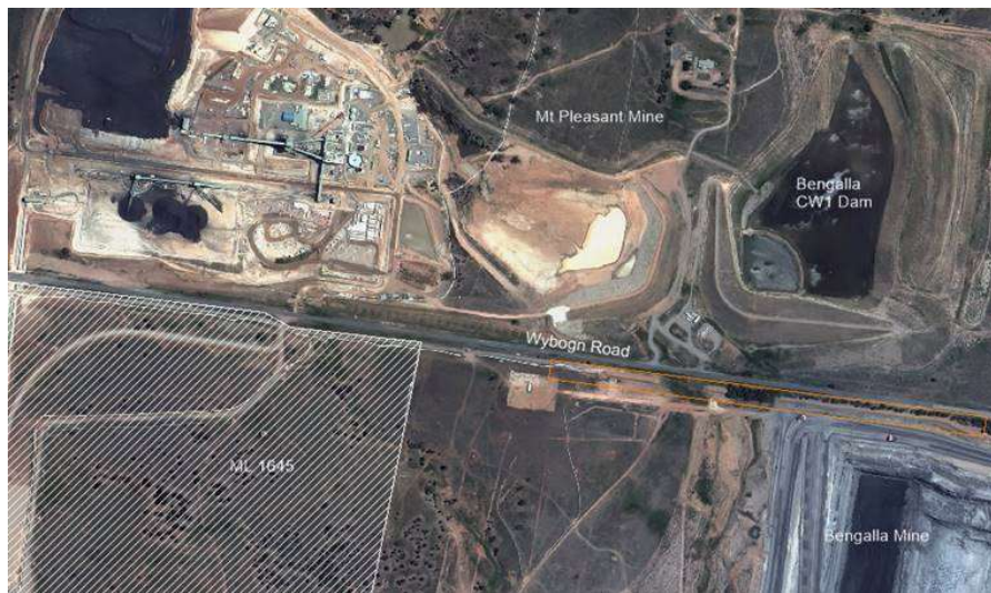
Wybong Road bund location.