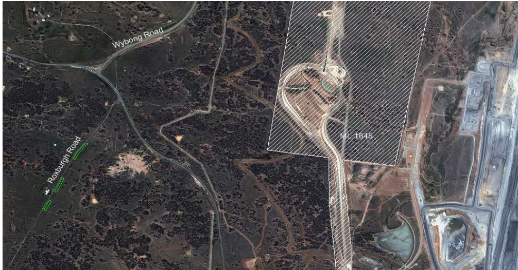
Roxburgh Road planting areas shown by green polygons.