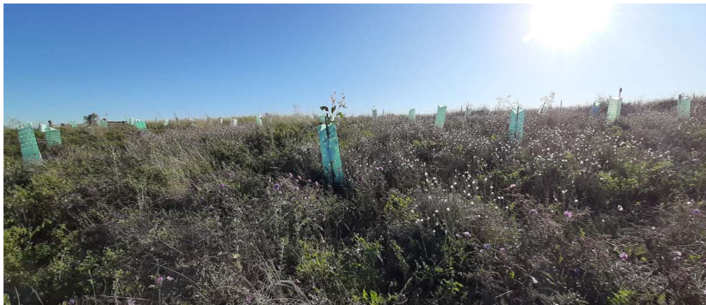
Example of tube stock planting.