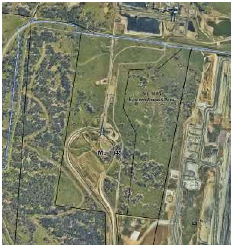
Eastern Land area overlain on aerial photo 3 September 2020.