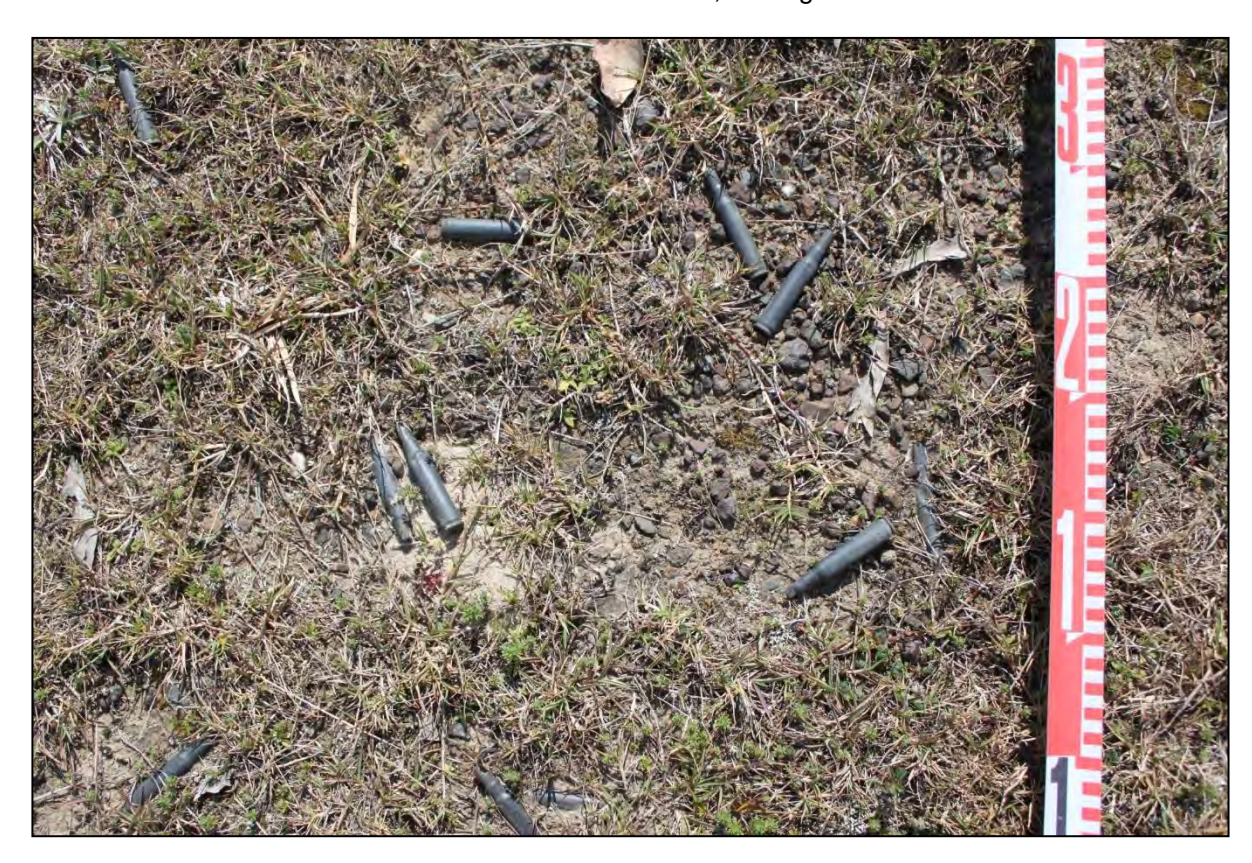
MHPAD2 - example of scatter of bullet casings on surface