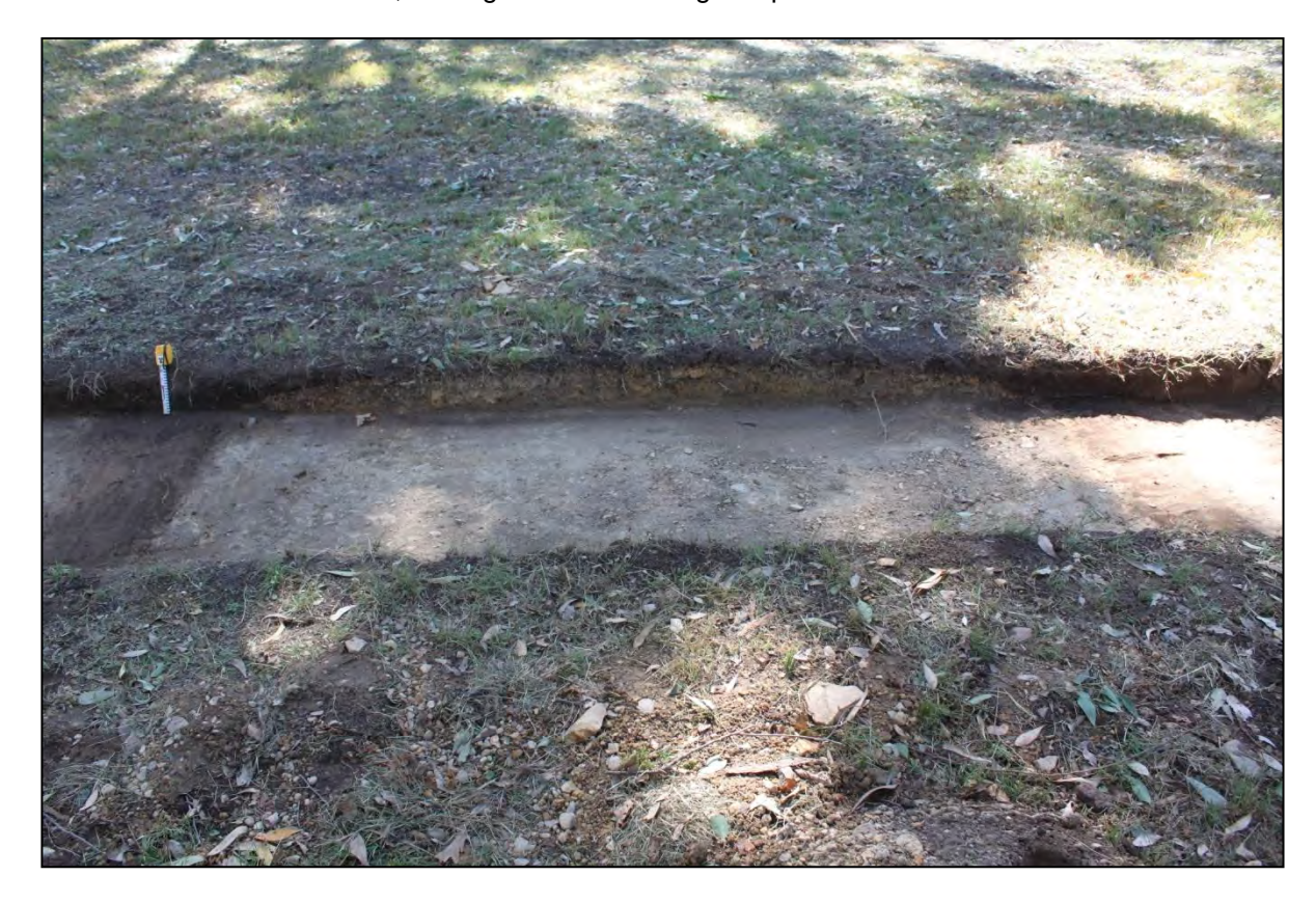
MHPAD1 Transect 5, central road feature, looking north