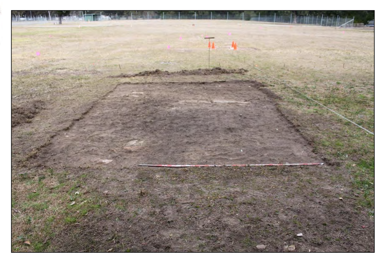
MHPAD2 - Context 1 removed across area centring on AG8 and AH8