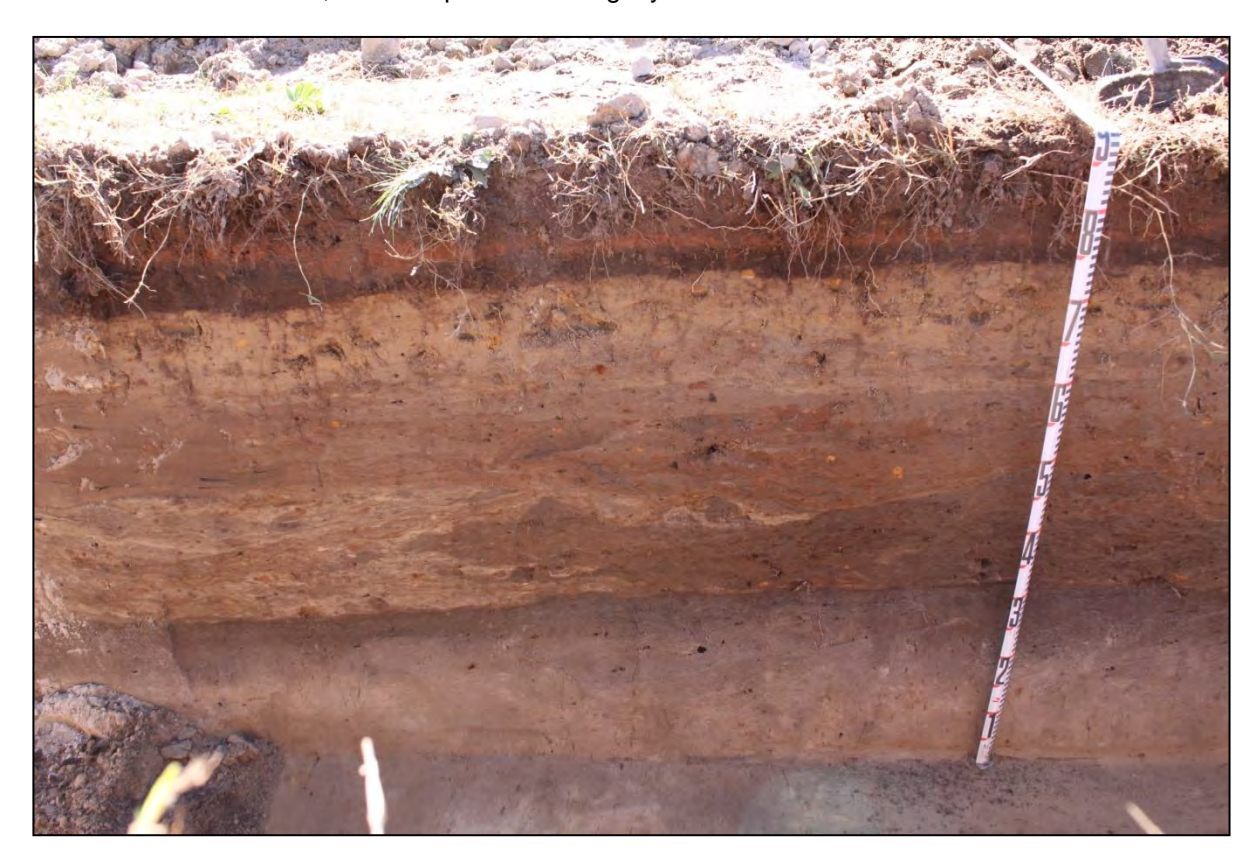
MHPAD1 Transect 8, northern profile showing layers of fill over old soil horizon