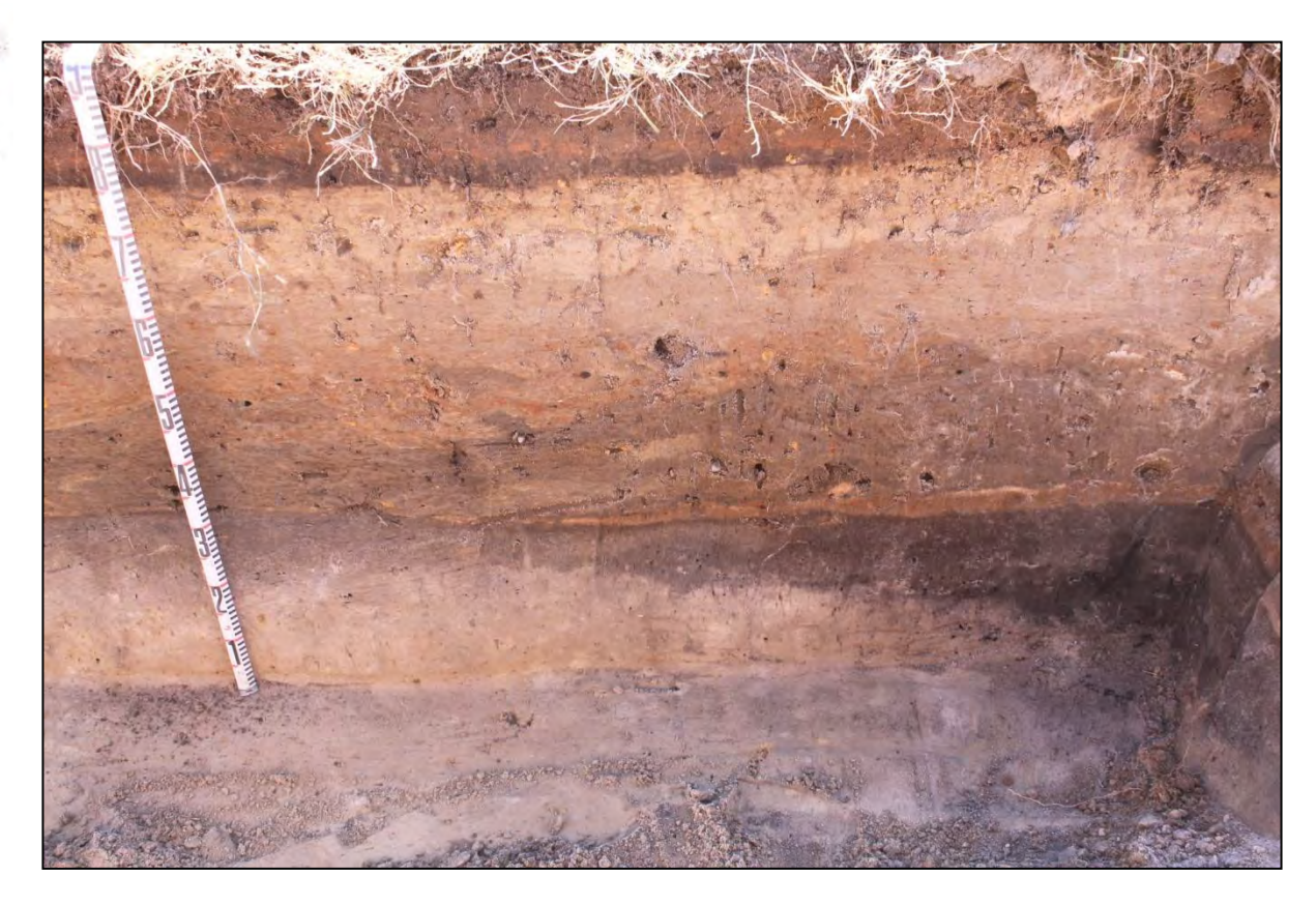
MHPAD1 Transect 8, northern profile showing layers of fill over old soil horizon - eastern end