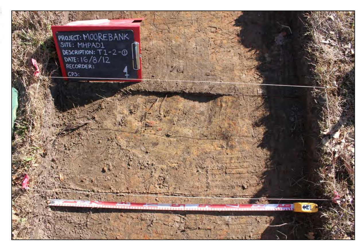
MHPAD1 Transect 1, Square 2, Context 1