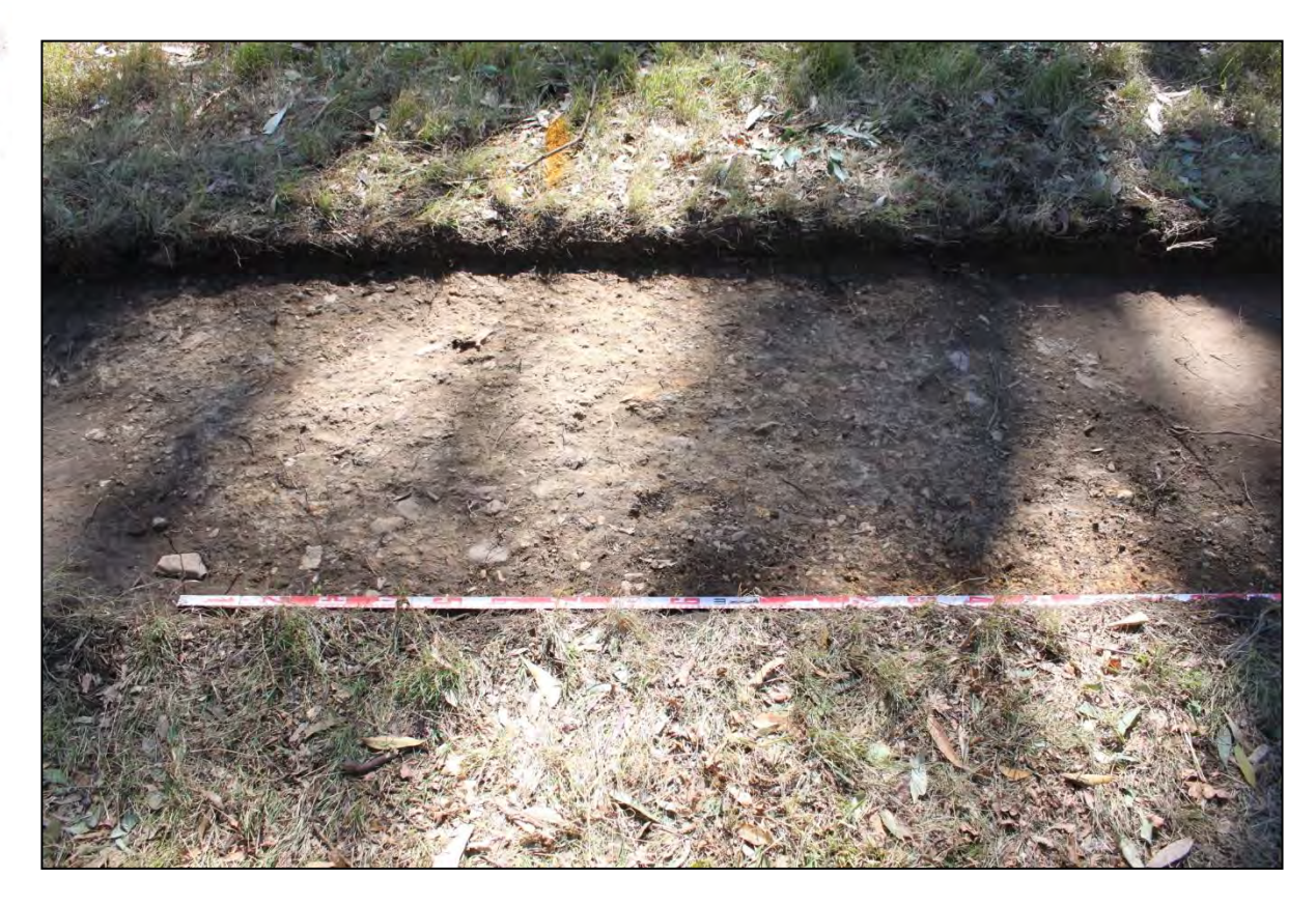
MHPAD1 Transect 5, diagonal pathway at western end of transect