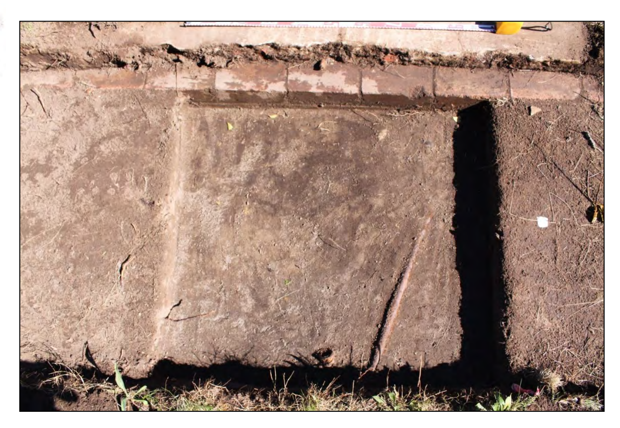
MHPAD1 Transect 3, Square 44, Context 9