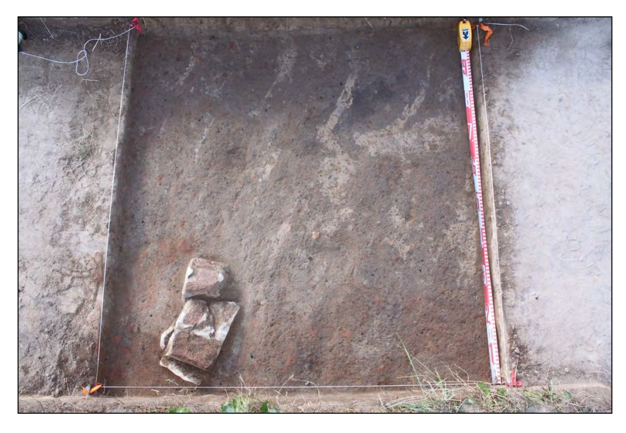
MHPAD1 Transect 2, Square 17, end of Context 4