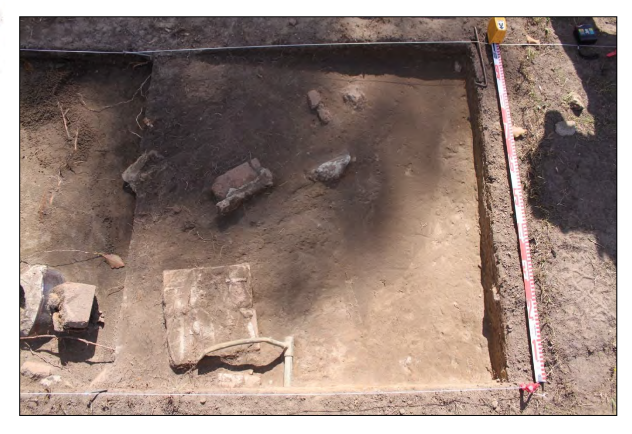
MHPAD2 - AH8a - Context 9, looking north