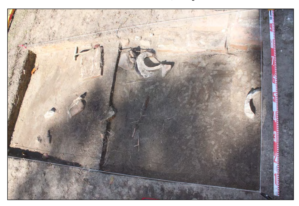
MHPAD2 - AG8a and AH8a- Context 9, looking south