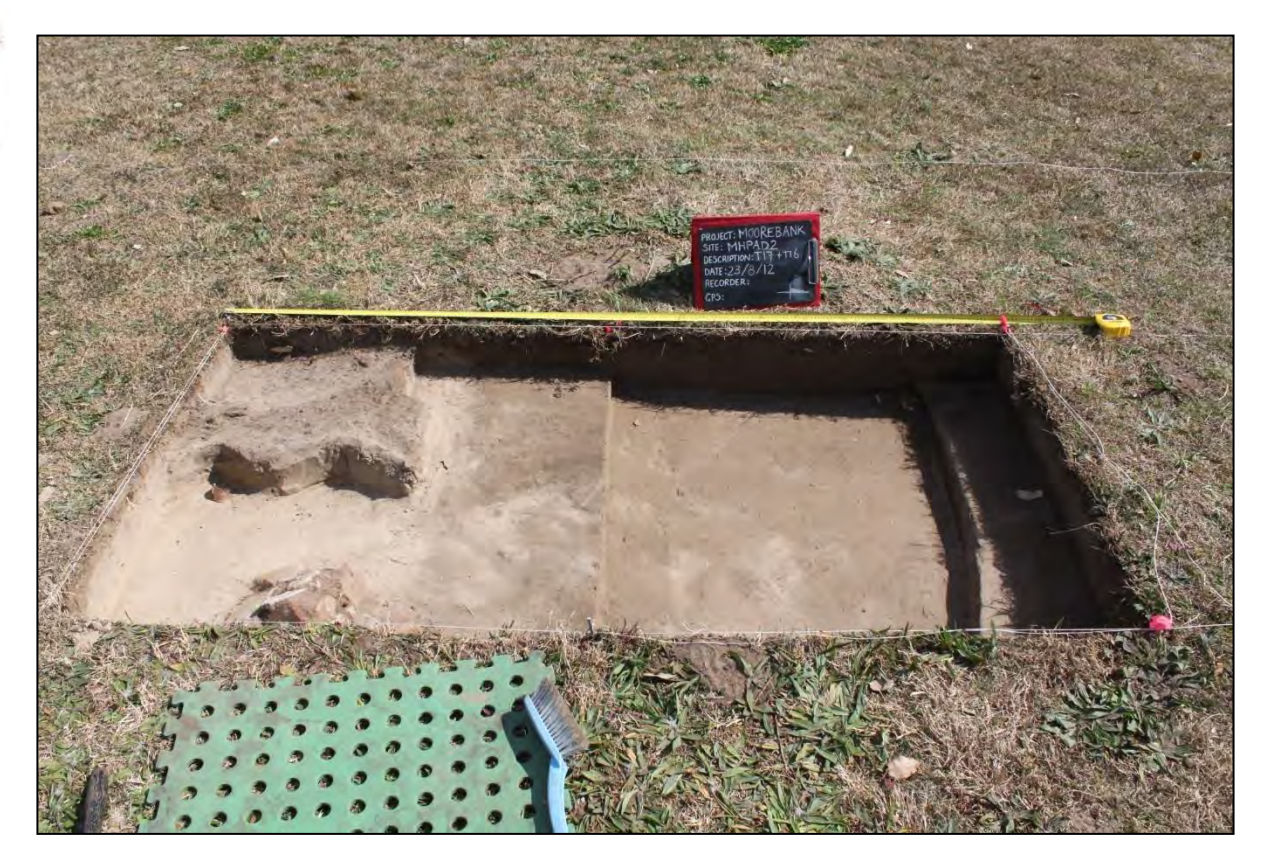
MHPAD2 - T167 and T17 Contexts 5 and 11, looking west