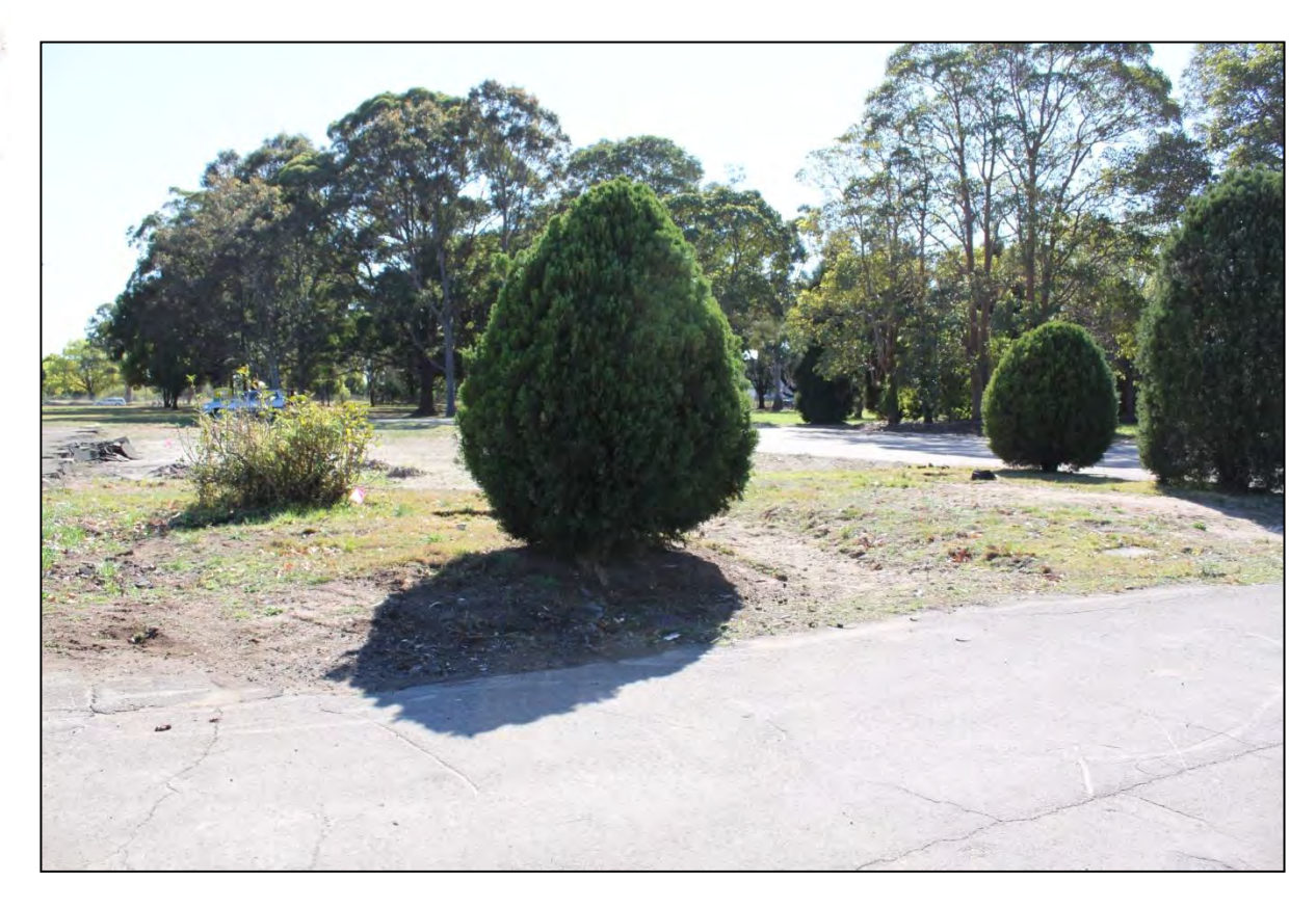
MHPAD3, garden area where hand excavation was conducted, looking northeast