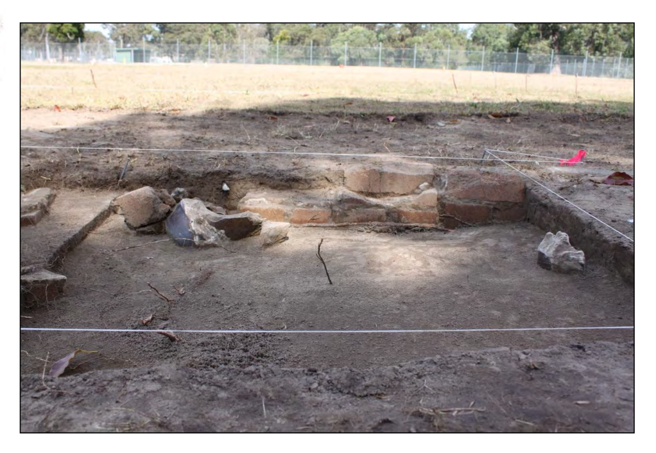
MHPAD2 - AG8a - Context 9, looking south