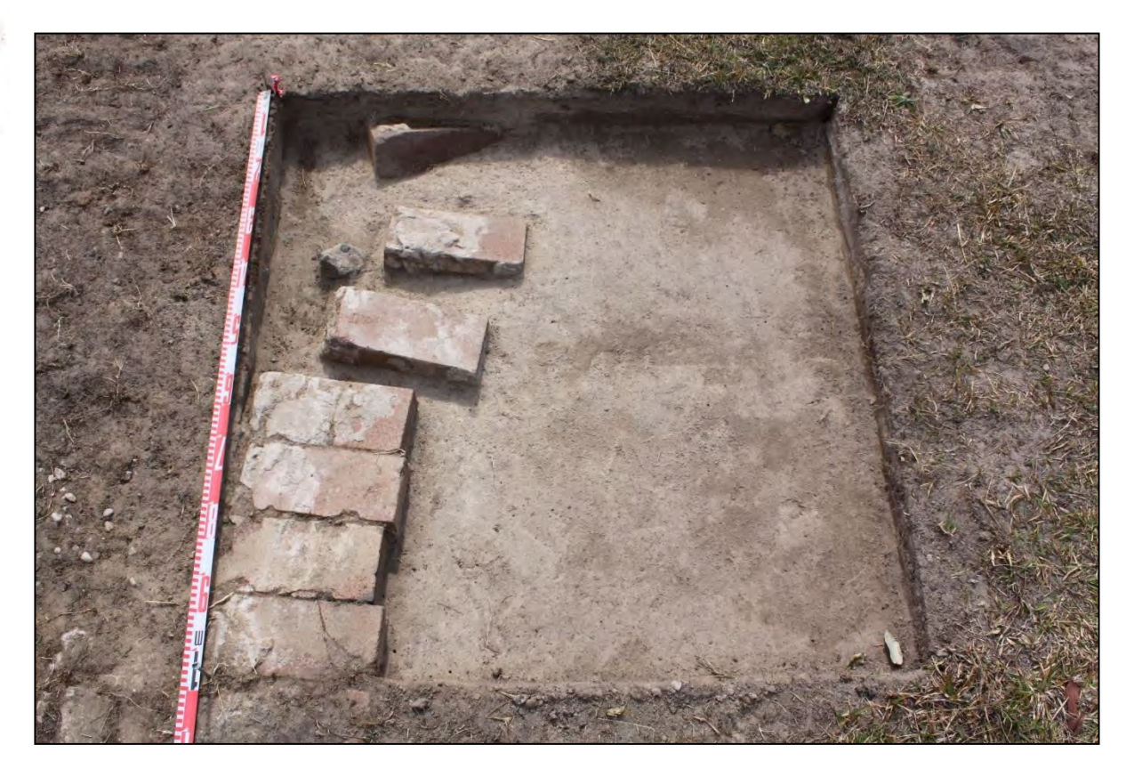
MHPAD2 - AE19 Context 3, looking north