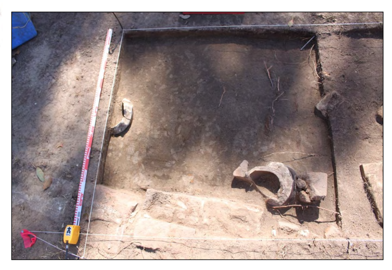
MHPAD2 - AG8a - Context 9, looking north