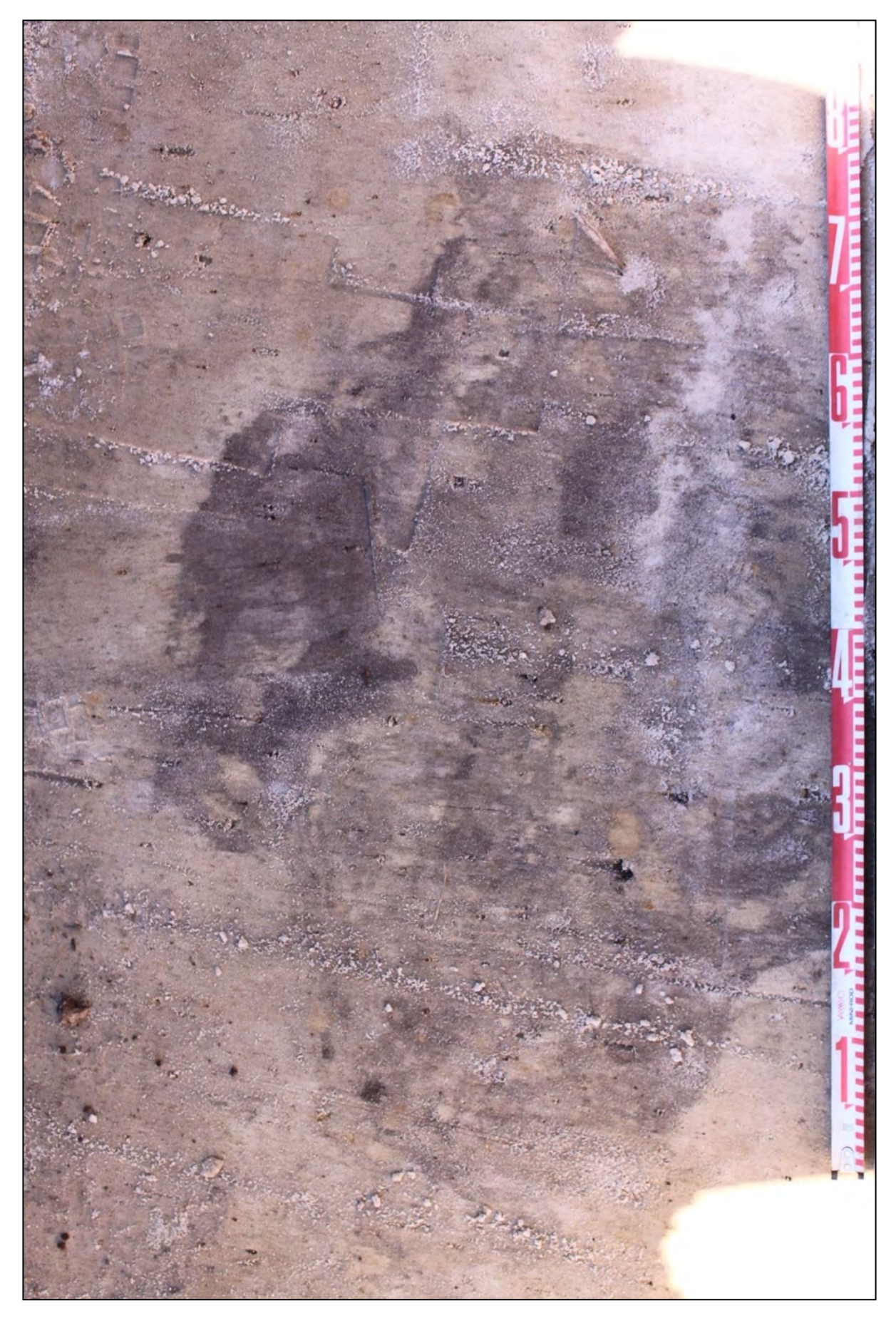
MHPAD1 Transect 8, cross-shaped feature exposed below old soil horizon