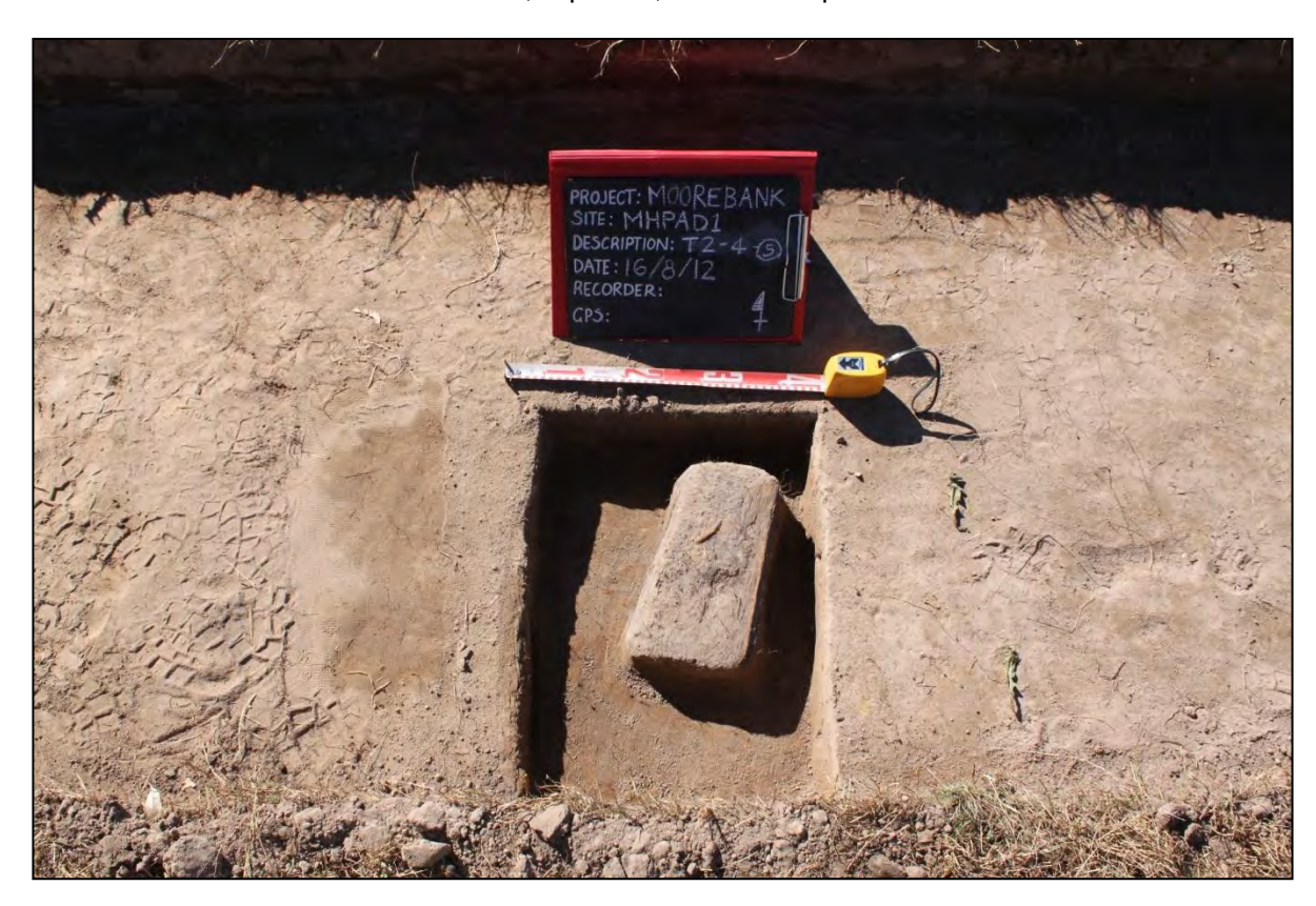
MHPAD1 Transect 2, Square 4, Context 5