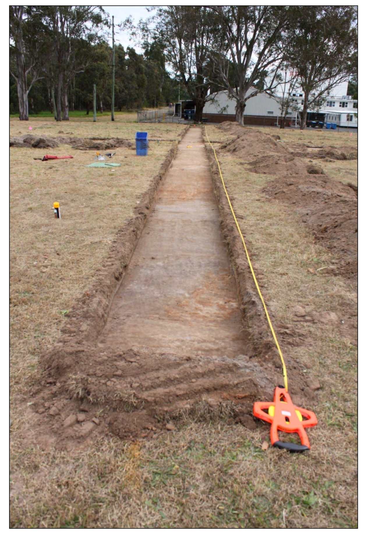
MHPAD1 Transect 2, looking west