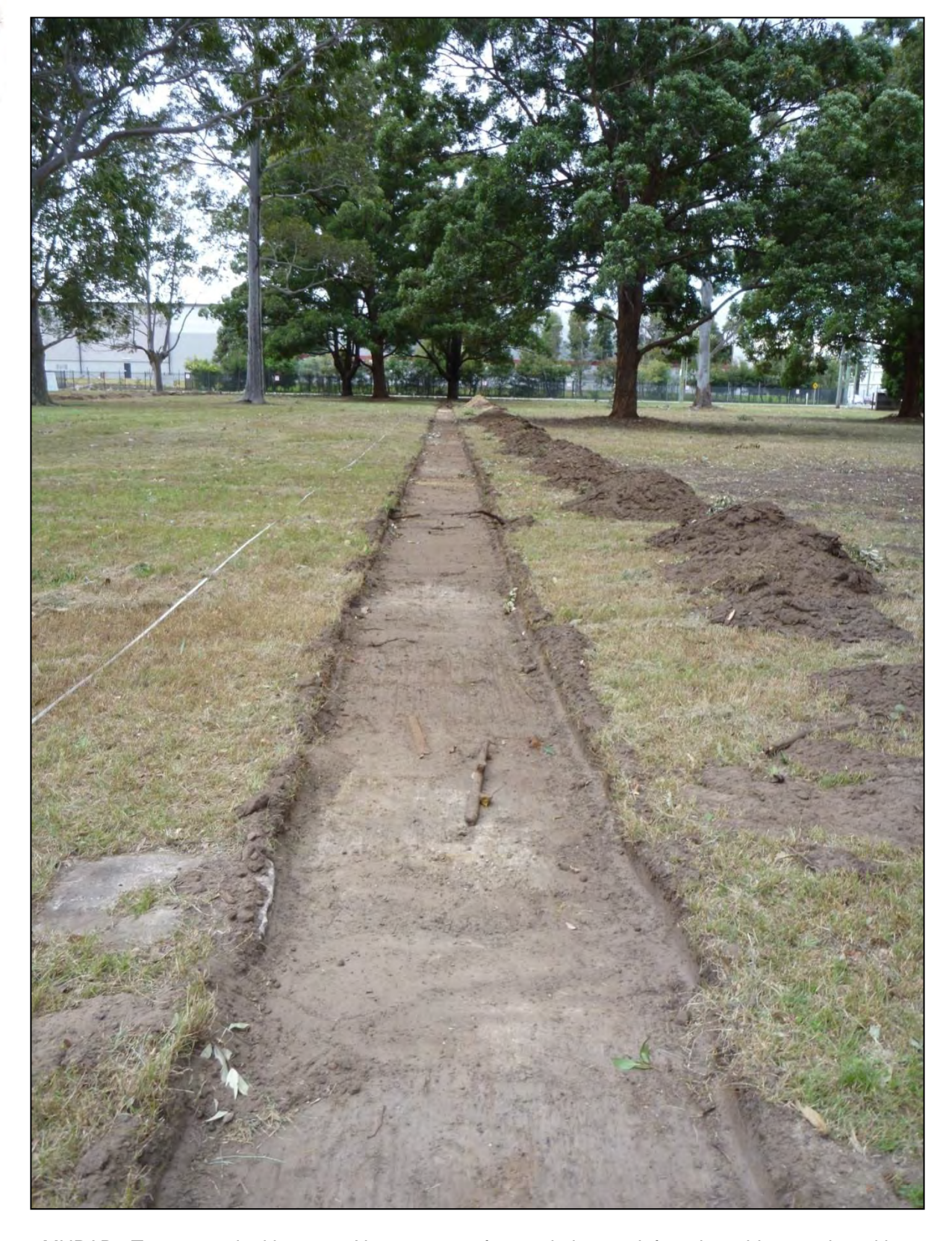
MHPAD1 Transect 6, looking east. Note concrete feature in bottom left and machine gun barrel in middle of trench