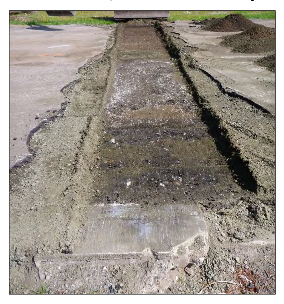
MHPAD3 Transect 1 Cut 2, looking west