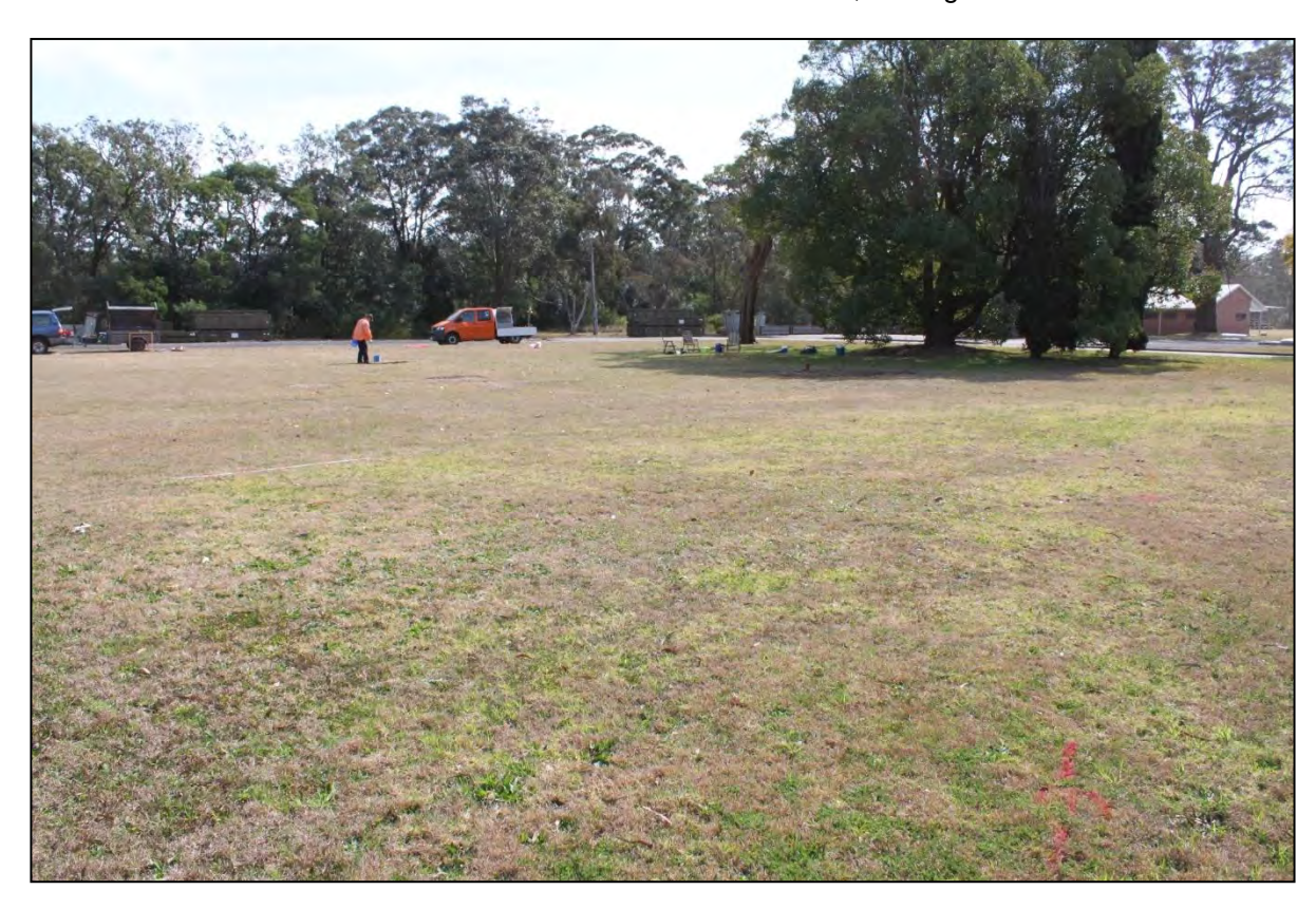
MHPAD2, general view across northern half, looking northwest