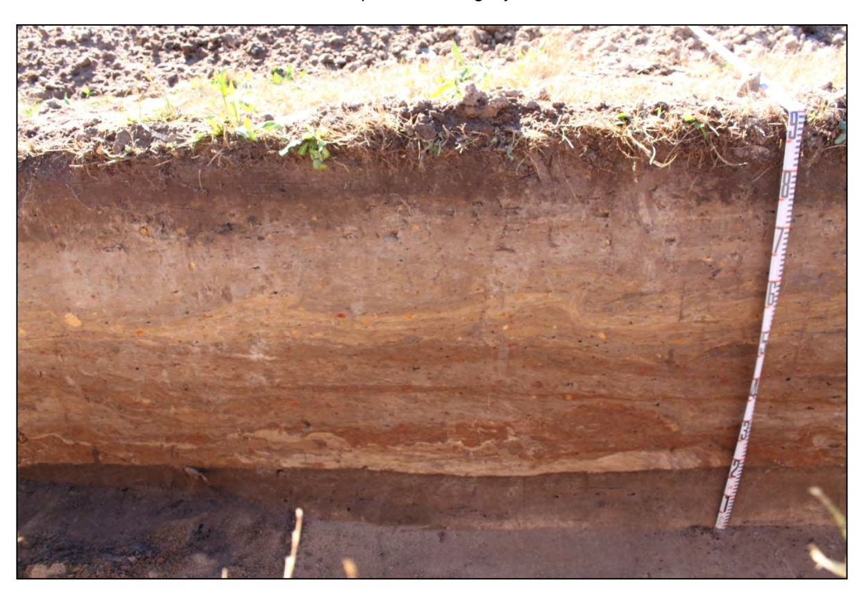
MHPAD1 Transect 8, northern profile showing layers of fill over old soil horizon