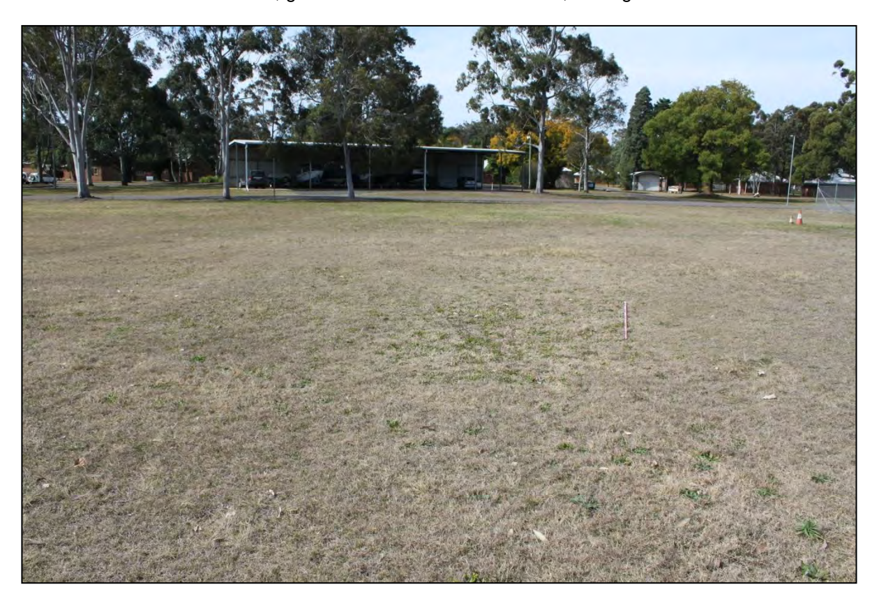
MHPAD2, general view across southern half, looking east