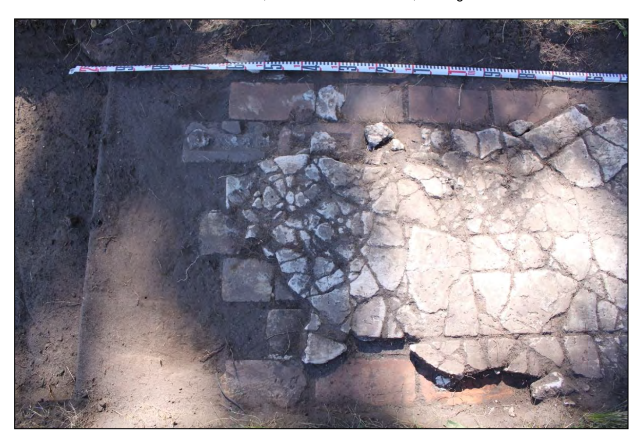
MHPAD1 Transect 7, details of concrete and brick floor, looking south