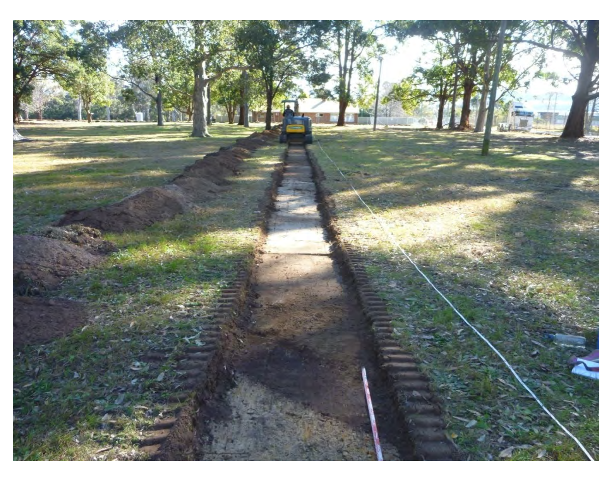
MHPAD1 Transect 5, looking west across diagonal path towards central road feature