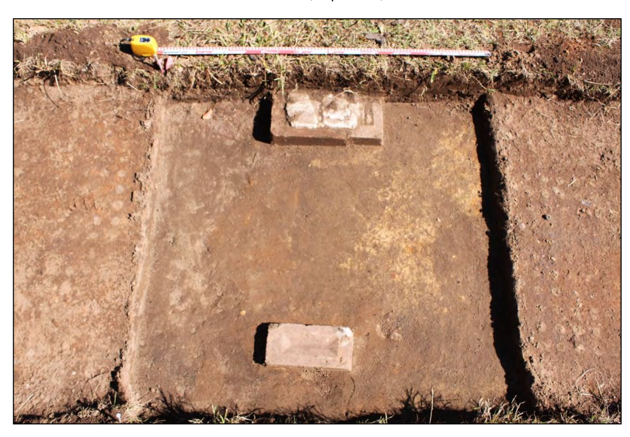
MHPAD1 Transect 3, Square 78, Context 11