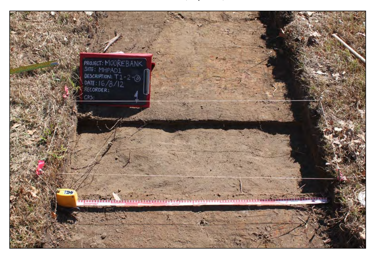
MHPAD1 Transect 1, Square 2, Context 3