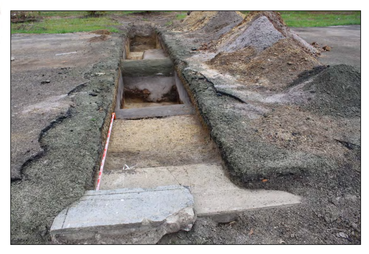
MHPAD3 Transect 1 at completion of mechanical excavation, looking west