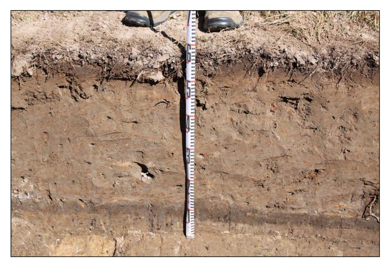
MHPAD1 Transect 9, portion of southern profile showing layers of fill over old soil - horizon