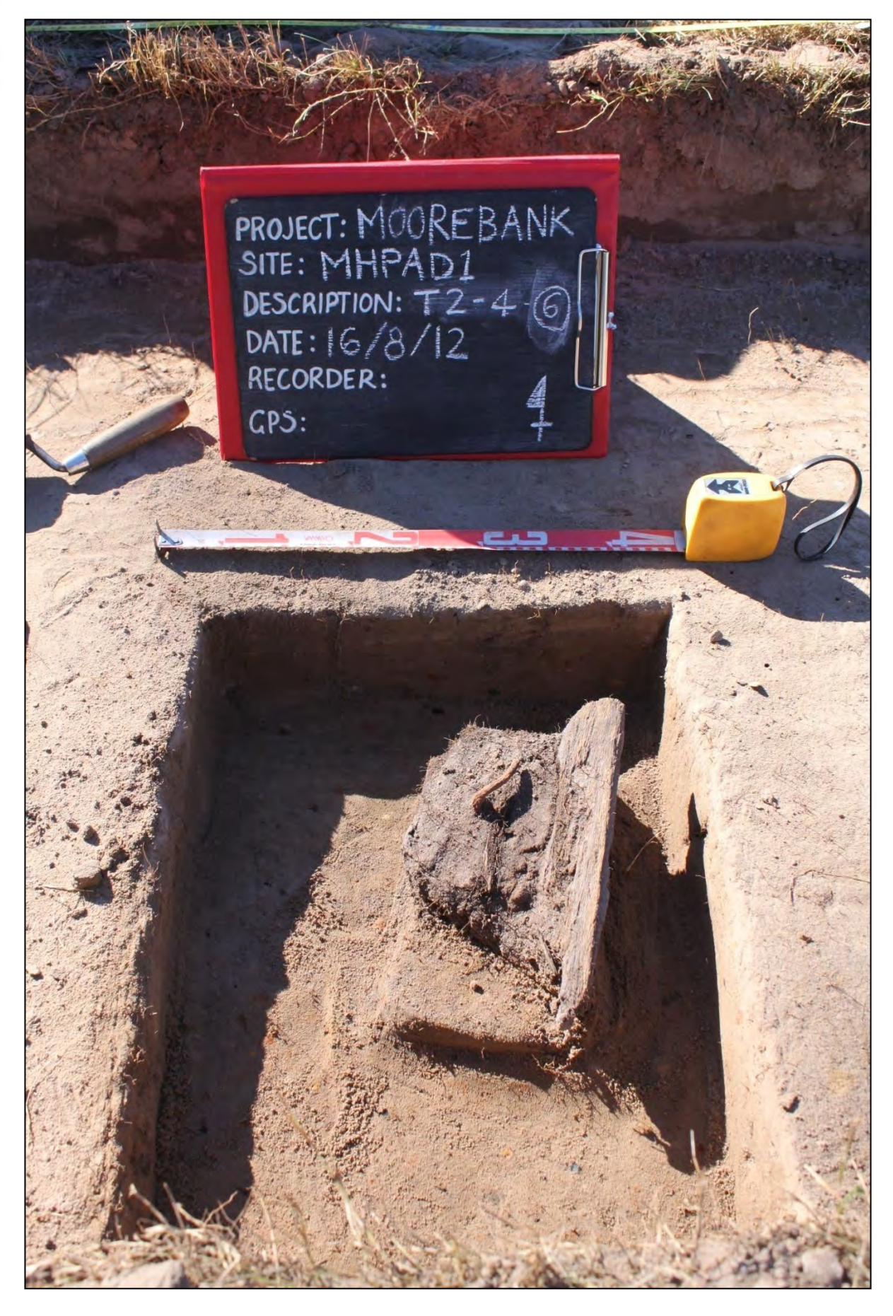
MHPAD1 Transect 2, Square 4, Context 6