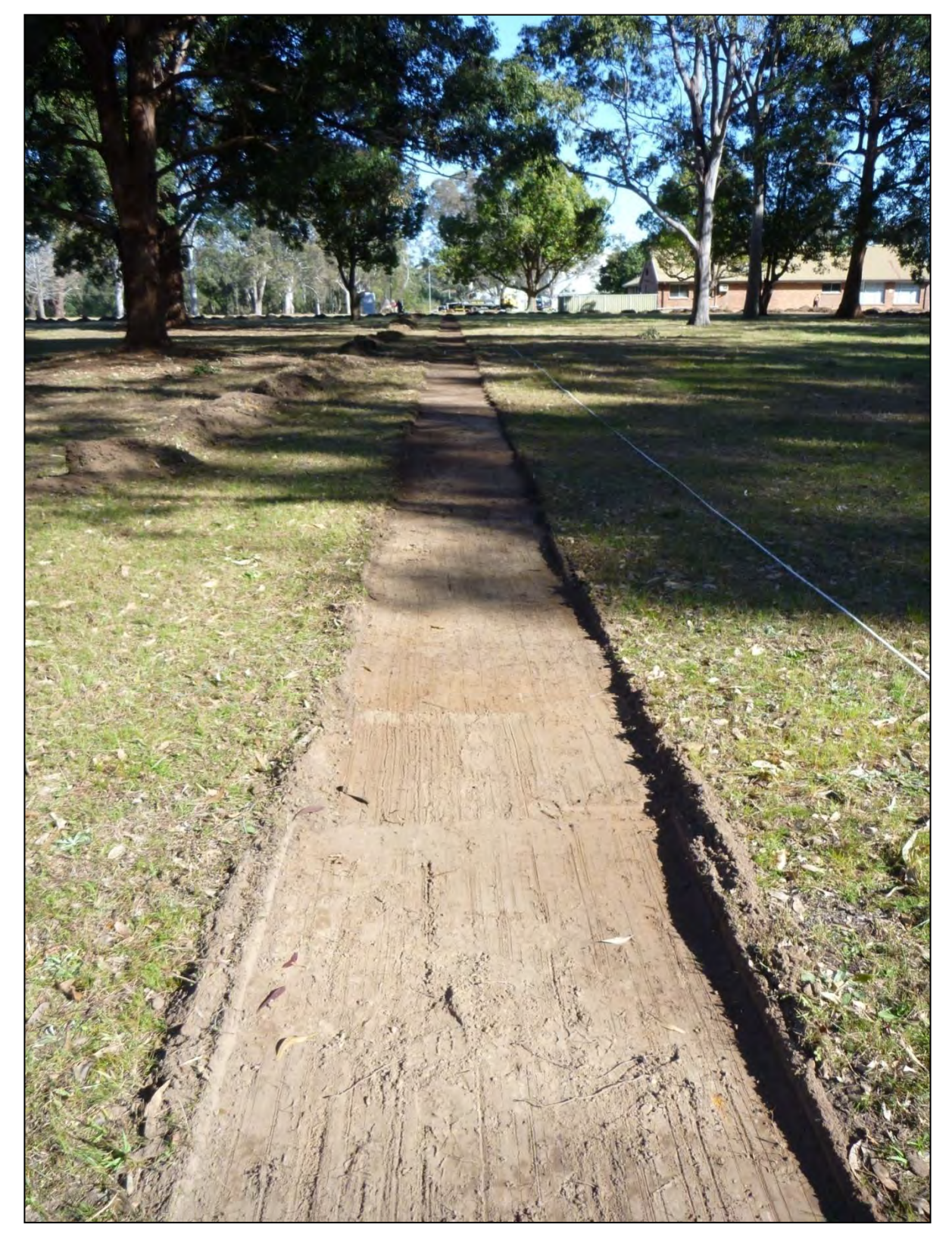
MHPAD1 Transect 6, looking west