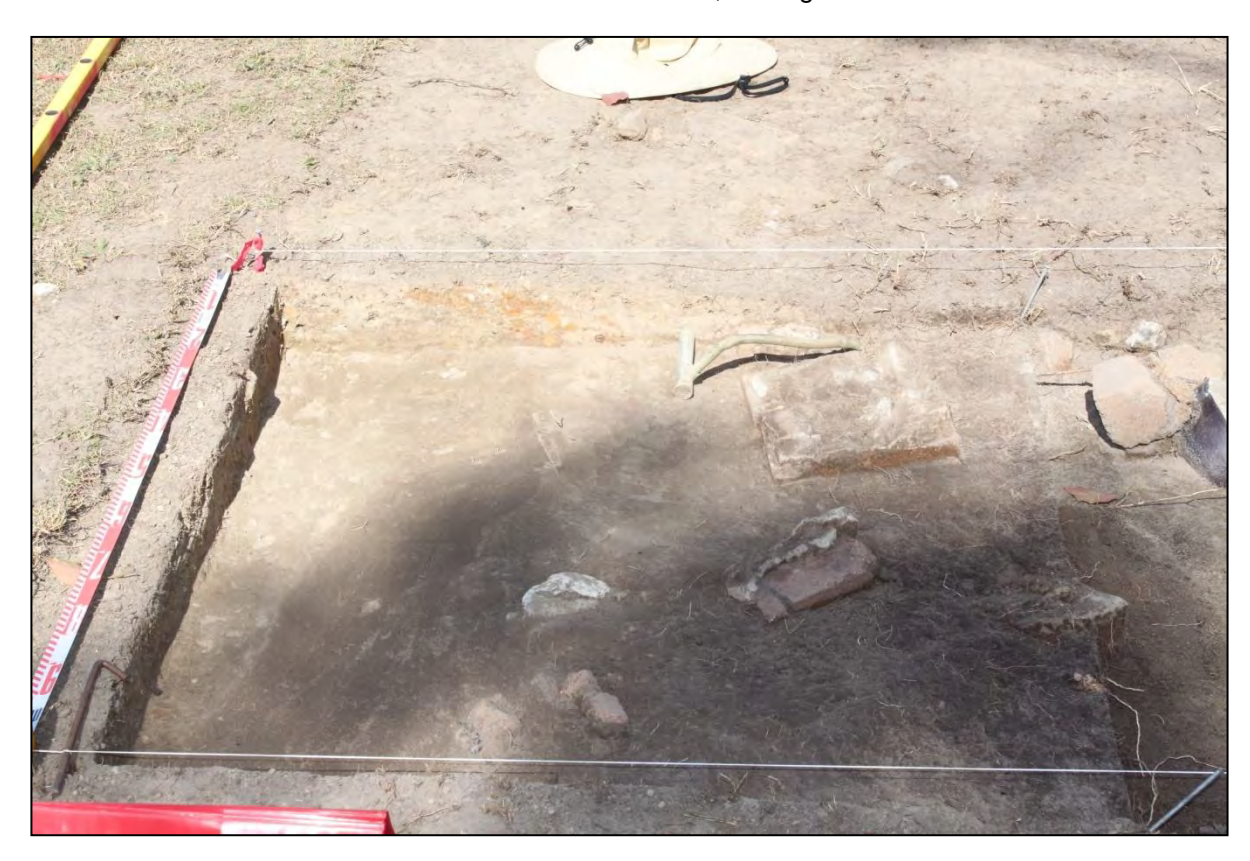
MHPAD2 - AH8a - Context 9, looking south