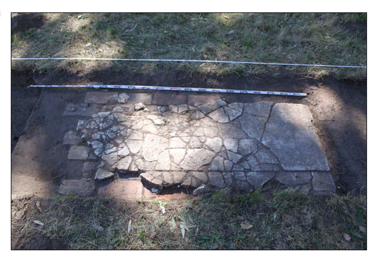
MHPAD1 Transect 7, concrete and brick floor, looking south