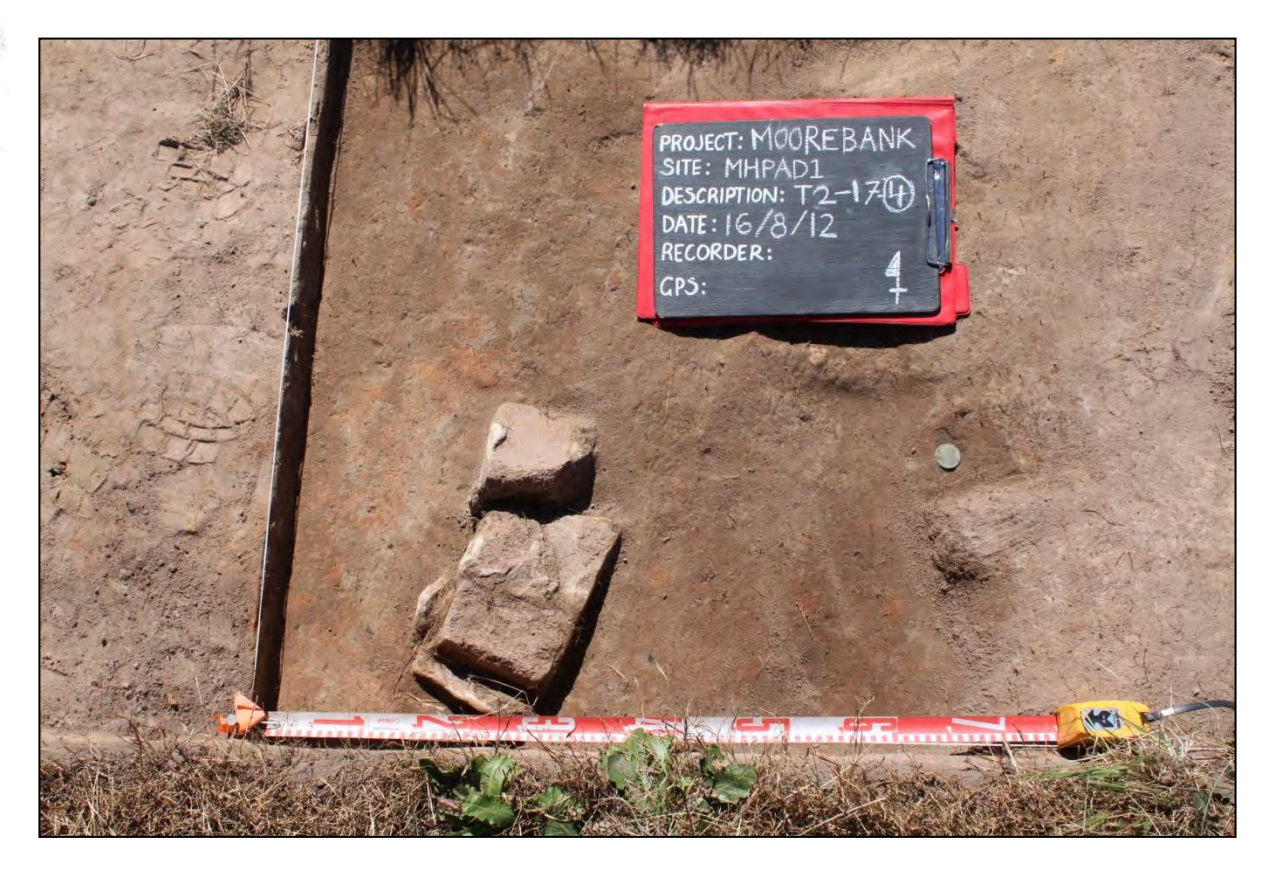
MHPAD1 Transect 2, Square 17, Context 4