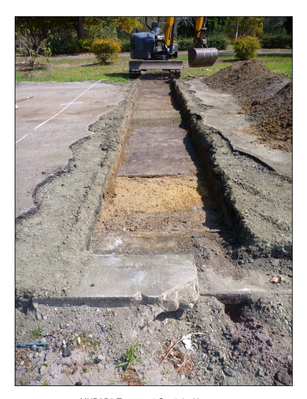
MHPAD3 Transect 1 Cut 4, looking west