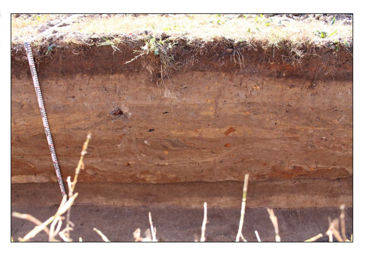
MHPAD1 Transect 8, northern profile showing layers of fill over old soil horizon