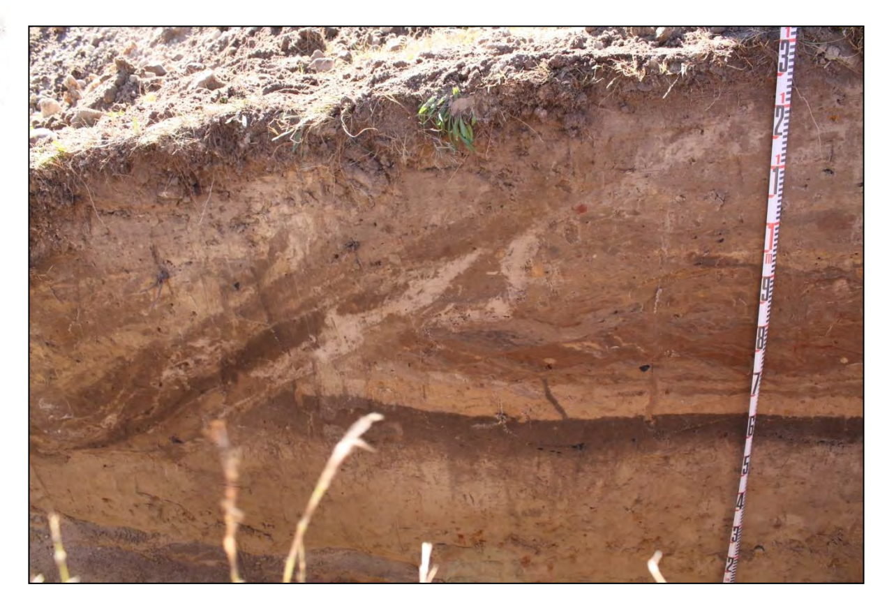
MHPAD1 Transect 8, northern profile showing layers of fill over old soil - horizon western end