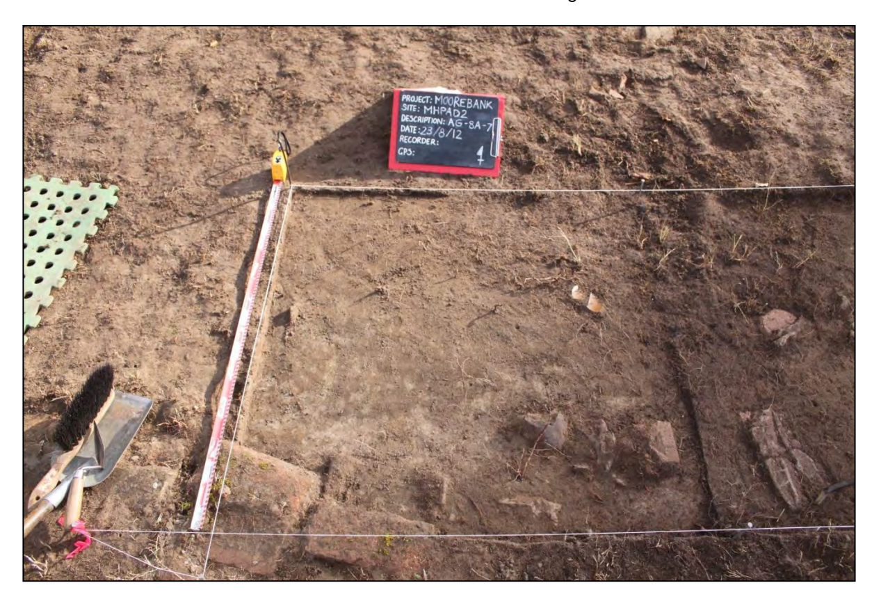
MHPAD2 - AG8a - Context 7