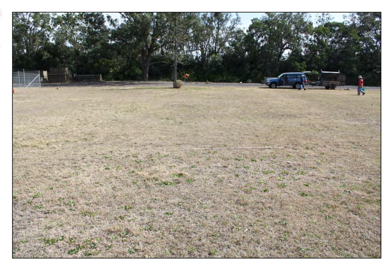
MHPAD2, general view across southern half, looking west