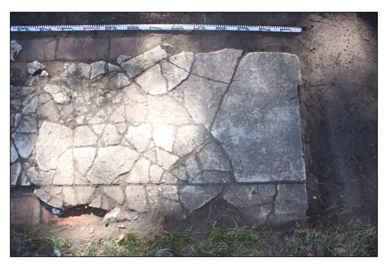
MHPAD1 Transect 7, details of concrete and brick floor, looking south