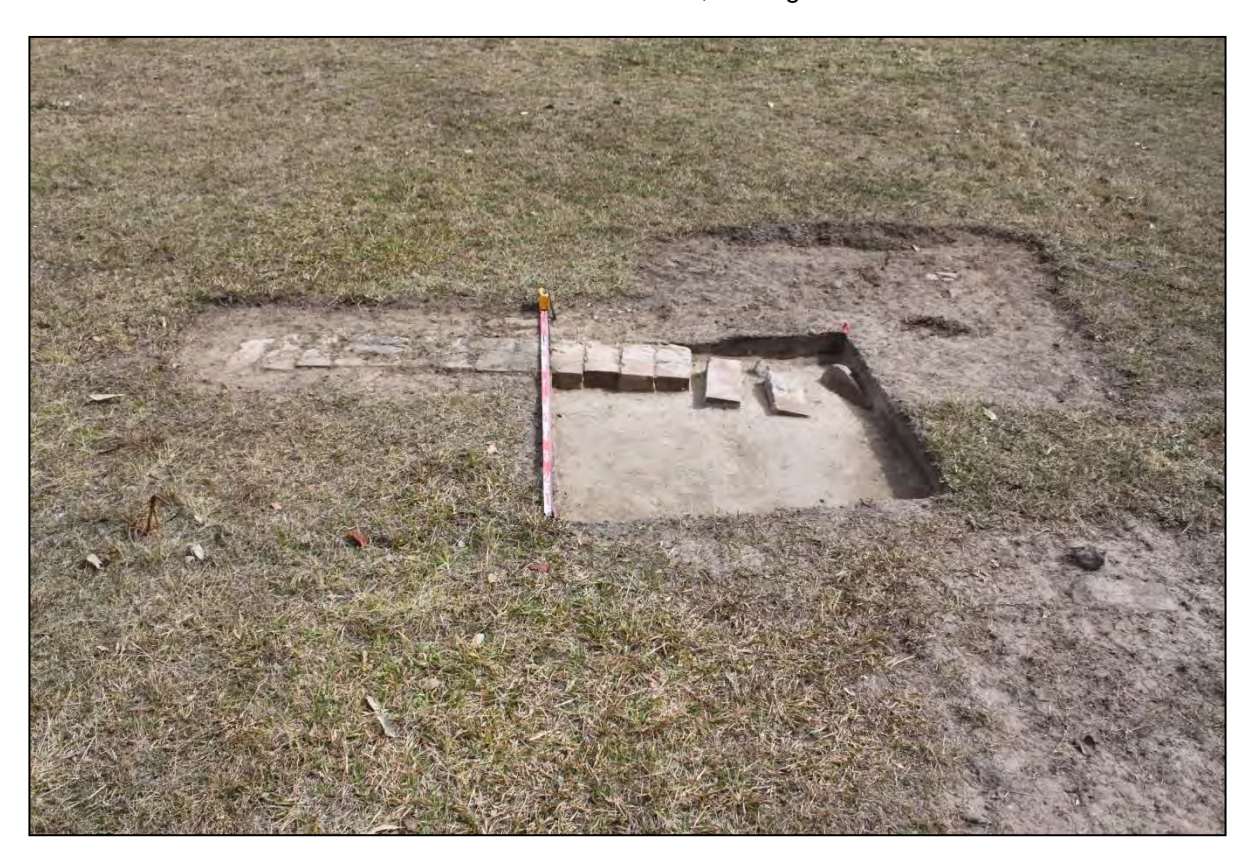
MHPAD2 - AE19 Context 3, looking west