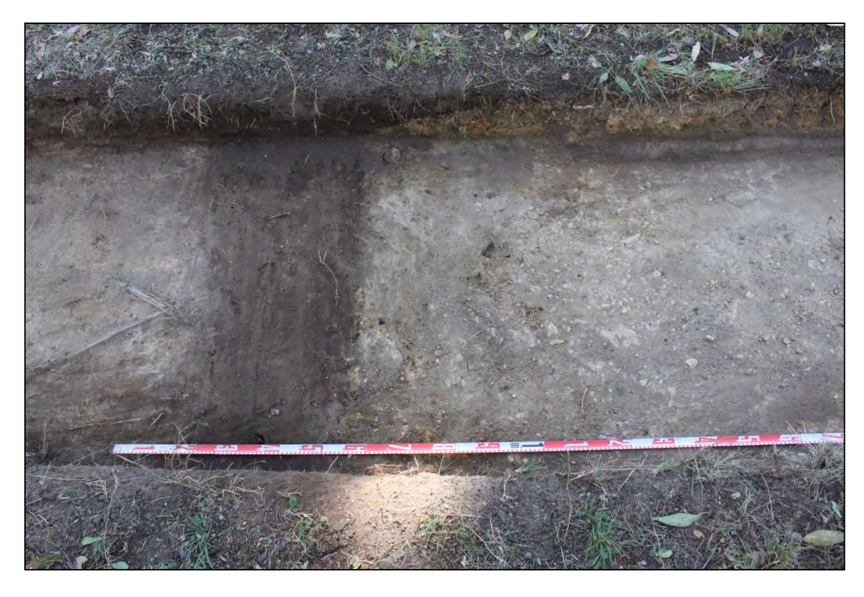
MHPAD1 Transect 5, western edge of central road feature