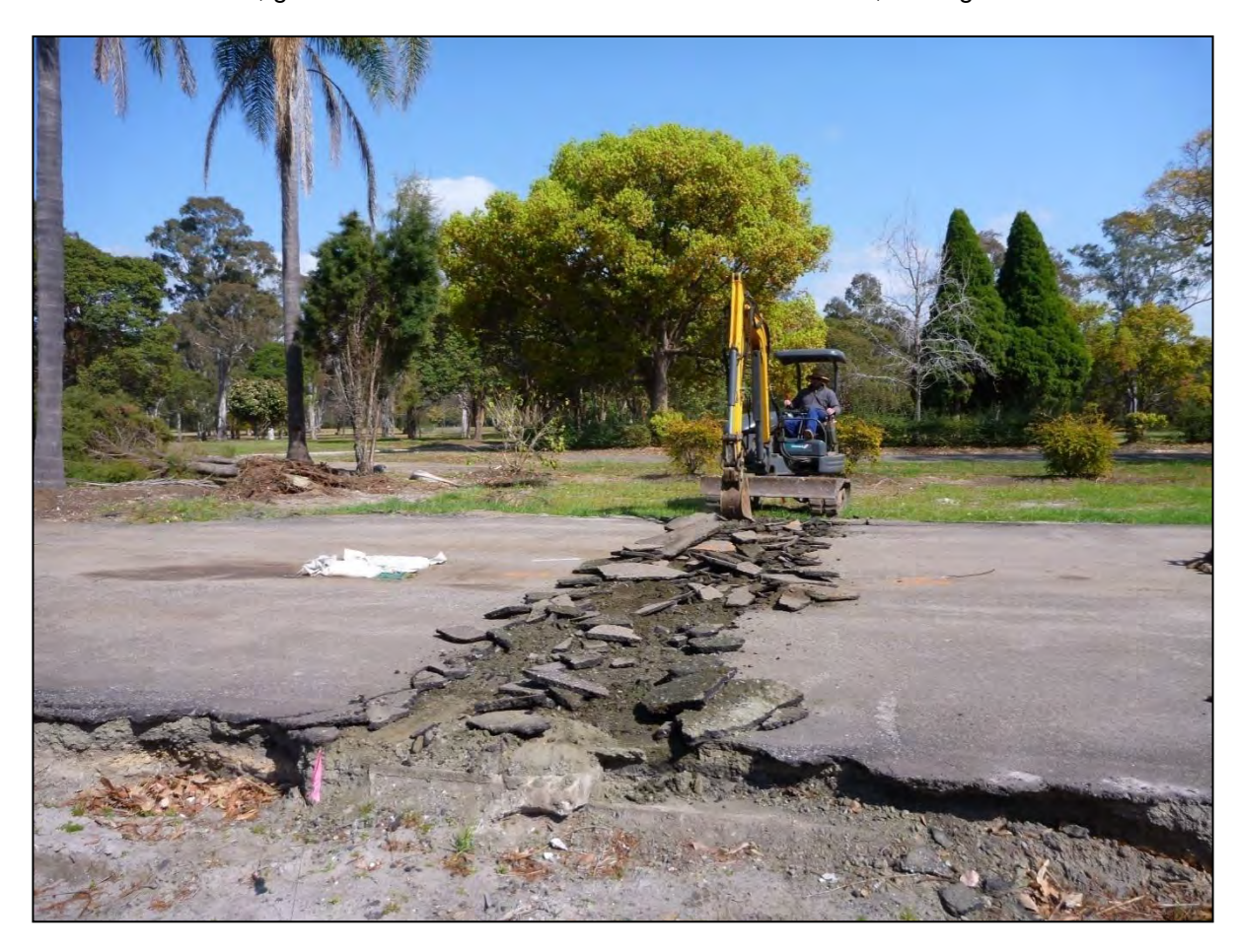
MHPAD3 Transect 1, removal of road surface, looking west