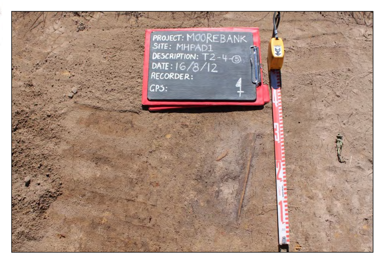
MHPAD1 Transect 2, Square 4, Context 5 – prior to excavation