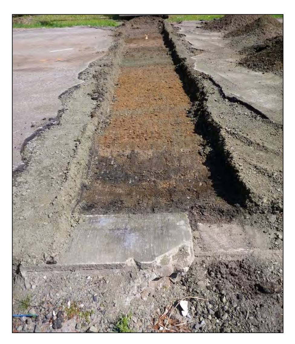
MHPAD3 Transect 1 Cut 3, looking west