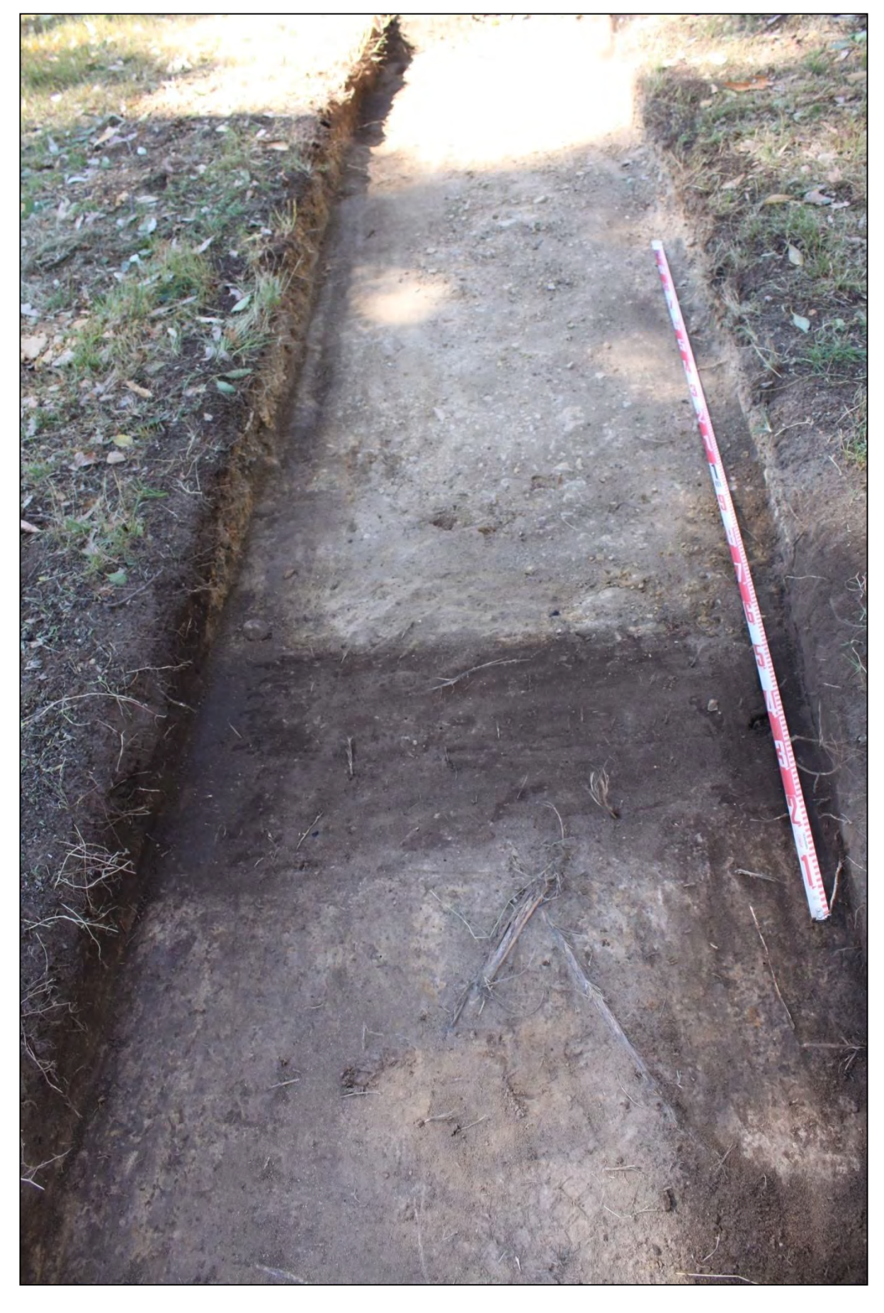
MHPAD1 Transect 5, central road feature, looking east