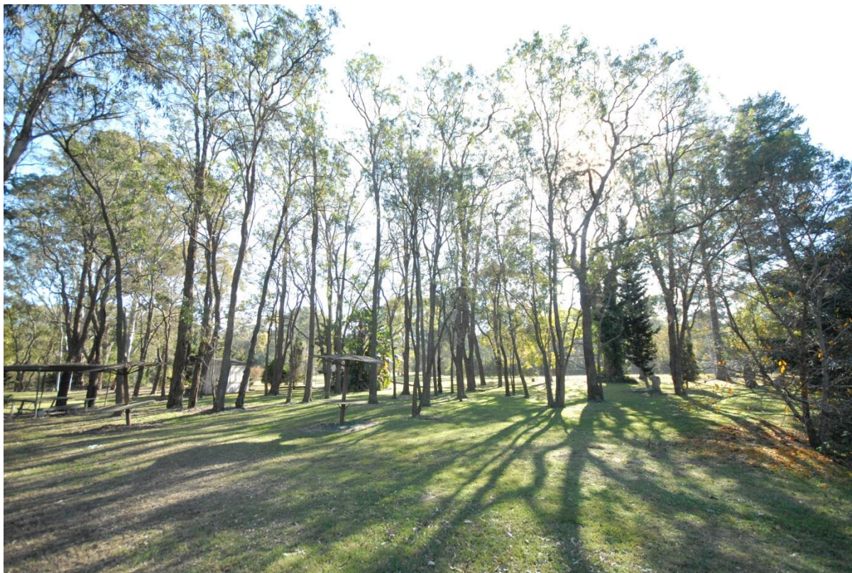
Figure 9.8 Looking N across picnic facilities and towards commemorative section of garden (far right), (image no. CG 0009)