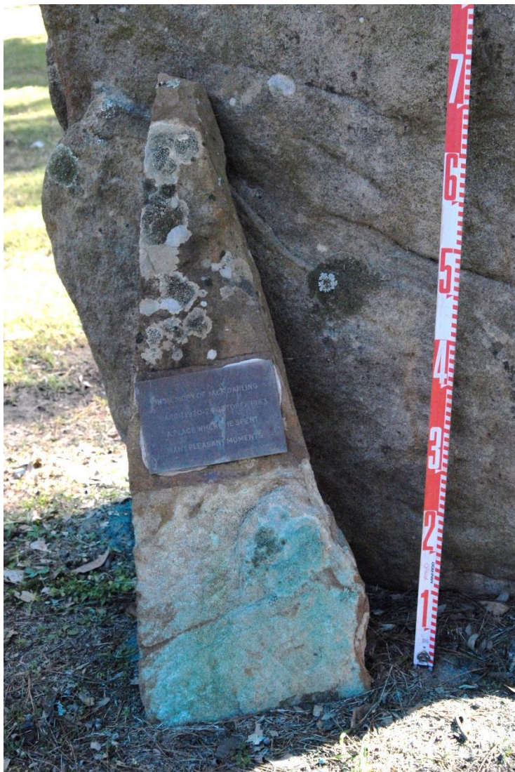
Figure 9.24 Detail of smaller commemorative stone in memory of Jack Darling, which is paired with the larger Nursery opening stone, (image no. CG 0056)