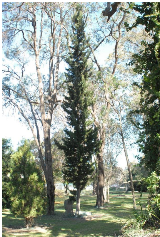
Figure 9.26 General view of commemorative 'Lone Pine' planting and stones, looking SW, (image no. CG 0069)