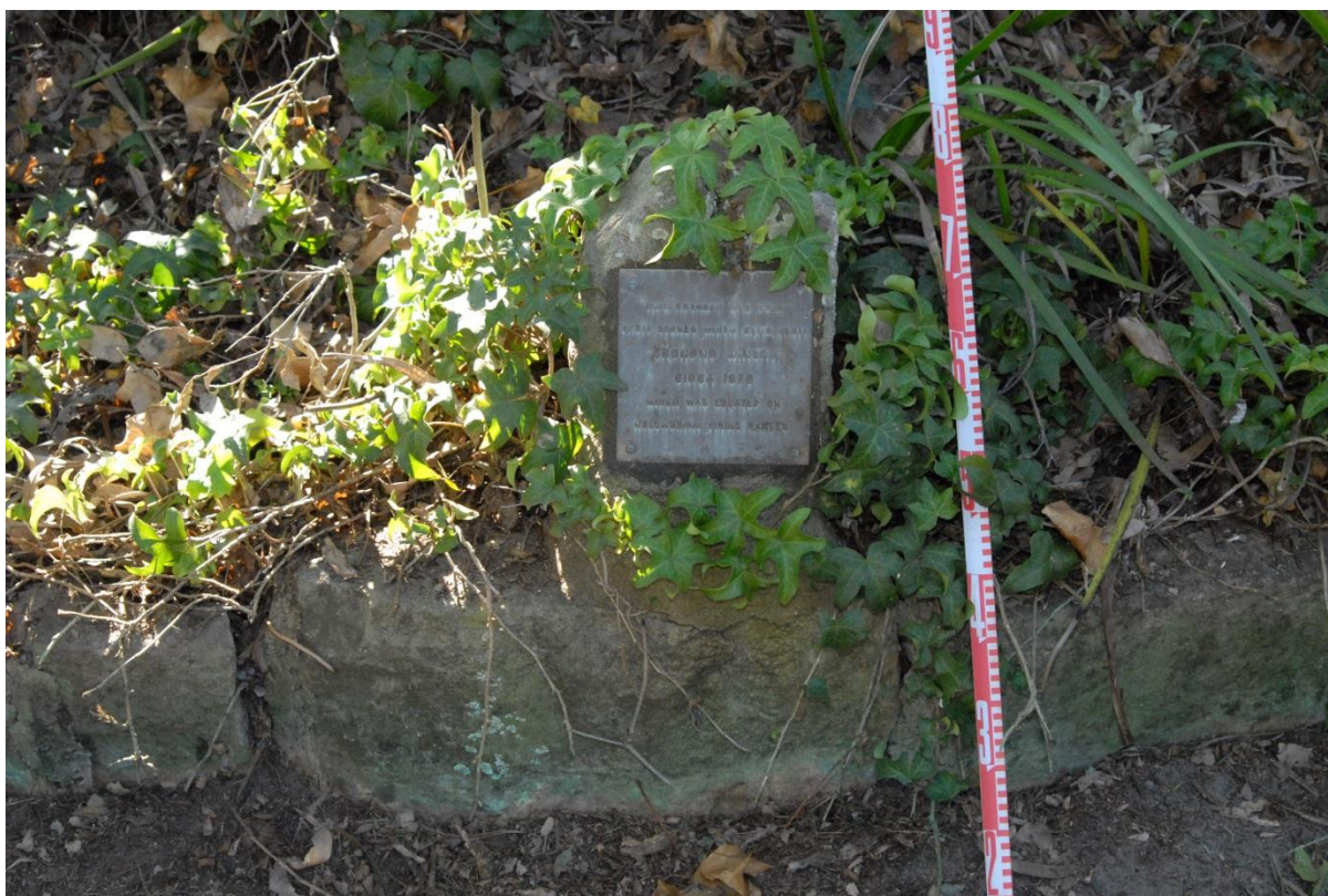
Figure 9.35 General context of Grodno Winery commemorative plaque, looking N, (image no. CG 0107)