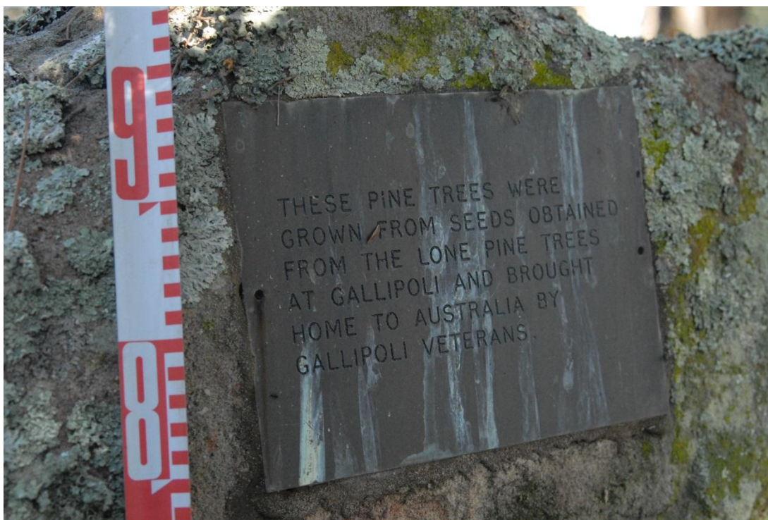
Figure 9.31 Detail of 'Lone Pine' commemorative plaque, (image no. CG 0086)