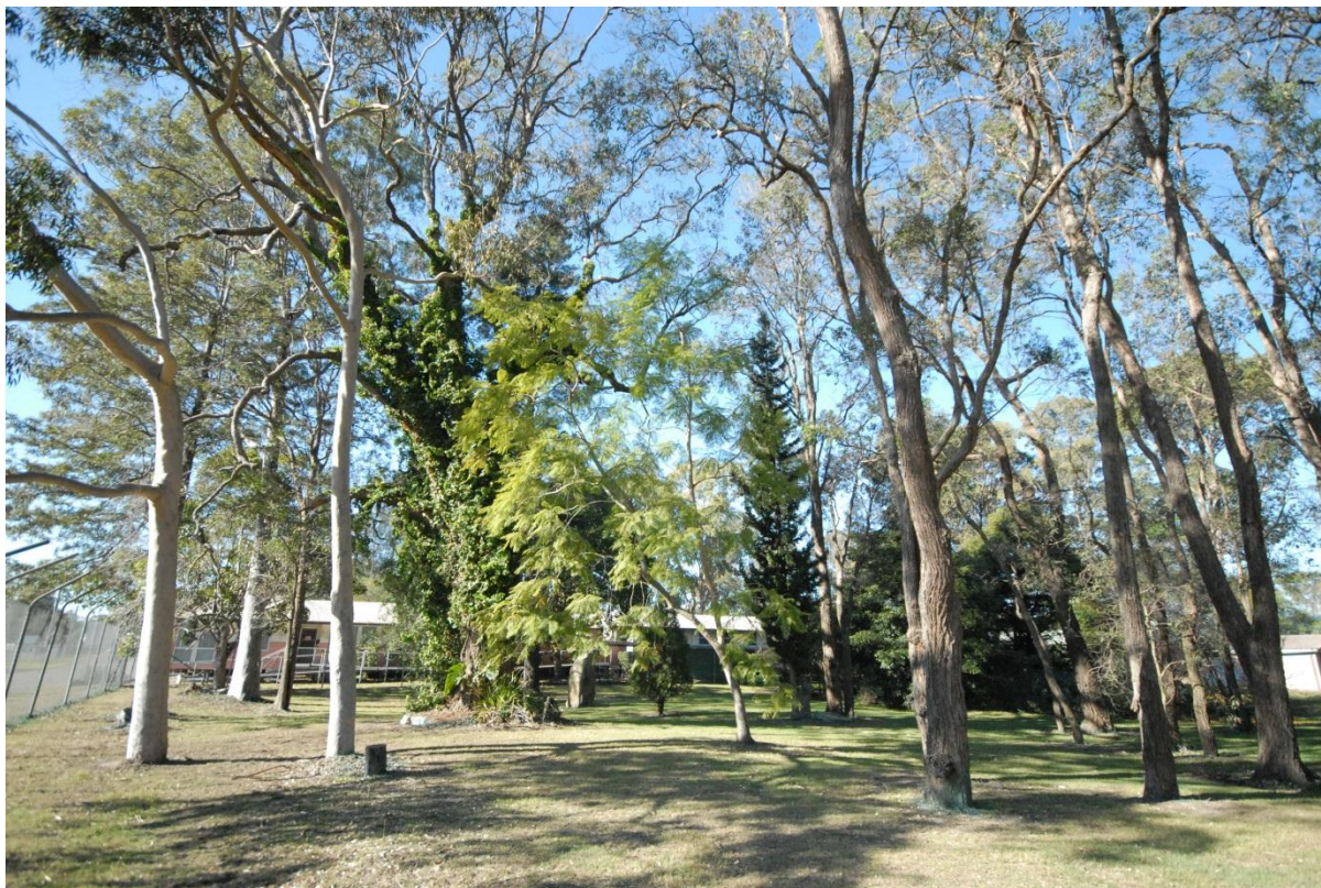
Figure 9.18 General view of commemorative section of garden, looking E, (image no. CG 0037)