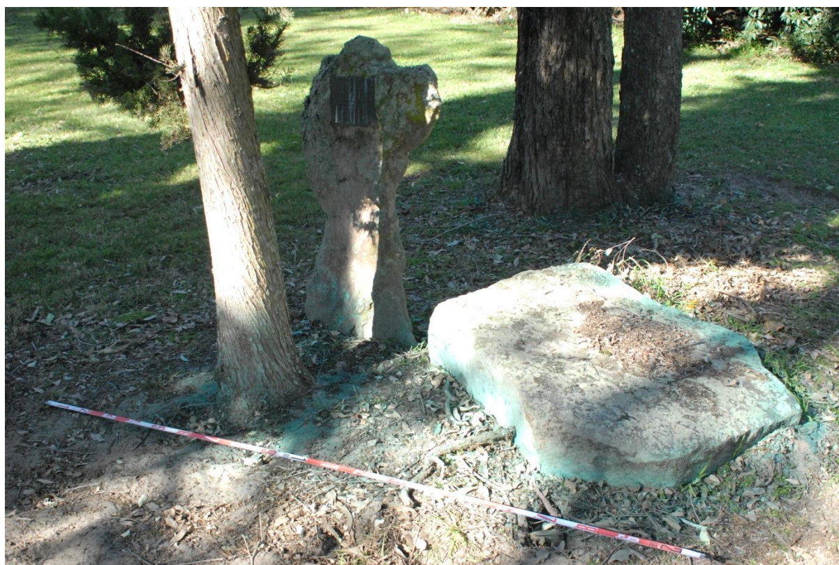
Figure 9.28 The 'Lone Pine' commemorative stones, looking SE, (image no. CG 0076)