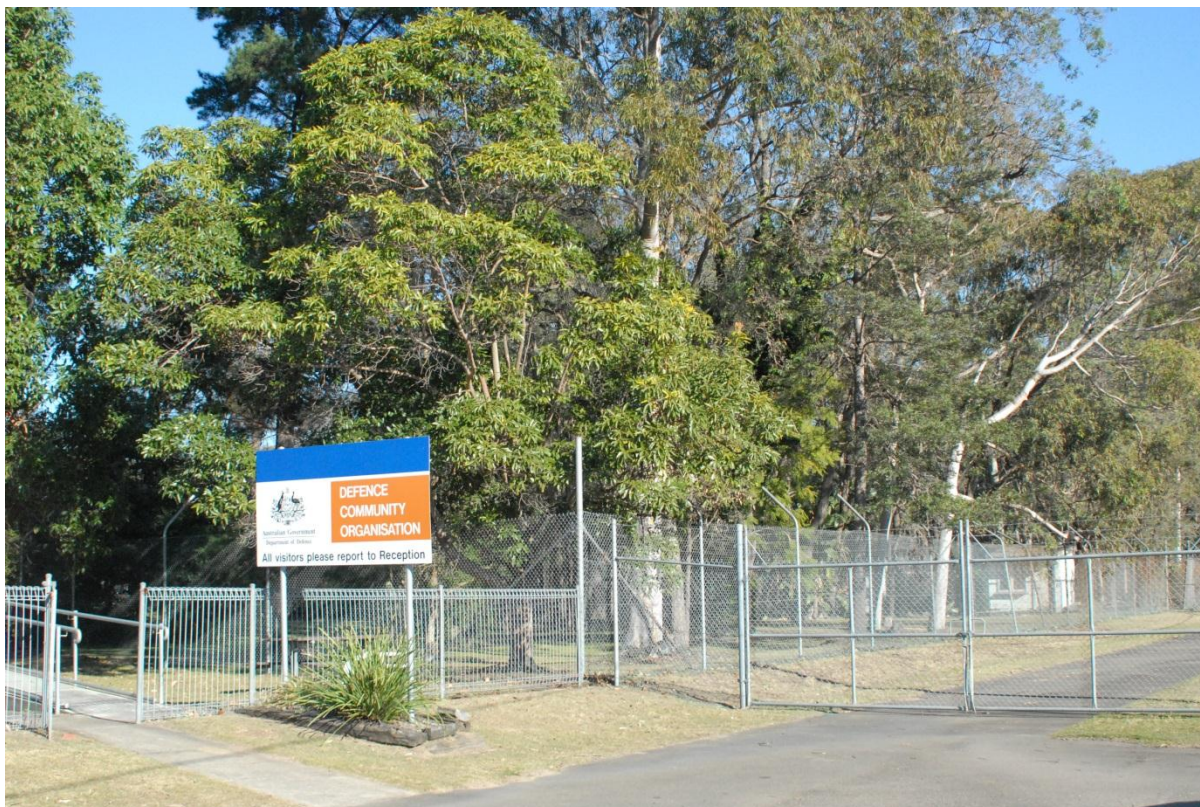
Figure 9.6 General view towards commemorative garden from entrance to Defence Community Organisation, looking SW, (image no. CG 0001)