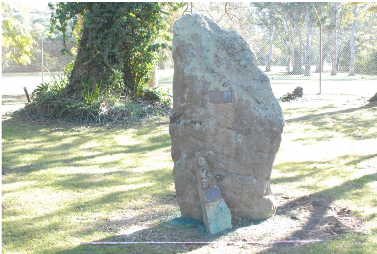
Figure 9.22 Two commemorative stones, the larger stone contains a plaque documenting the official opening of the Second Military District Nursery in 1978, the smaller stone contains a plaque pictured in Figure 9.25, looking NW, (image no. CG 0052)