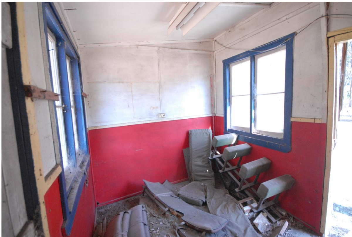
Figure 9.16 Interior view of B11 building, looking SW, (image no. CG 0135)