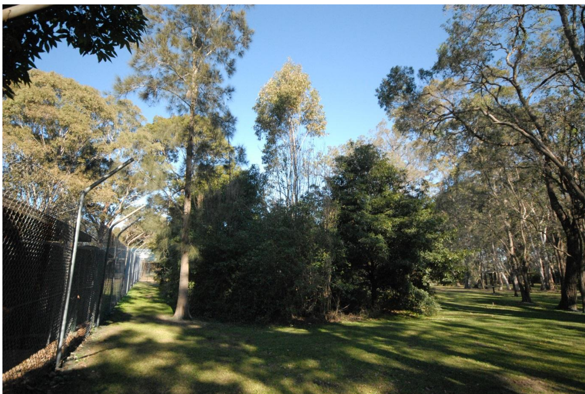
Figure 9.21 Looking S across former rock lined nursery pond, now dry and overgrown, (image no. CG 0047)