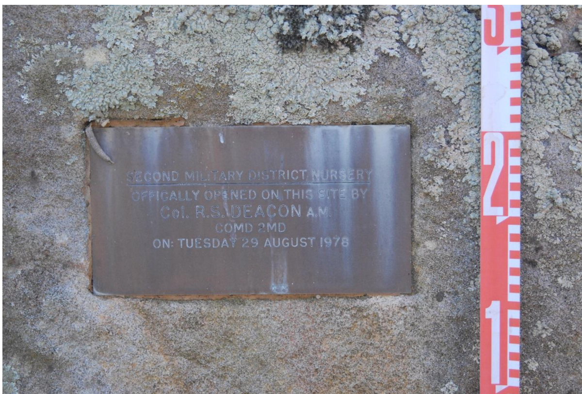
Figure 9.23 Detail of plaque documenting the official opening of the Second Military District Nursery by Col. R.S. Deacon A.M., COMD 2MD on 29 August 1978, (image no. CG 0055)