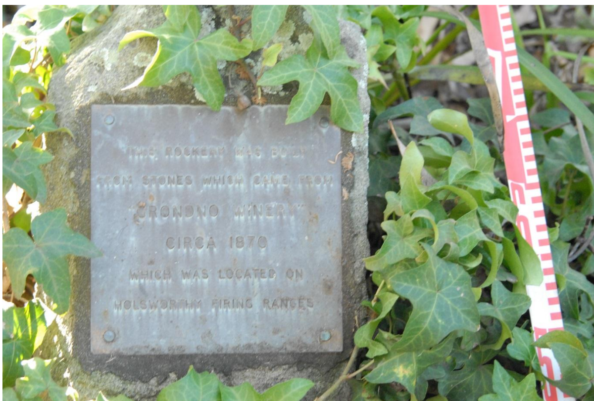
Figure 9.37 Detail of Grodno Winery plaque, looking N, (image no. CG 0108)