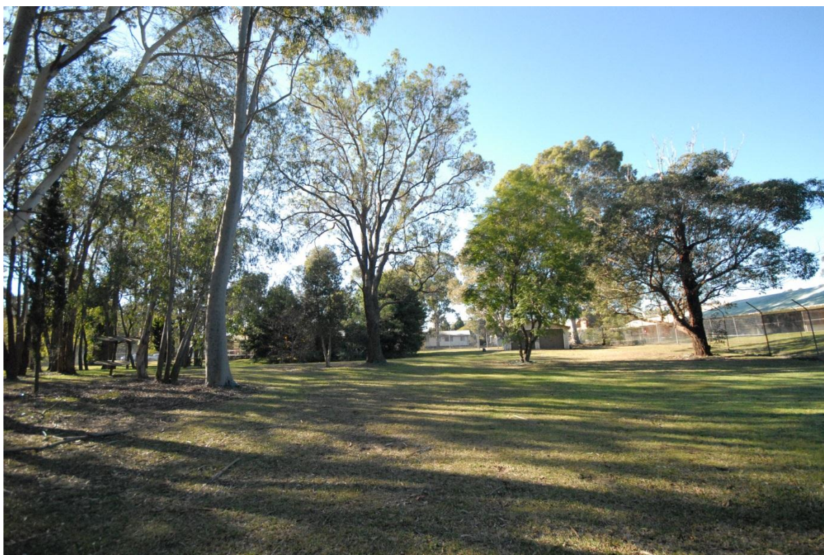
Figure 9.9 Looking E, across SE portion of garden and grounds, (image no.CG 0013)