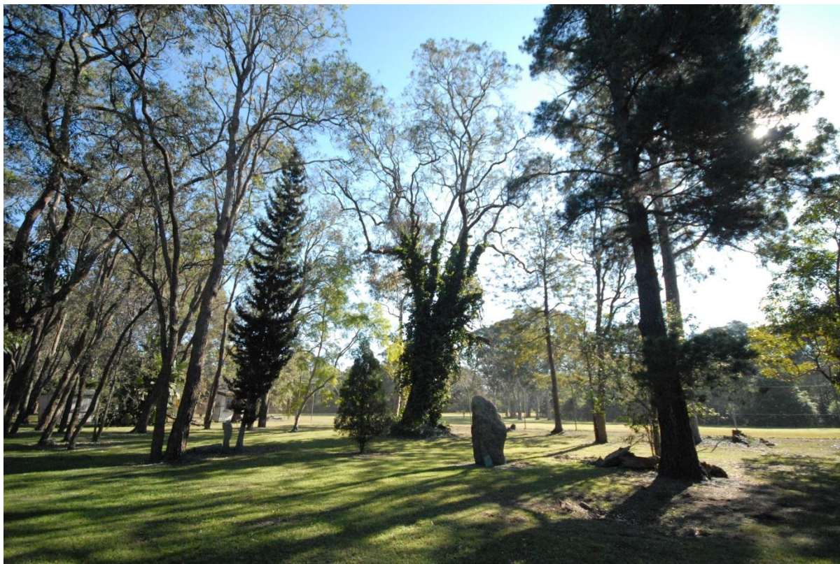
Figure 9.20 General view of commemorative section of garden, looking NW, (image no. CG 0043)