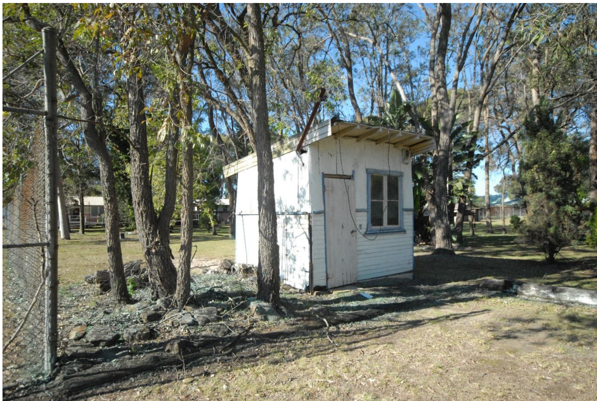
Figure 9.14 Building B11, former nursery building (Office?), looking SE, (image no. CG 0027)