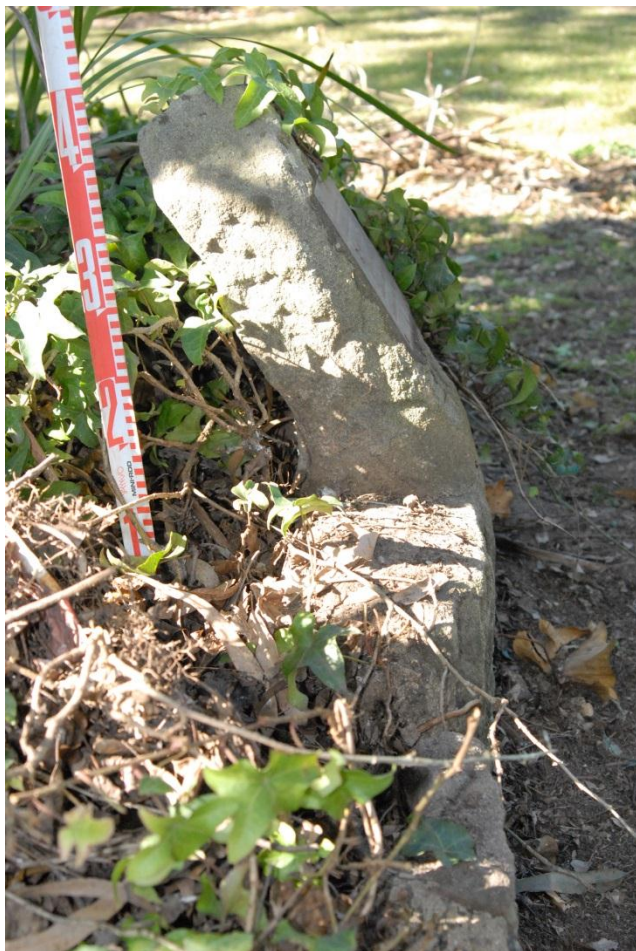
Figure 9.36 General context (side-on view) of Grodno Winery commemorative plaque, looking E, (image no. CG 0112)