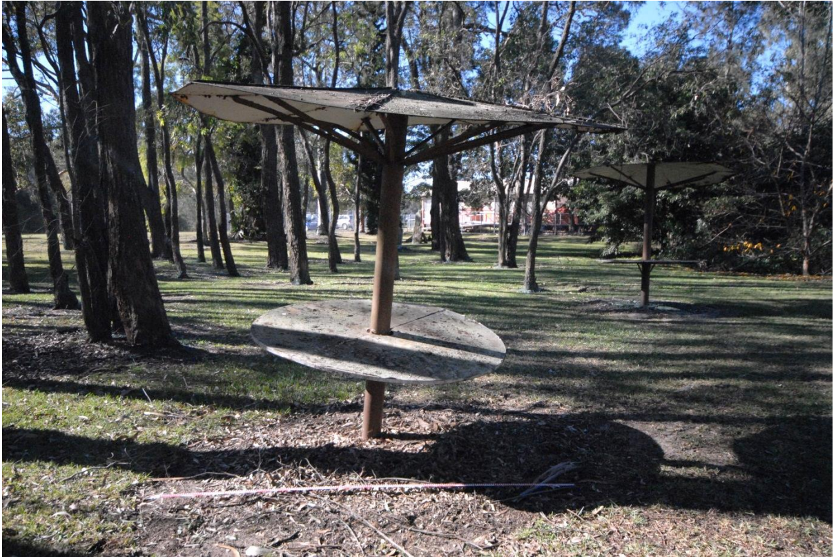
Figure 9.38 Picnic tables situated Se of commemorative section of garden, looking E, (image no. CG 158)