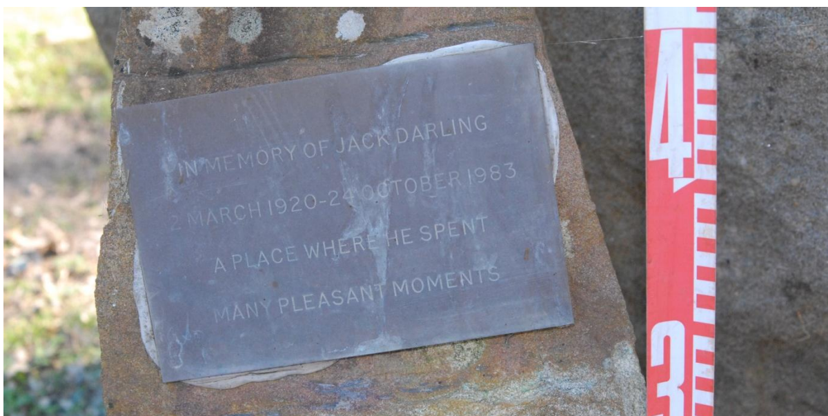
Figure 9.25 Detail of Jack Darling memorial plaque, (image no. CG 0058)