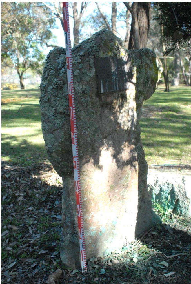
Figure 9.30 Detail of 'Lone Pine' commemorative (standing) stone, looking SW, (image no. CG 0082)