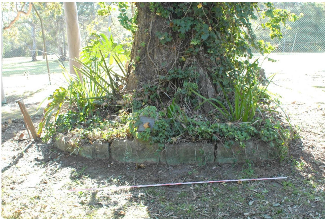
Figure 9.33 Detail of commemorative rock edging, looking N, (image no. CG 0096)