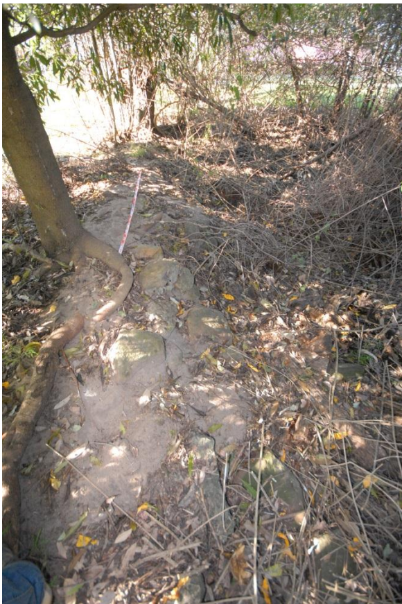
Figure 9.39 Rock lined embankment, being the northern edge of a former pond basin, looking E, (image no. CG 0165)