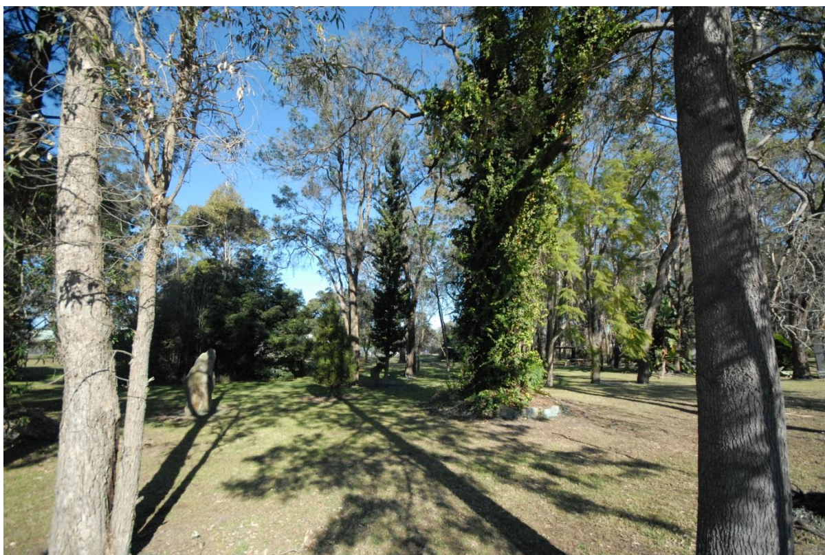
Figure 9.19 General view of commemorative section of garden, looking S, (image no. 0040)