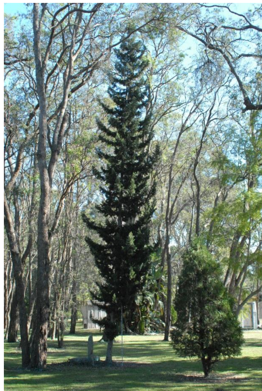
Figure 9.27 General view of commemorative 'Lone Pine' planting and stones, looking W, (image no. CG 0067)