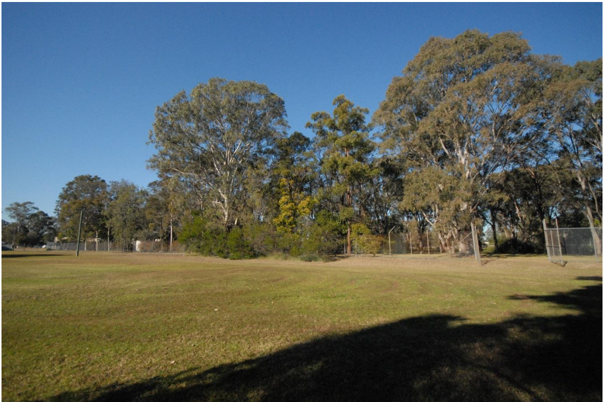
Figure 9.11 General view looking SE along northern boundary of grounds, (image no. CG 0020)