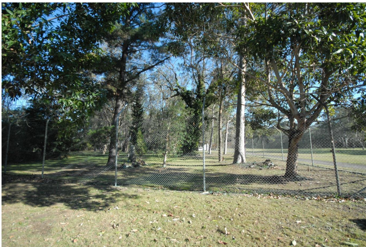
Figure 9.7 General view looking W towards garden area with commemorative features, (image no. CG 0004)