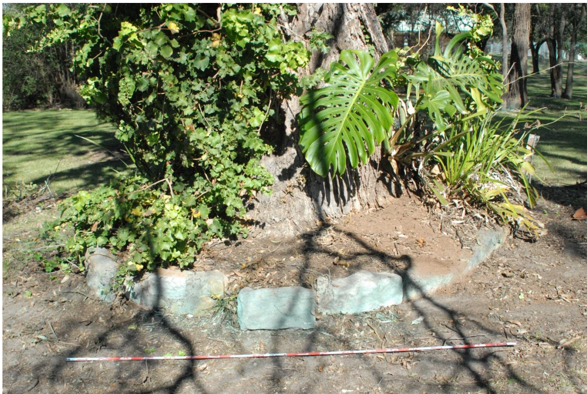
Figure 9.34 Detail of commemorative rock edging, looking S, (image no. CG 0100)