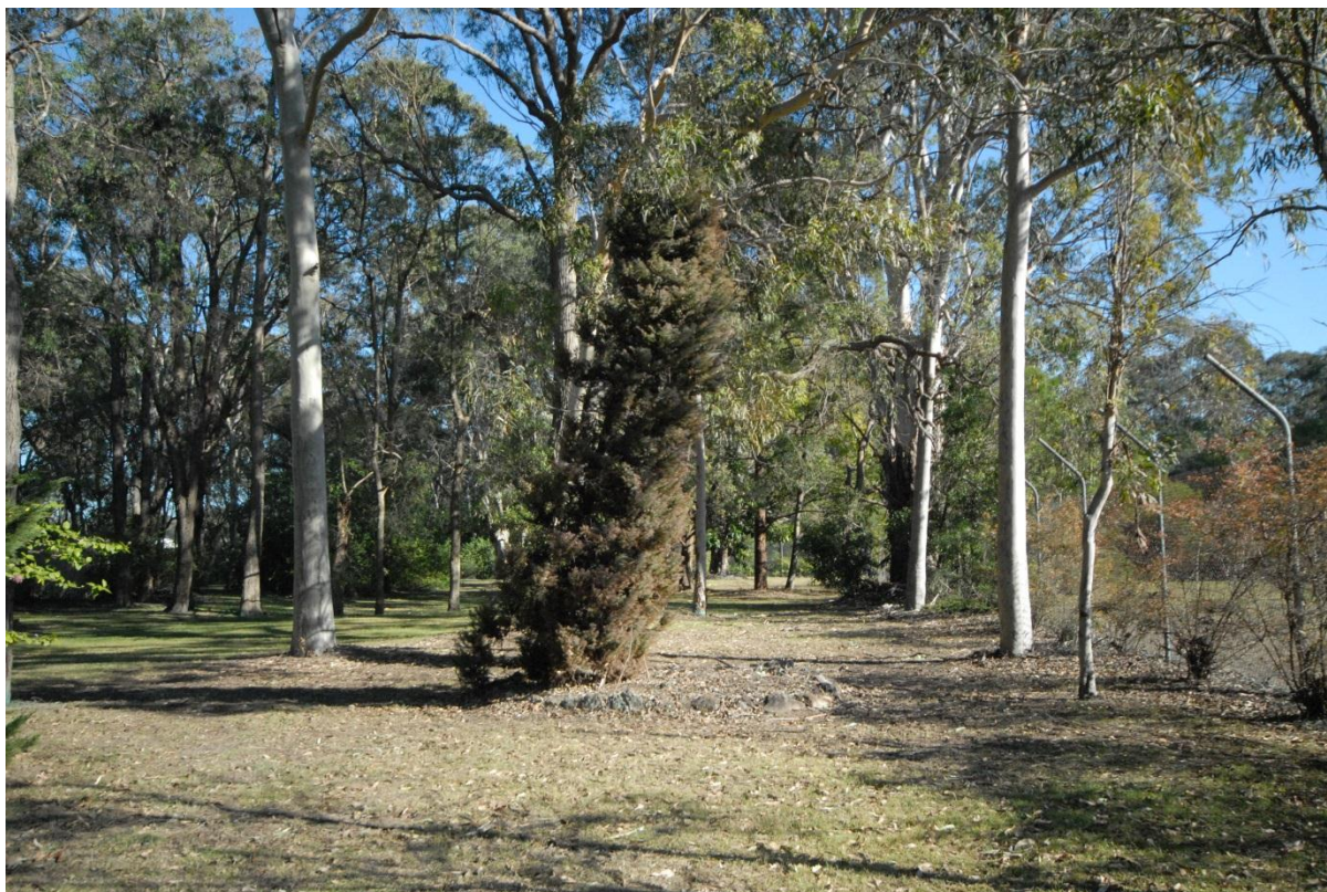
Figure 9.13 Cypress tree within a stone edged garden bed, located south of B11 building, looking W, (image no. CG 0025)