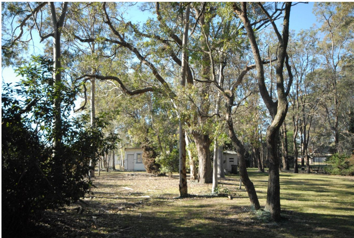
Figure 9.12 View looking E, along northern margin of grounds towards building B11 and picnic facilities, (image no. CG 0022)