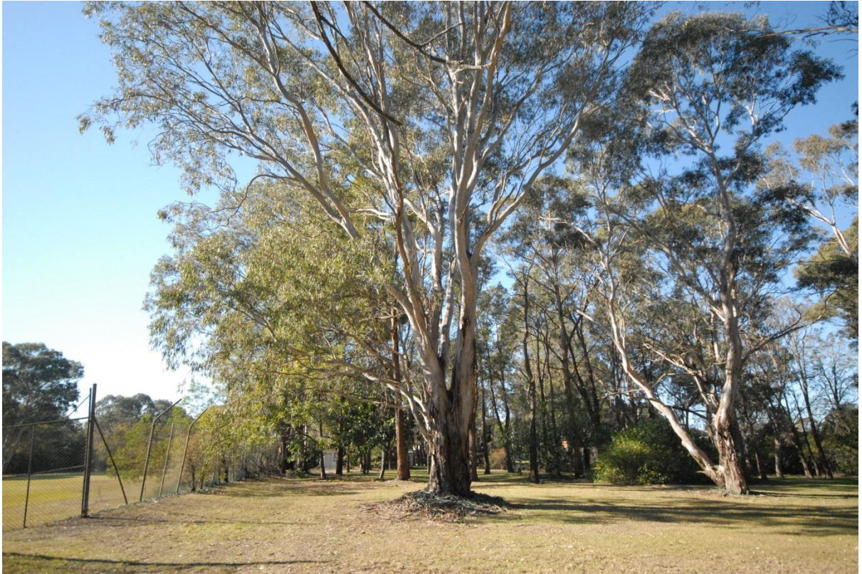
Figure 9.10 General view from NW end of grounds, looking E, (image no. CG 0019)