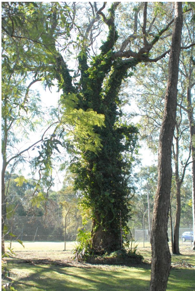
Figure 9.32 General view of Grodno Winery commemorative rock edged garden bed with large Eucalypt, looking N, (image no. CG 0093)