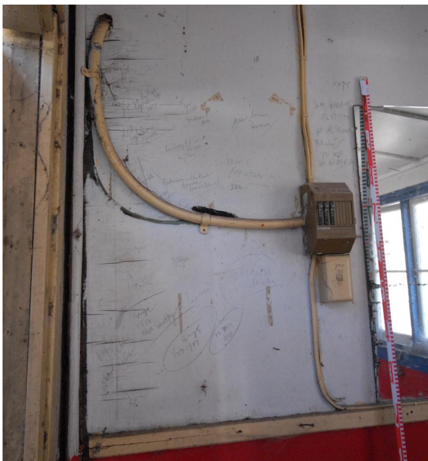
Figure 9.17 Detail of northern interior wall in building B11, showing a variety of hand written notes, (image no. CG 0145)