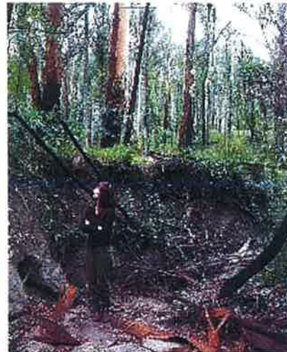
Diega Creek before and after longwall coal mining

Even the mining company, Oceanic Coal, has acknowledged in the Newcastle media its contribution to the serious decline in the health of the creek.