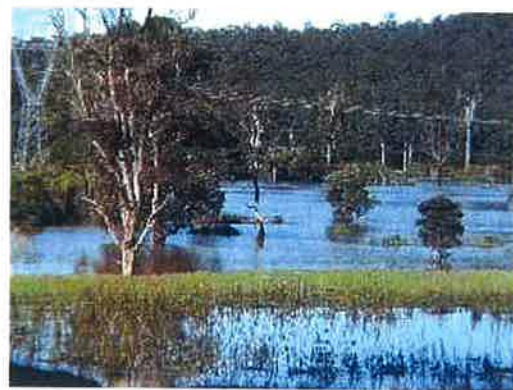
Flooding in the Dooralong Valley above the proposed mine footprint