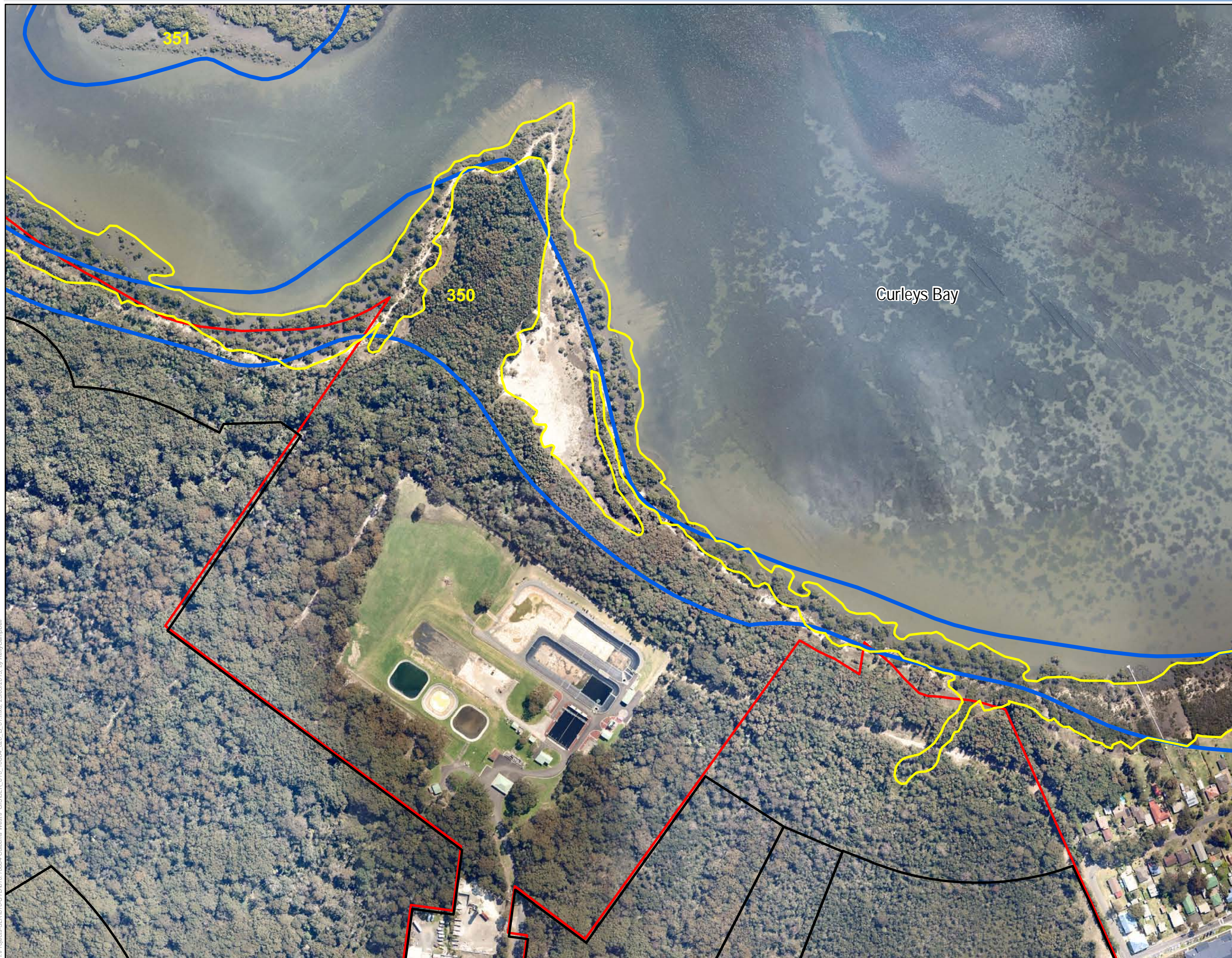
Details of SEPP 14 Wetland as amended by SLR (east)