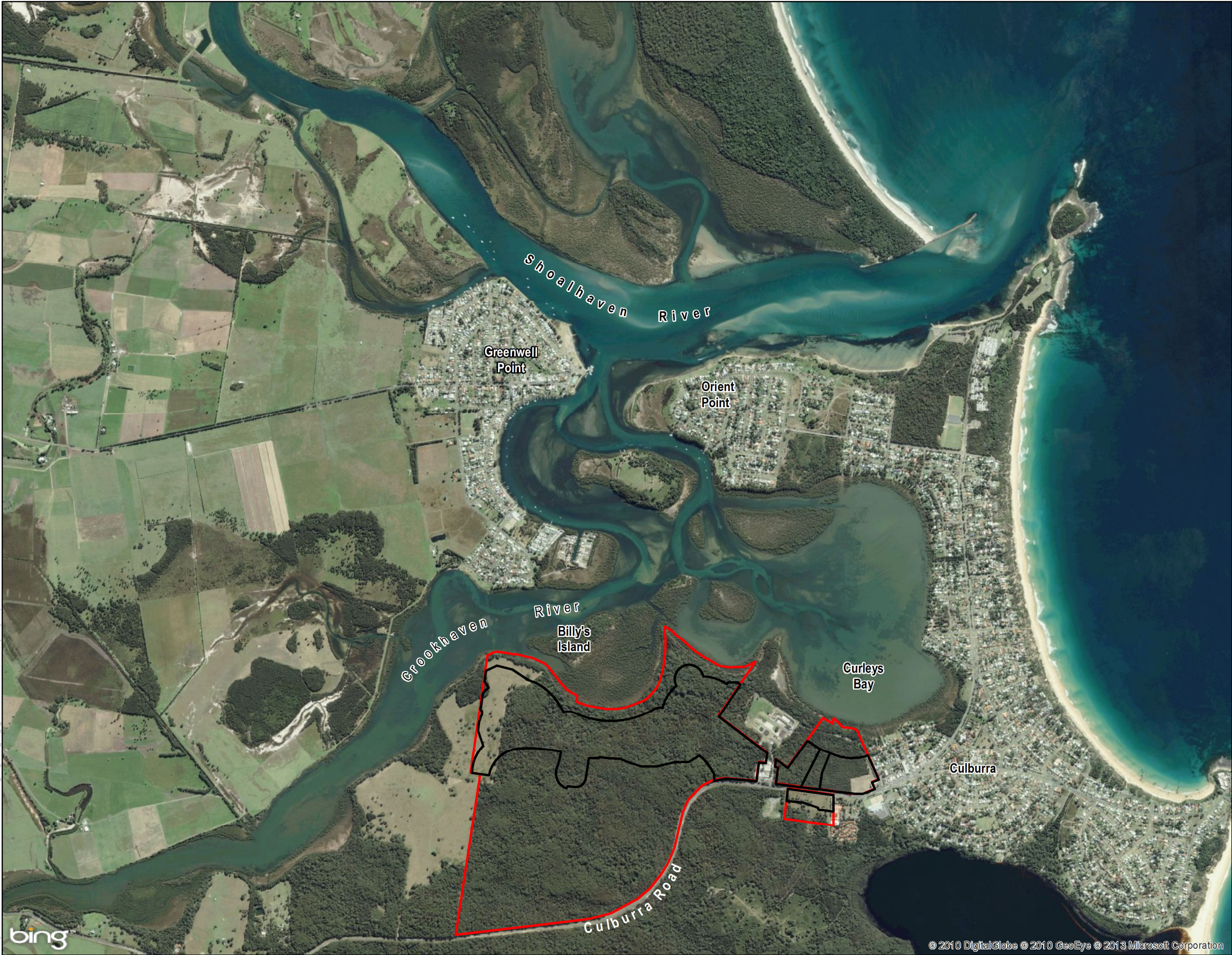
Riverine and estuarine habitats in the locality