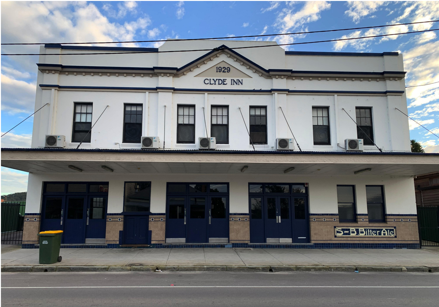
NORTHERN FACADE/STEET ELEVATION