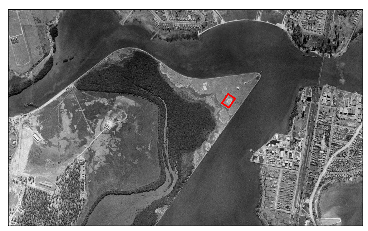
Figure 4: 1943 aerial image of Wentworth point showing the study area as existing landfill, approximate study area location shown edged in red (Nutley & Norman 2021a:12)