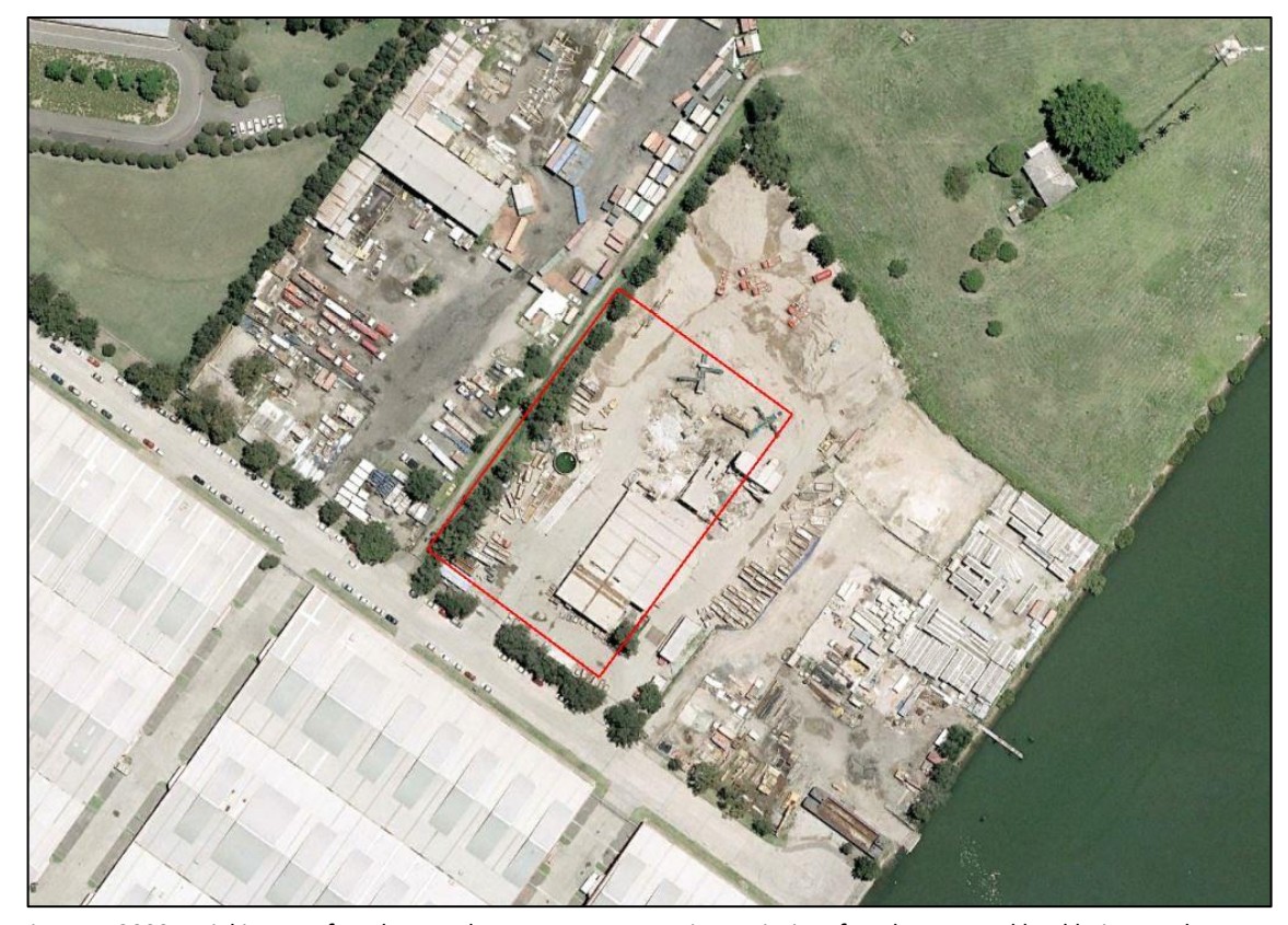
Figure 5: 2009 aerial image of study area shows concrete covering majority of study area, and land being used for industrial purposes (Nutley & Norman 2021a:13)