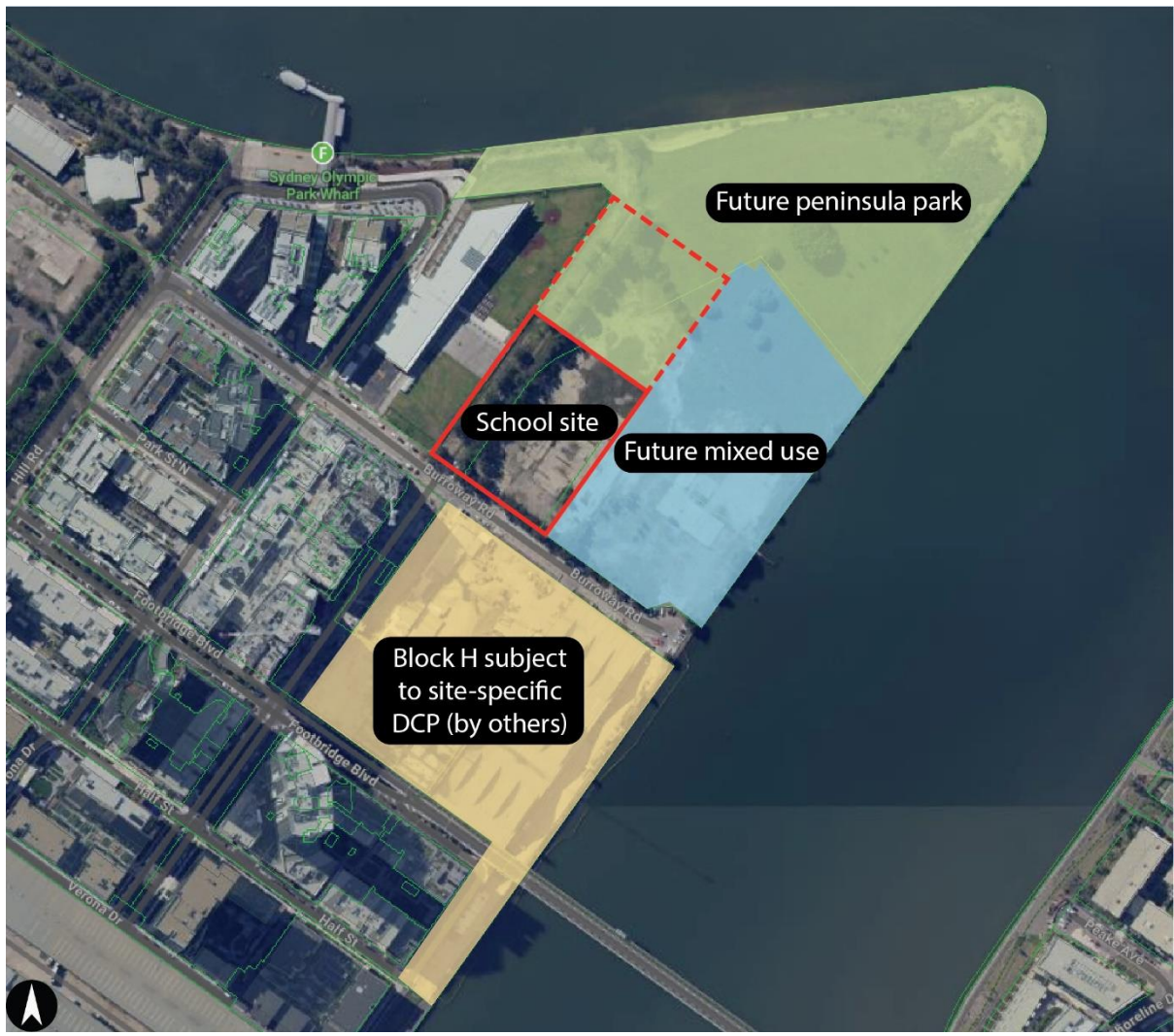
Figure 1: Site aerial map

The surrounding area is generally characterised by high rise residential and mixed-use developments. The site is directly adjacent to the Wentworth Point Peninsula Park and immediately east of Wentworth Point Public School.