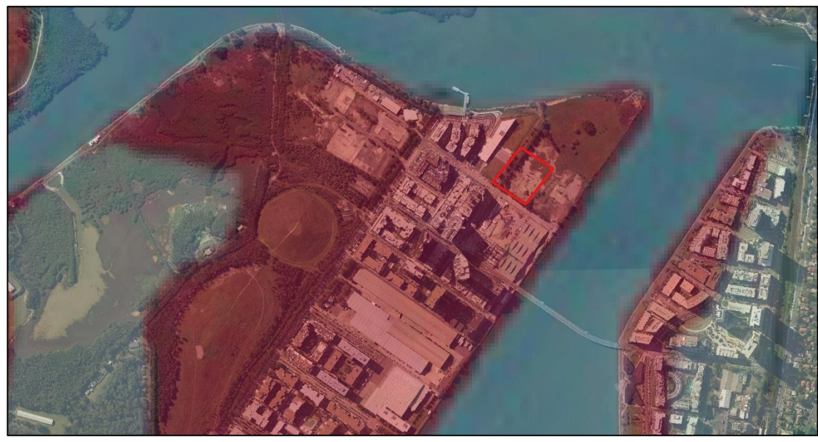
Figure 3: Reclamation of the study area and surrounds highlighted in brown. Study area edged in red (Nutley & Norman 2021a:12)