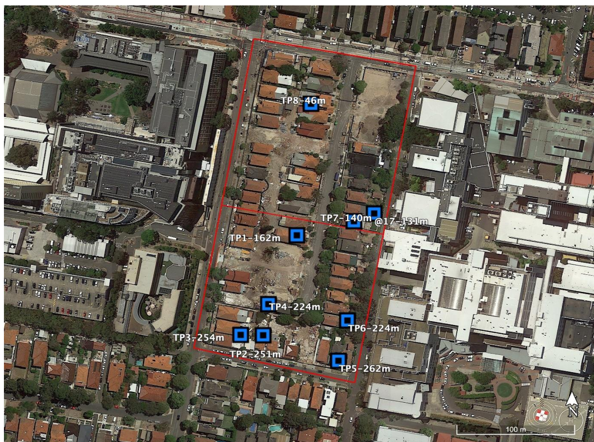
Figure 2 Test Pit Locations