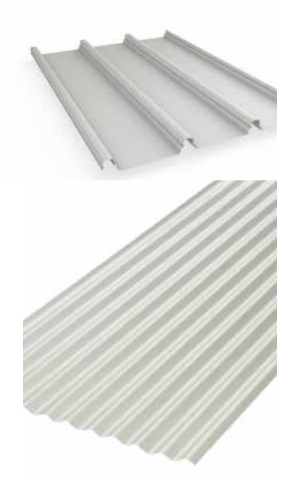
PRE-FINISHED PROFILED STEEL ROOF SHEETING

A refined palette of materials and finishes is required that is restrained. Materials have been selected for their durability and represented in an honest manner.