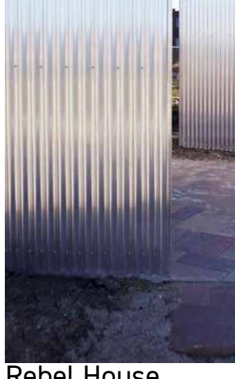
Rebel House, MONO Architects