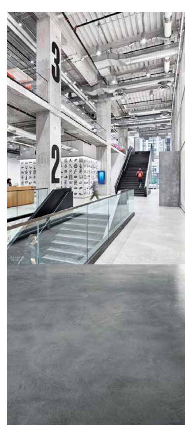
Nike New York, Studios Architecture