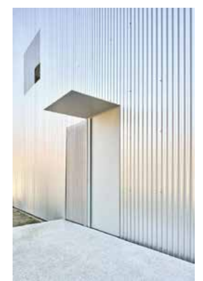
Barcelona House, Arquitecturia