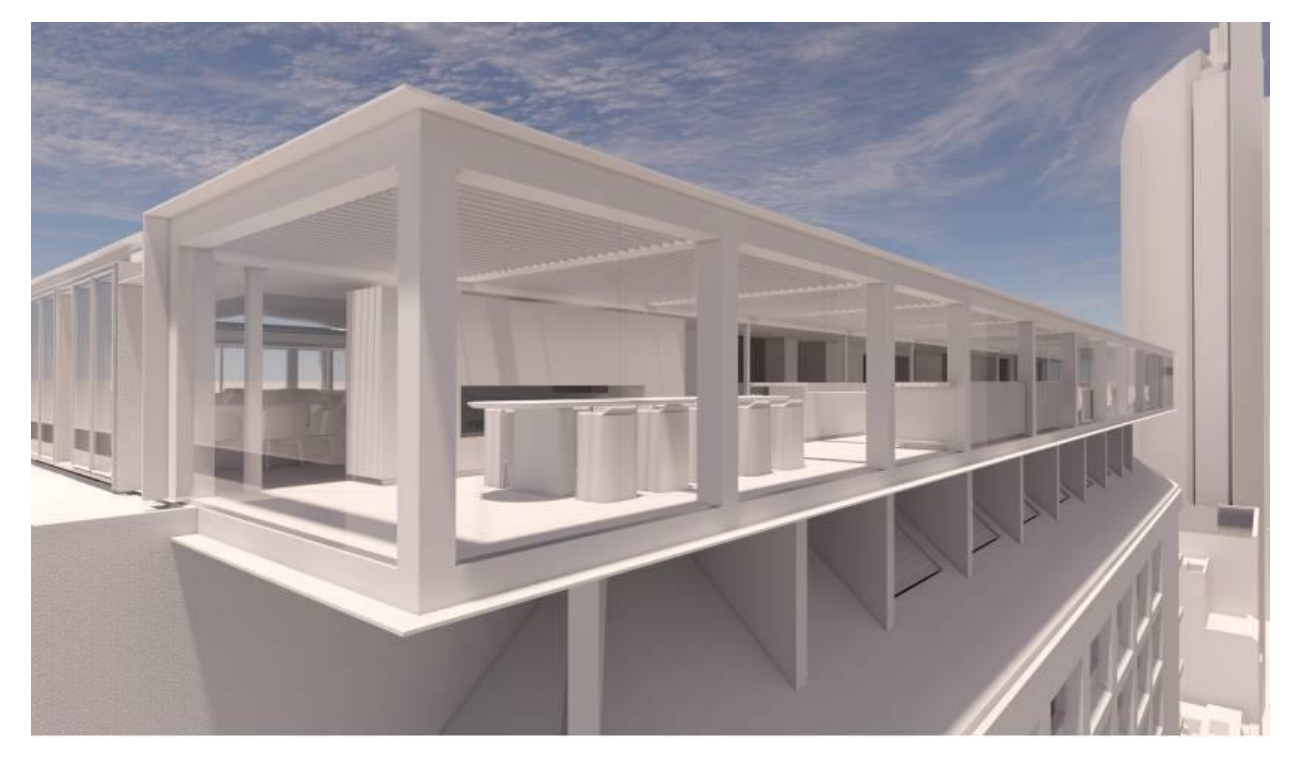
Picture: Proposed new rooftop space for "Club Intercontinental".

The proposed redevelopment is likely to result in increased employment generation during both the construction and operation phases and supports the global role of the Sydney CBD as a world-renowned tourist destination, contributing to a competitive visitor economy.