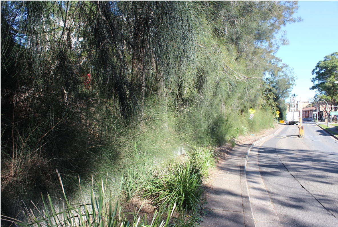
Photograph 1 Planted Native Vegetation within the subject land