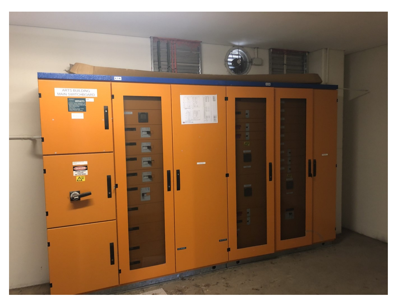
Figure 3 – Existing ARTS Main Switchboard (MSB) There is adequate spare capacity at this switchboard for the new building

Issue A - 02-Mar-20 Page 9 of 10 Electrical Projects Australia