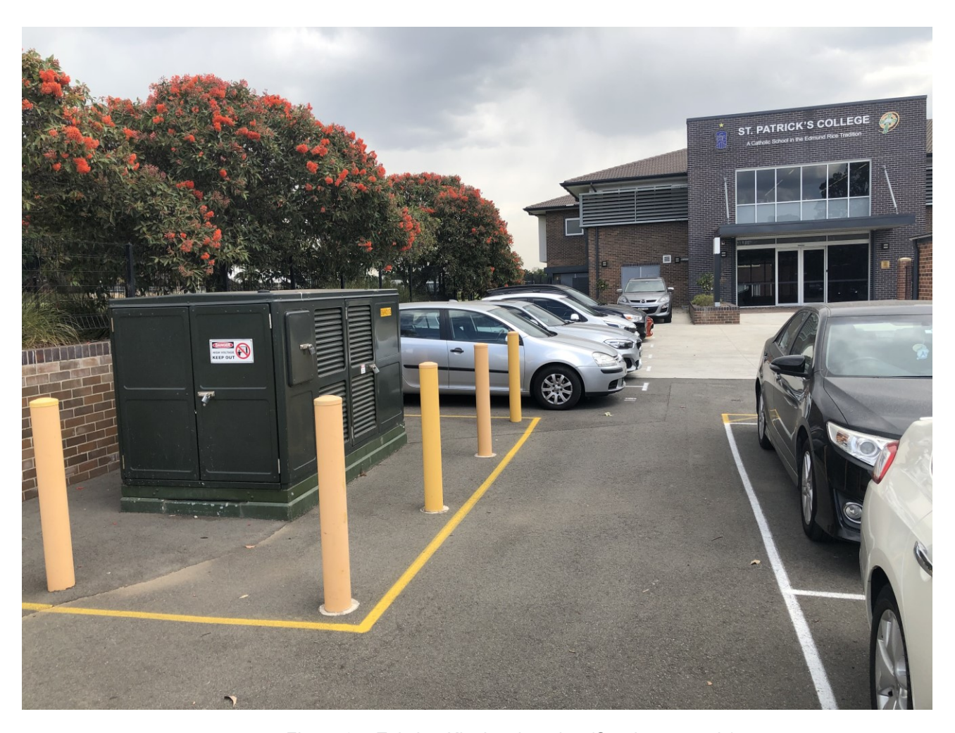
Figure 2 – Existing Kiosk substation (Southern supply) ARTS Building is in the background

Issue A - 02-Mar-20 Page 8 of 10 Electrical Projects Australia