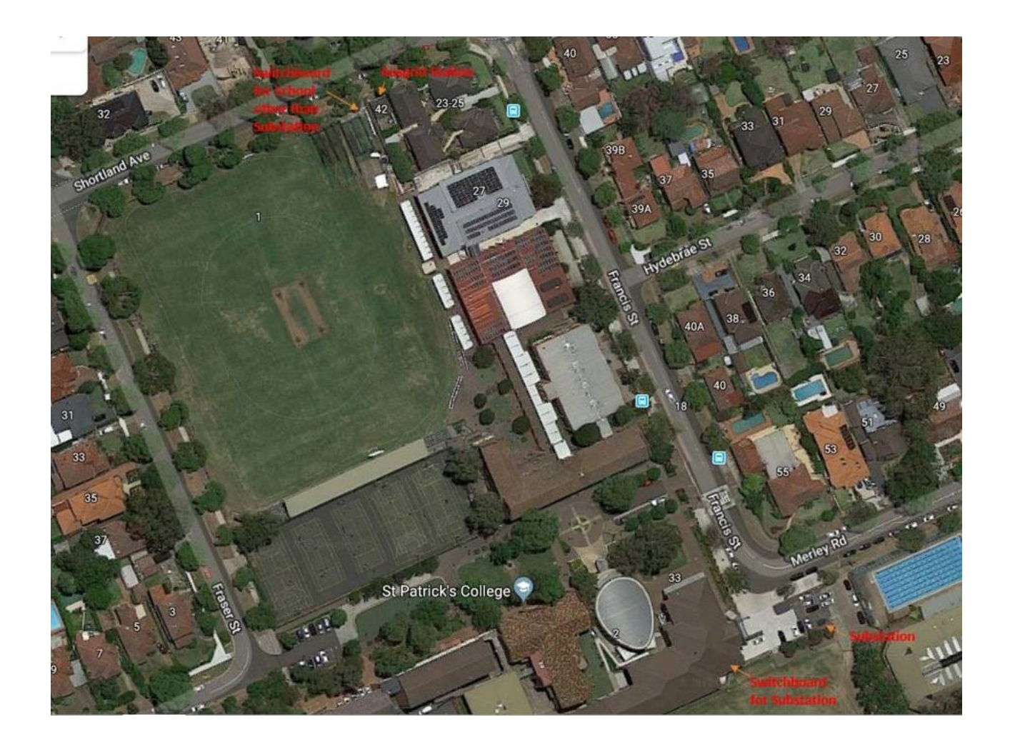
Figure 1 - Existing Power Supplies to the Site