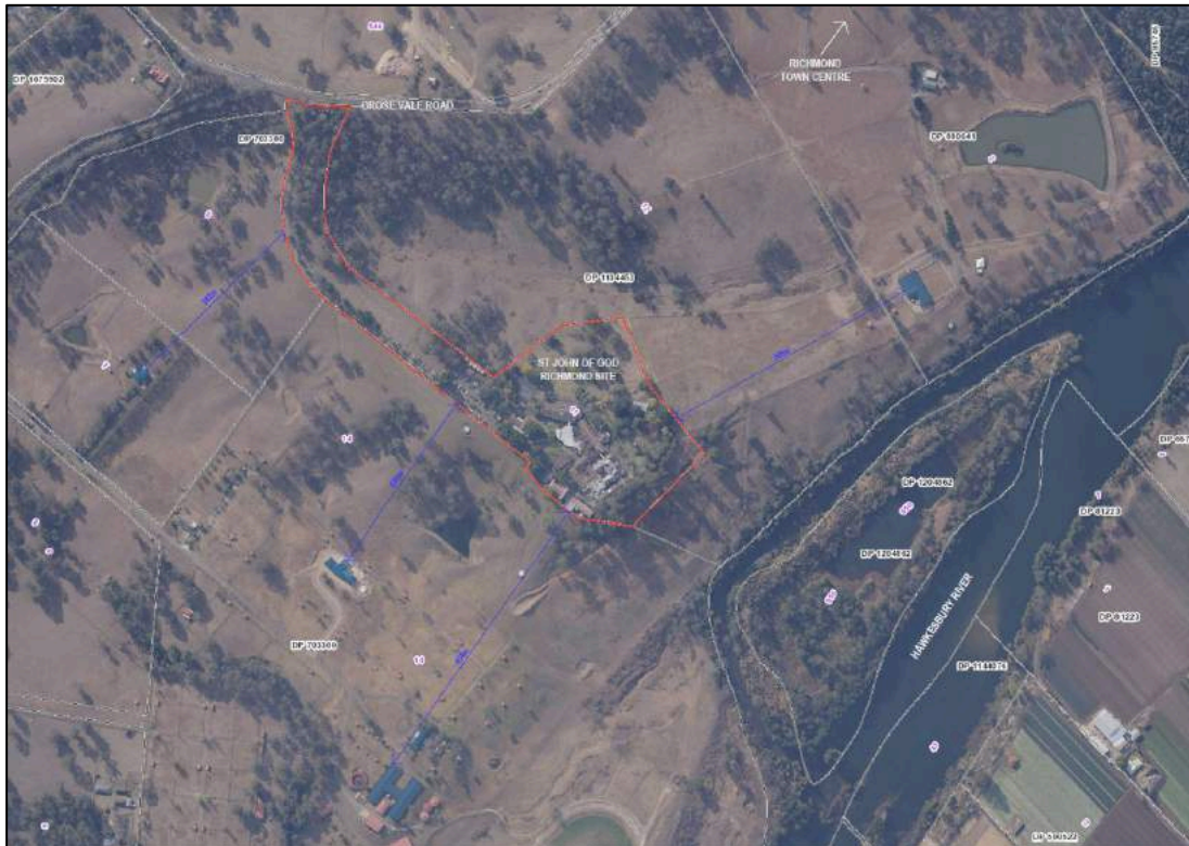
Figure 1: Site aerial map

The site is irregular in shape with access handle to Grose Vale Road and has a total area of approximately 9.85ha. A site aerial map and context map are provided below.