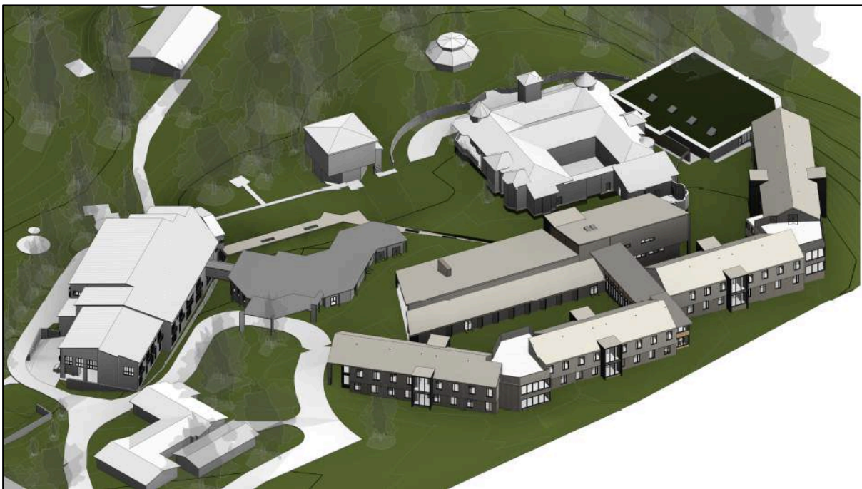
Figure 5: 3D Perspective