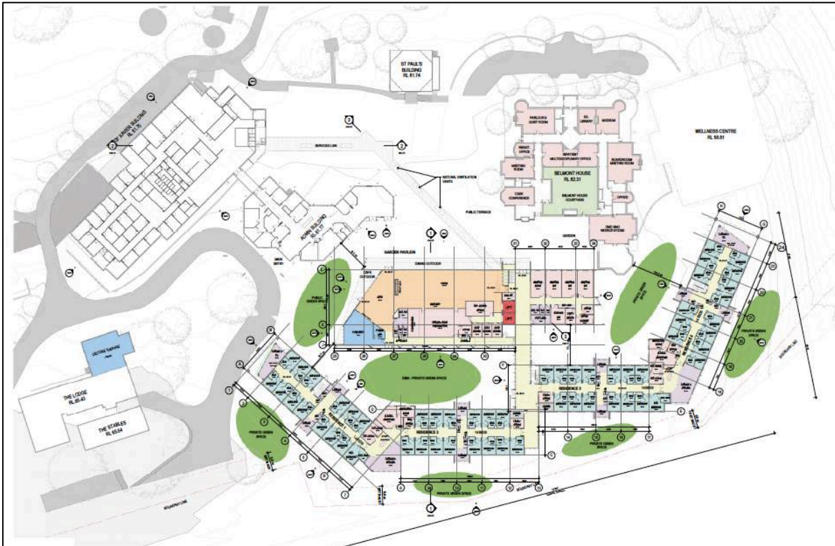
Figure 4: Proposed ground floor plan