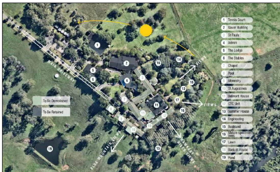
Figure 3: Proposed demolition

Plans/images of the development are provided below.