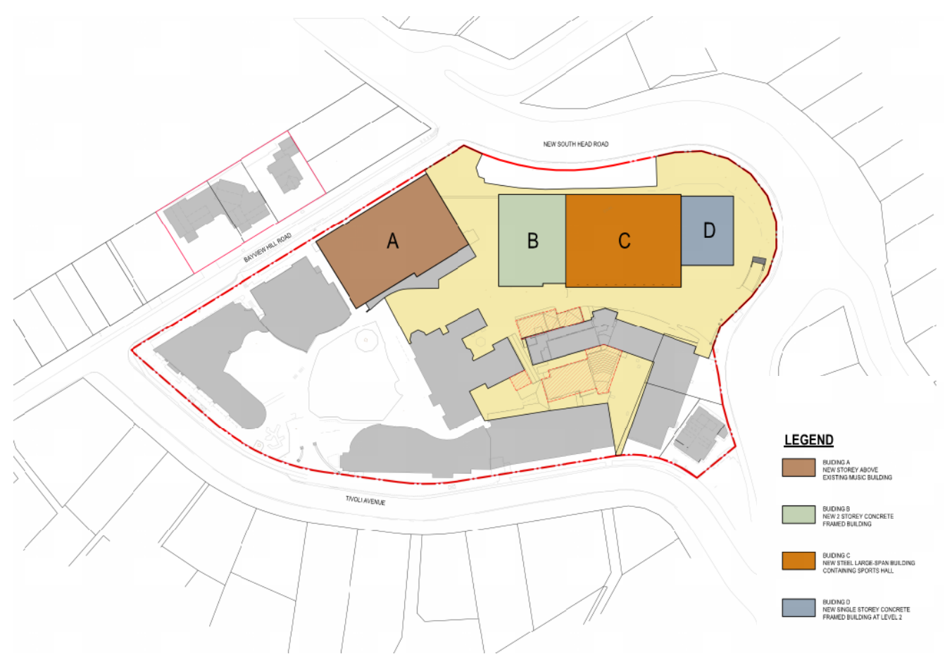
Figure 4 – Key Plan