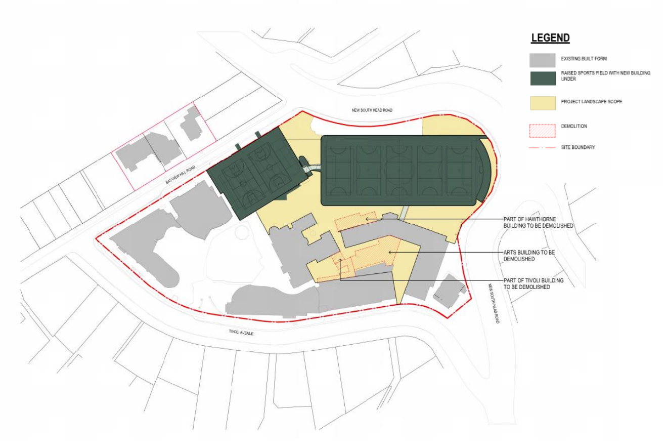
Figure 3 – Project Scope