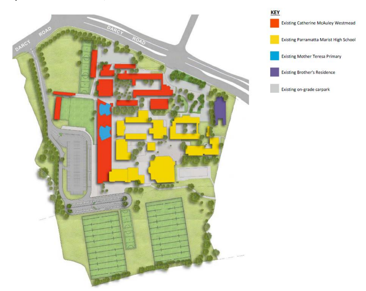
Figure 2 Existing Buildings and Use

Separately, Sacred Heart Primary School (including a Parish church and Priest residence) is located on Ralph Street, Westmead. The site sits within the Cumberland Council Local Government Area (LGA). The buildings on the Sacred Heart Primary School site at Ralph Street are aging and the playground is on leased land, which is due to expire in February 2021. Sacred Heart currently accommodates approximately 197 students and 13 staff. The Ralph Street site does not form part of the proposal, however the application will seek to relocate the Sacred Heart Primary School onto the WCC site, as described below.