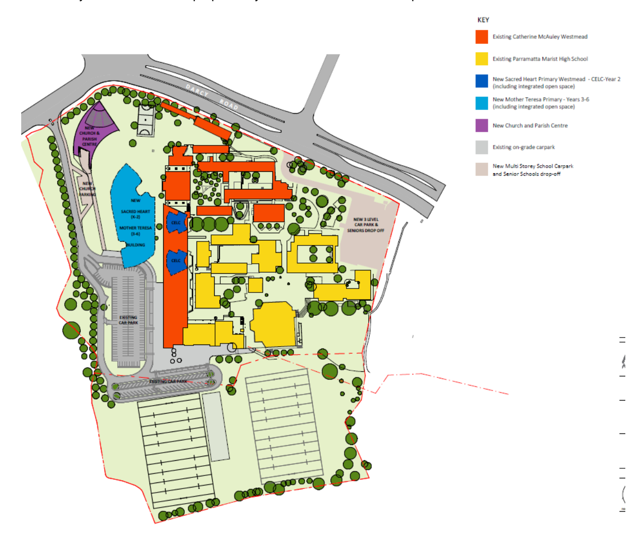
Figure 3 Project 1, Stage 1 development (subject to this SEARs request)

Preliminary Architectural Plan prepared by Alleanza Architecture are provided at Attachment B.