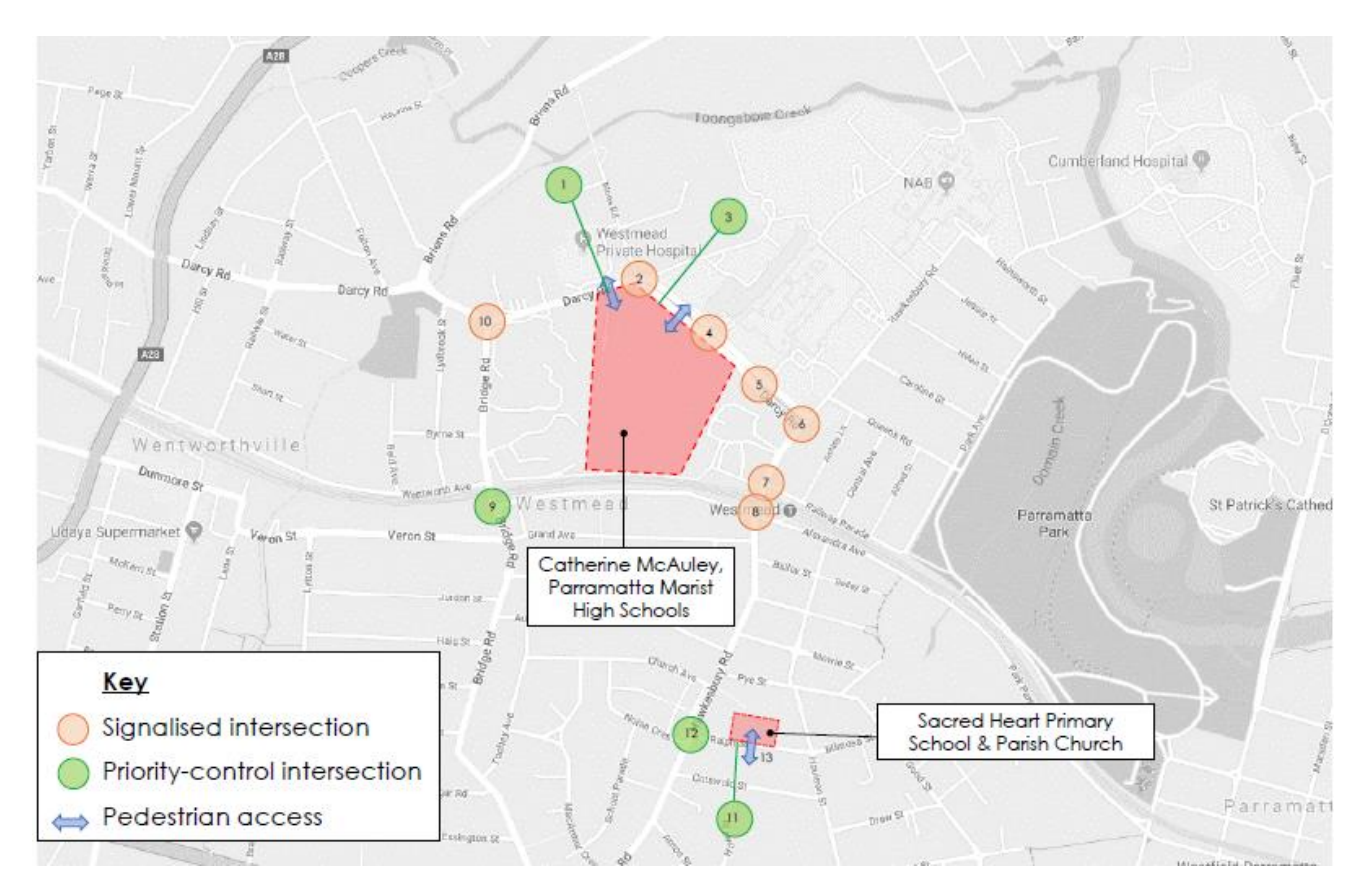
Figure 5 SIDRA modelling points