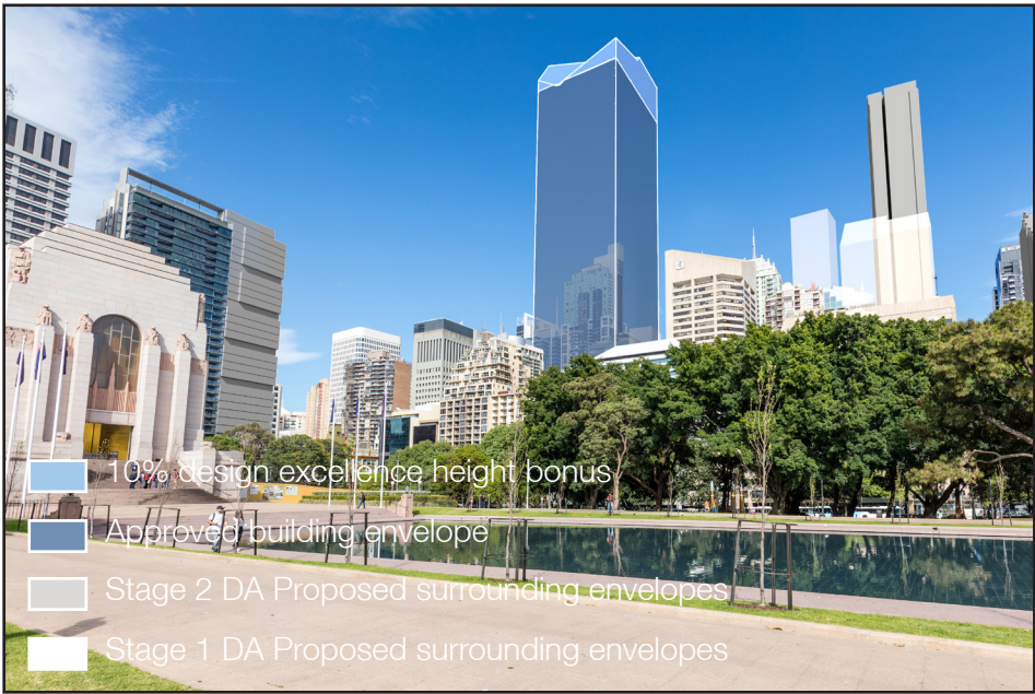
Photomontage indicating proposed building envelope