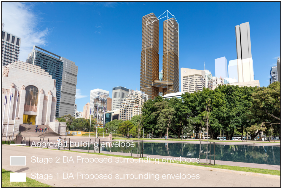
Photomontage indicating proposed building design