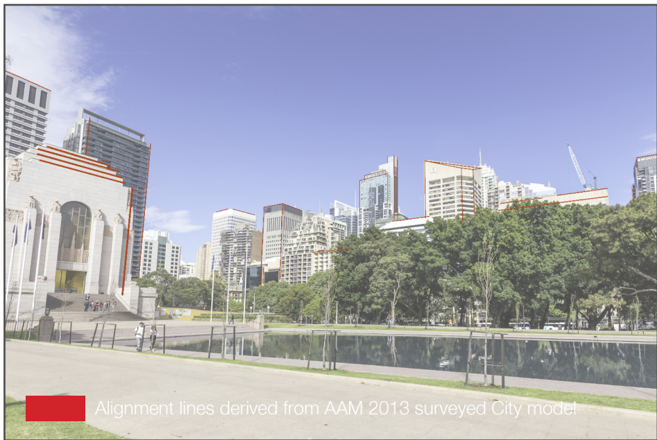
Original photo indicating surveyed alignment lines