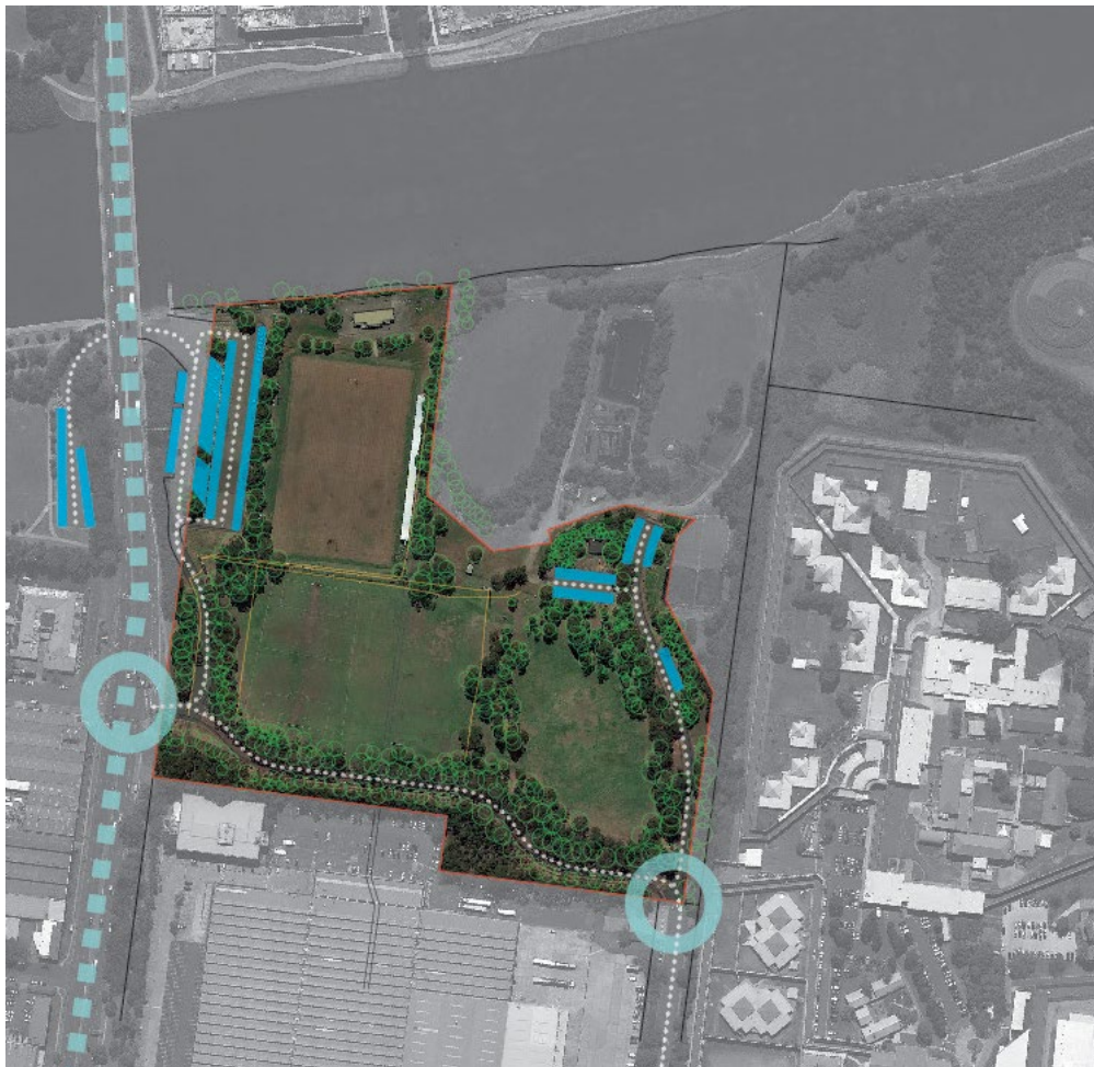
Figure 3 - Existing Roads and Car Parks

A secondary entrance will be provided from the Eastern car park via a gate and ramp adjacent to the grounds keeping and storage area.