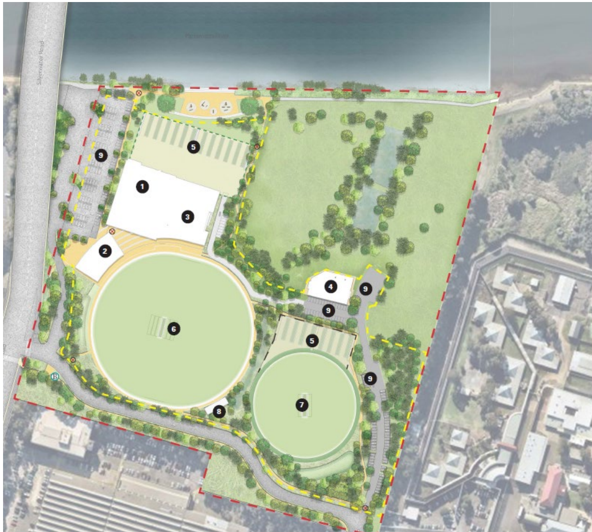
Figure 4 - Master Plan Features