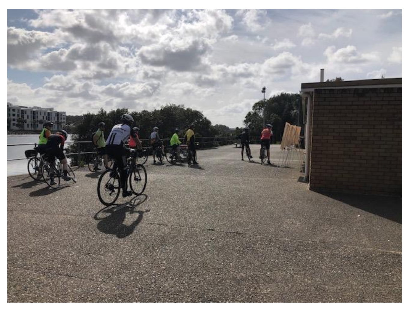
Community Information Session