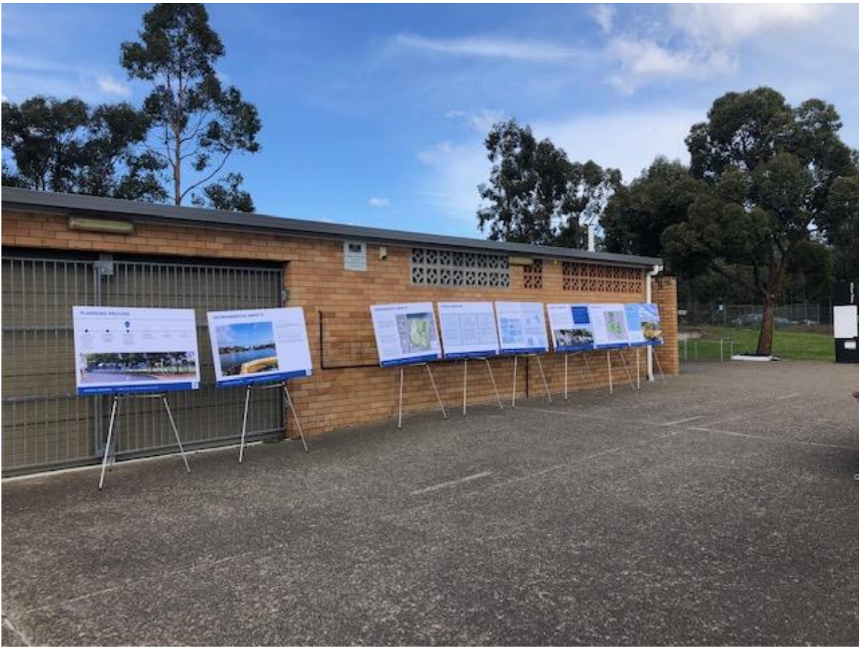
Community Information Session

It has been agreed that Paramatta City FC have agreed to share Eric Primrose Reserve with the Newington Gunners for the 2020 Winter season. Council are currently investigating the redevelopment of Newington Reserve, which is expected to be complete in time for the 2021 Winter Season. The redeveloped reserve would then be made available as the home ground of the Newington Gunners Football Club. The Sydney Olympic Park Authority and Council will continue to work in consultation with the Newington Gunners to continue to accommodate their needs, including finding new parks in the area should their operations overspill from Eric Primrose Reserve.