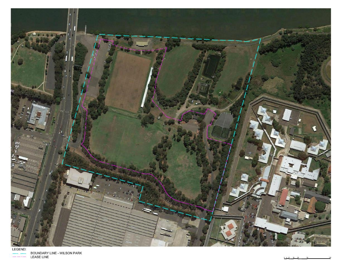
Figure 1 Site Aerial

The site is located in proximity to a number of regionally significant facilities and amenities including the Olympic Park Railway Station, ANZ Stadium, Qudos Bank Arena and Sydney Showground, which are all approximately 2.5km south east of the site. Further to this, the site is located approximately 2km west of Wentworth Point. An aerial image of the site is shown in Figure 1.