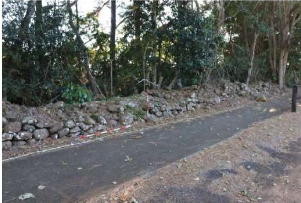
Plate 2. Wall 1, view northeast.