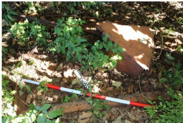
Plate 22. Rubbish dump including rail track and machinery