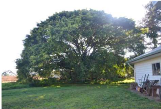
Plate 13. Spreading fig tree on northeast side of house, view east.