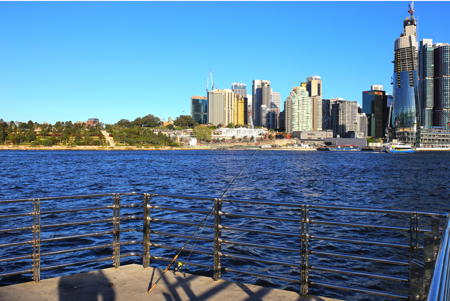
PHOTO - EXISTING