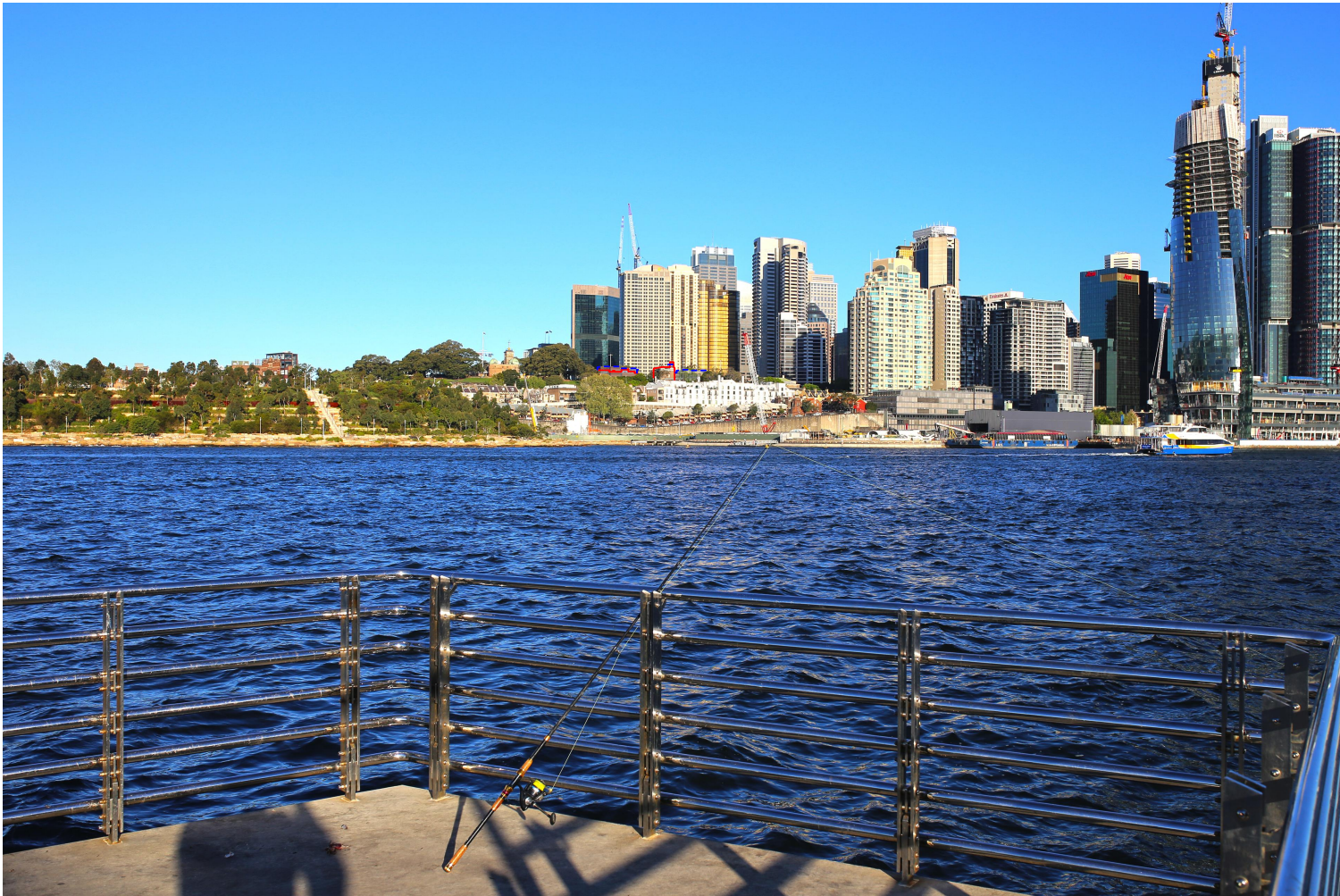
3D MODEL VIEW - PROPOSED

3D Model camera positions from Survey Terrain/Context buildings modelled indicatively Viewpoint 1-6 = 16mm focal length Viewpoint 7-11 = 35mm focal length