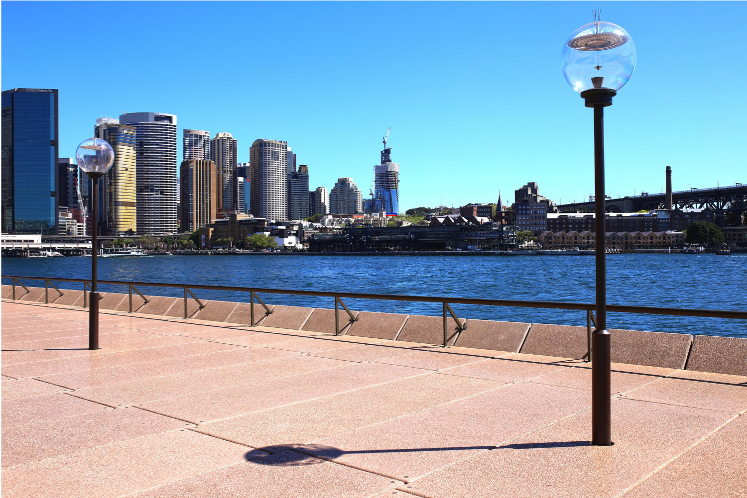
3D MODEL VIEW - PROPOSED

3D Model camera positions from Survey Terrain/Context buildings modelled indicatively Viewpoint 1-6 = 16mm focal length Viewpoint 7-11 = 35mm focal length