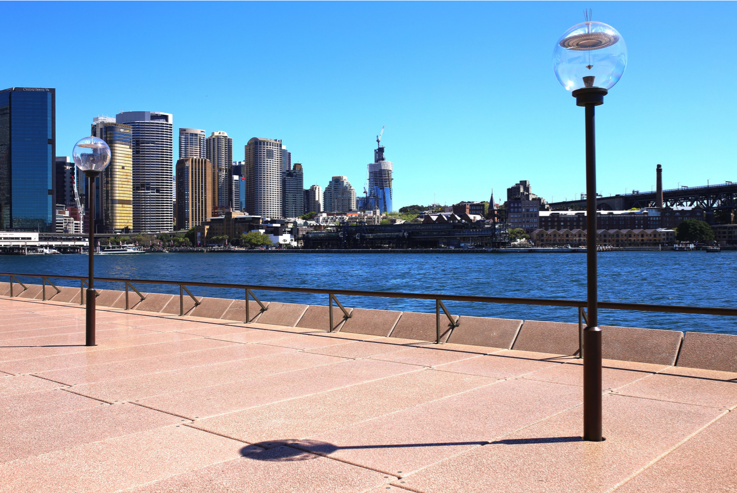
PHOTO - EXISTING