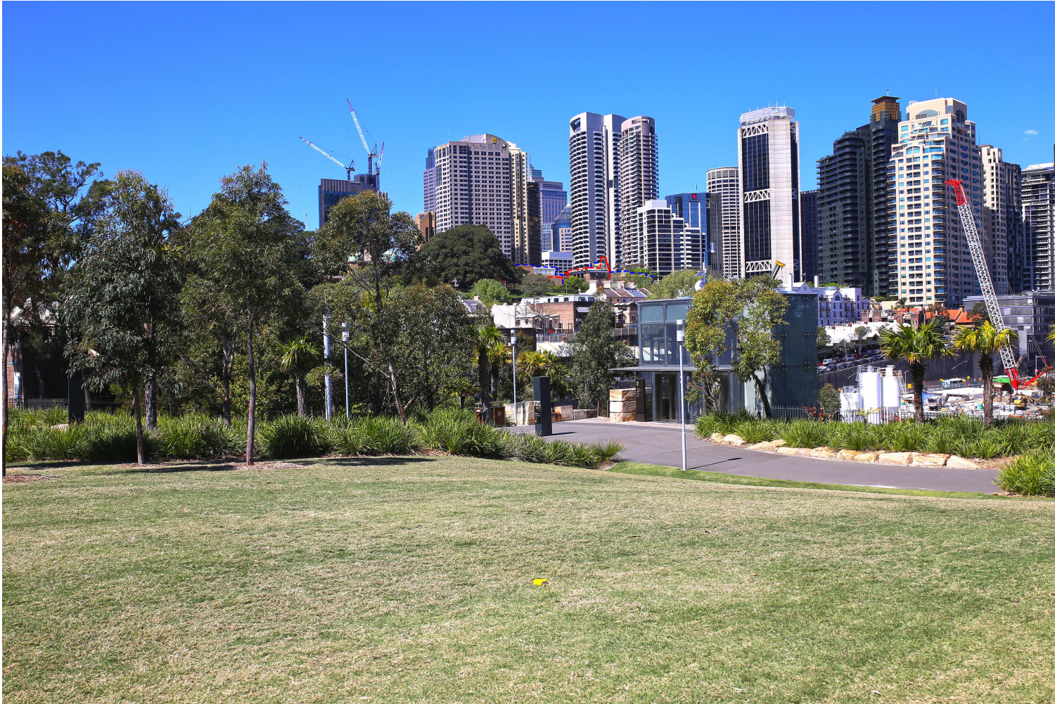
3D MODEL VIEW - PROPOSED

3D Model camera positions from Survey Terrain/Context buildings modelled indicatively Viewpoint 1-6 = 16mm focal length Viewpoint 7-11 = 35mm focal length