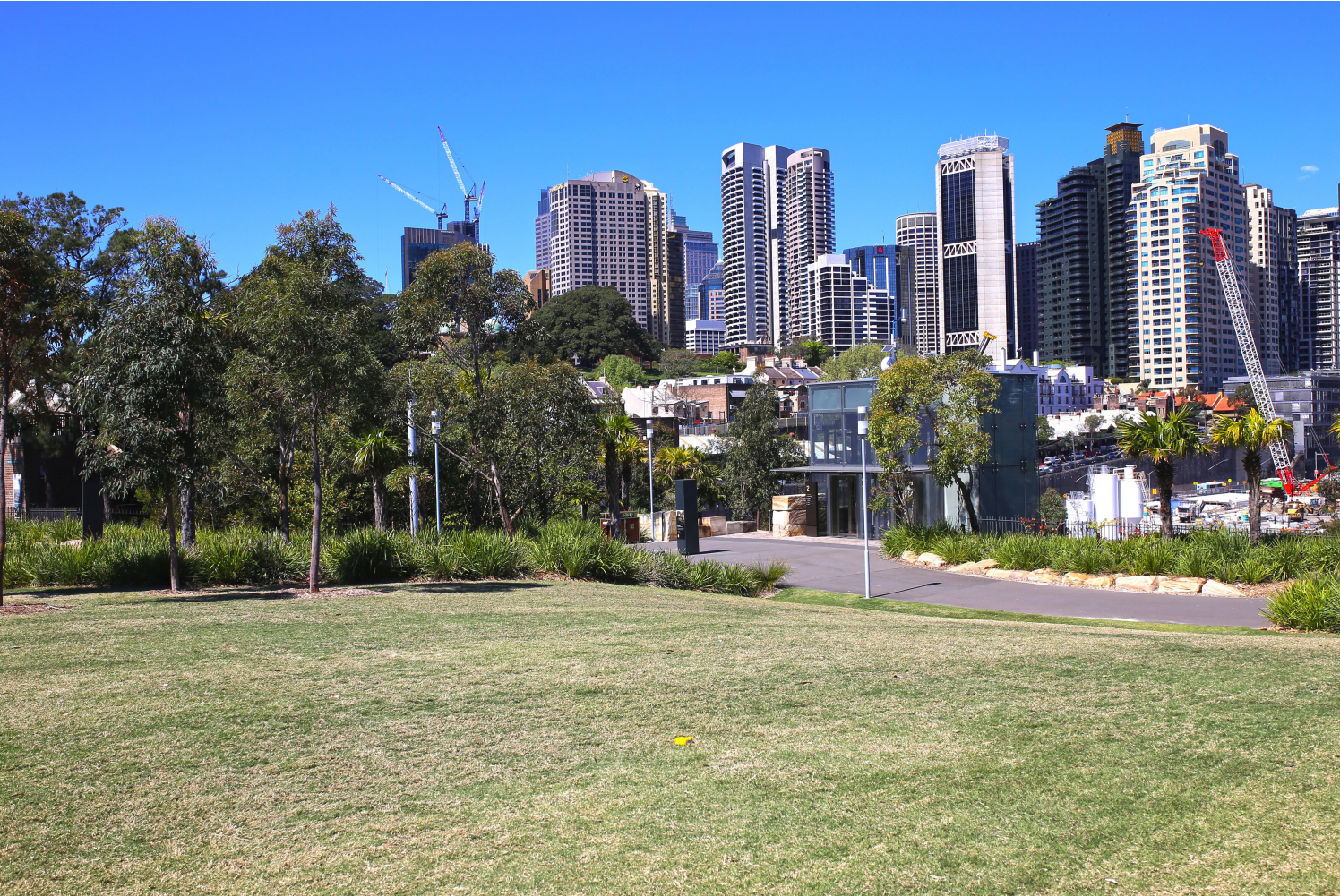
PHOTO - EXISTING

NOTE: 35mm considered to capture perspective similar to the human eye. A 16mm lens has been used when shorter viewing distance warrants a wider field of view. The height of camera is 1.6m above ground level Refer to ETHOS URBAN Visual Impact Assessment Report