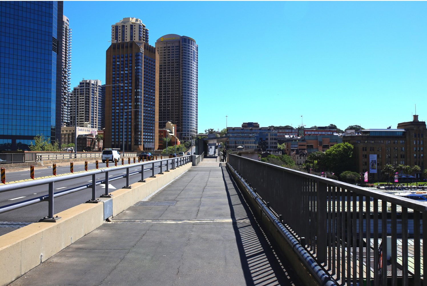
PHOTO - EXISTING