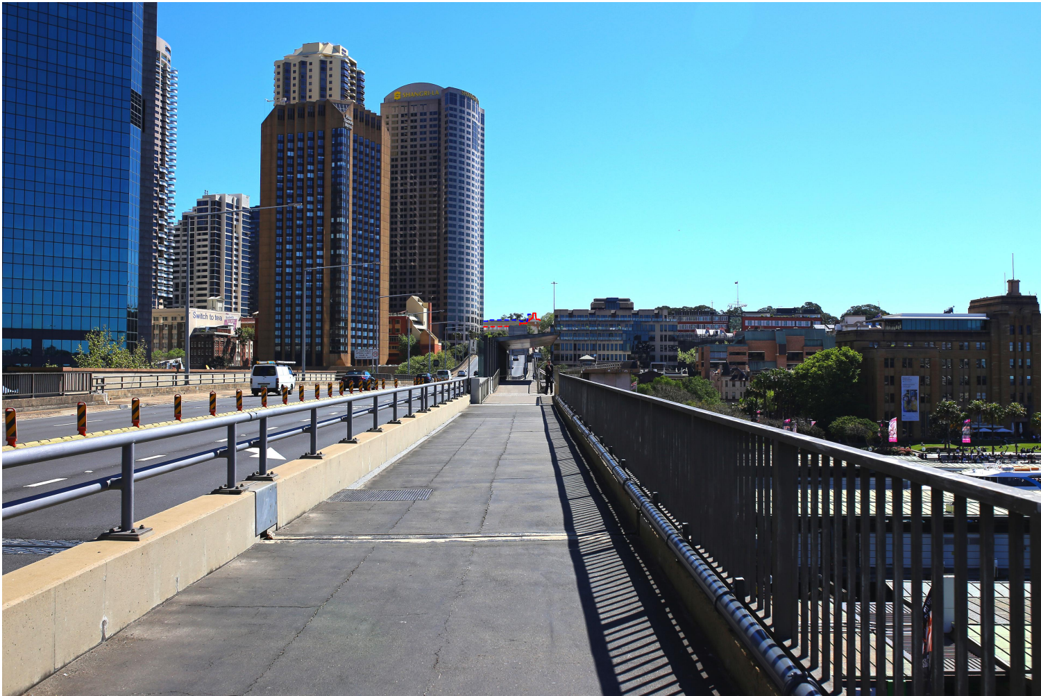
3D MODEL VIEW - PROPOSED

3D Model camera positions from Survey Terrain/Context buildings modelled indicatively Viewpoint 1-6 = 16mm focal length Viewpoint 7-11 = 35mm focal length