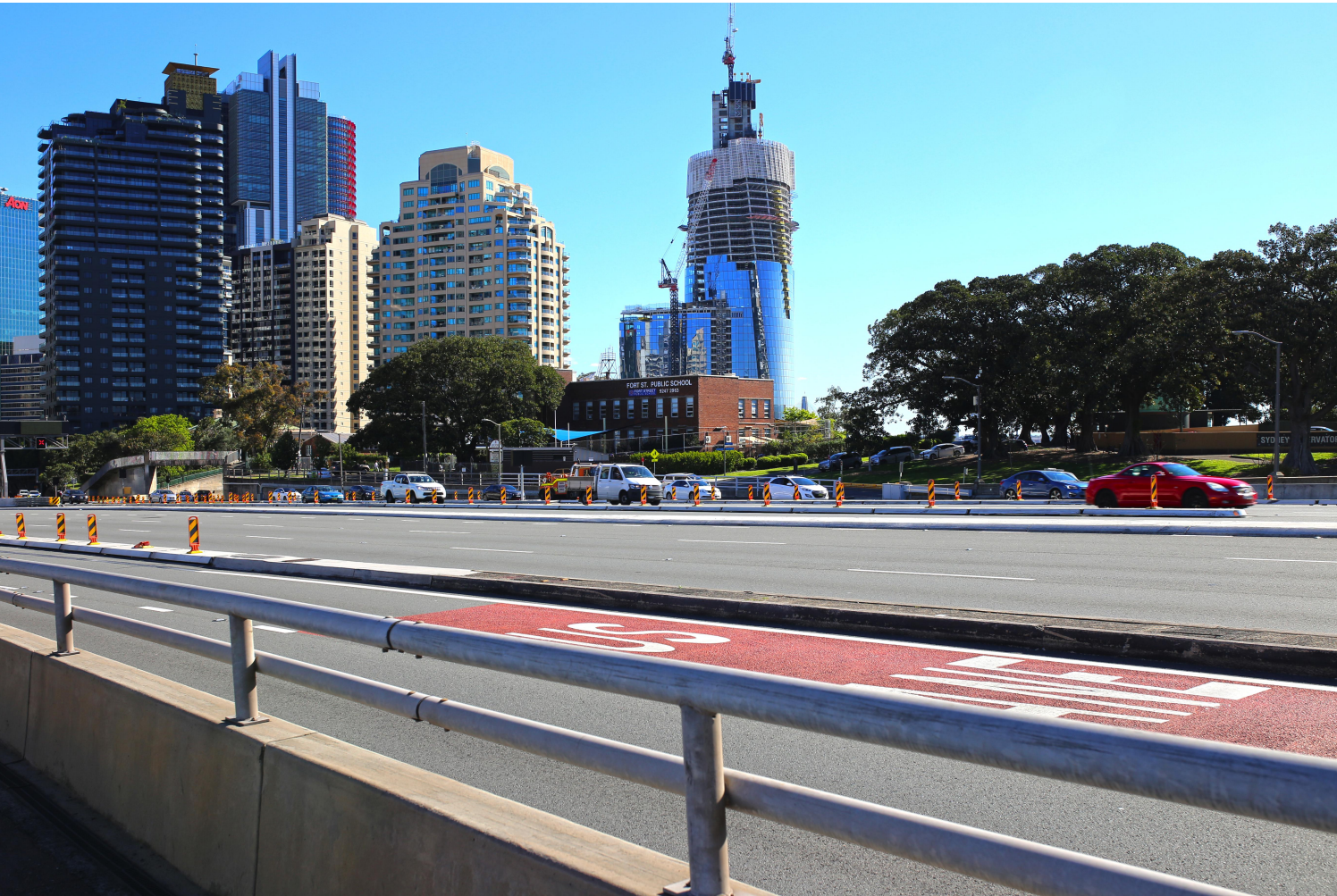
PHOTO - EXISTING