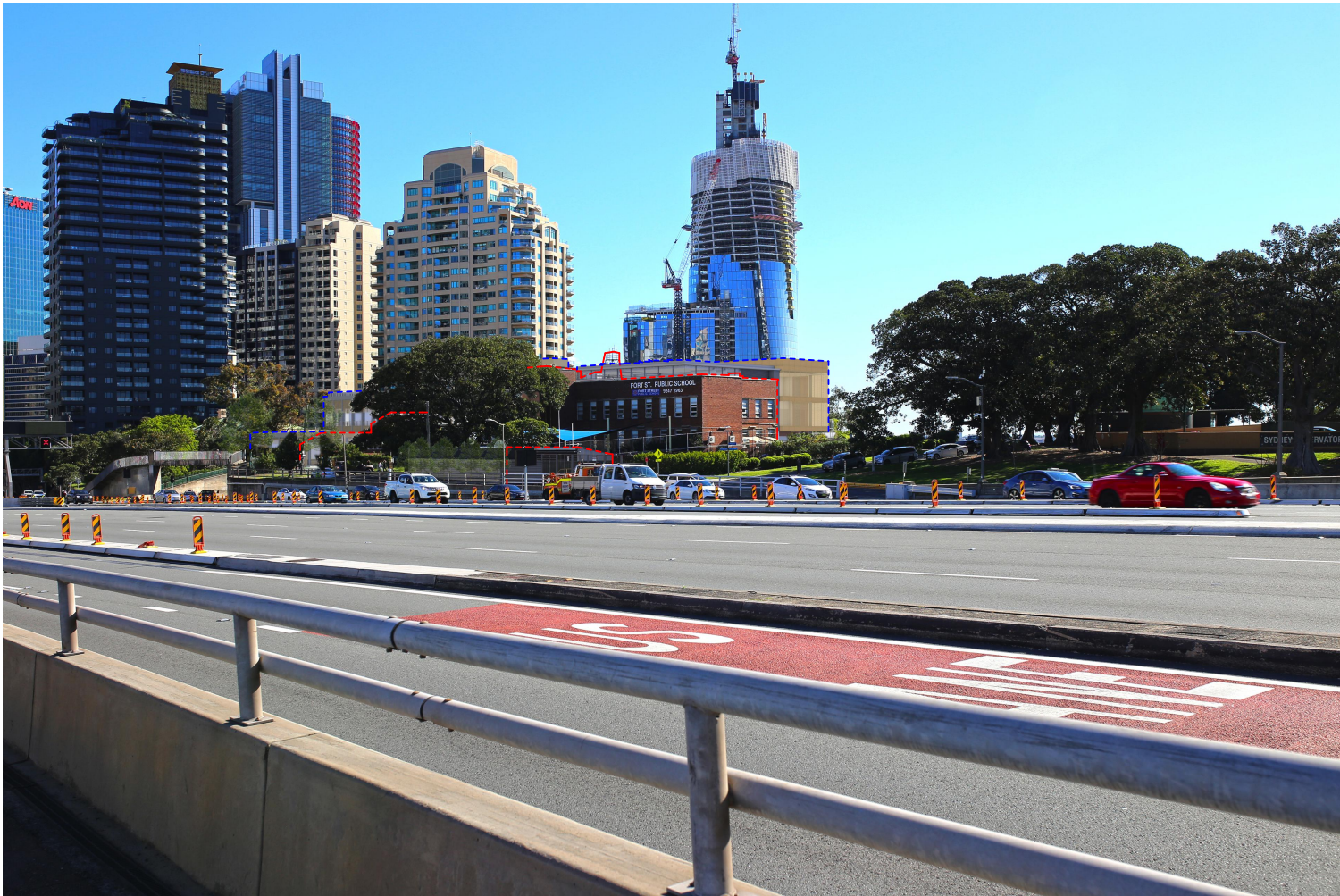
3D MODEL VIEW - PROPOSED

3D Model camera positions from Survey Terrain/Context buildings modelled indicatively Viewpoint 1-6 = 16mm focal length Viewpoint 7-11 = 35mm focal length