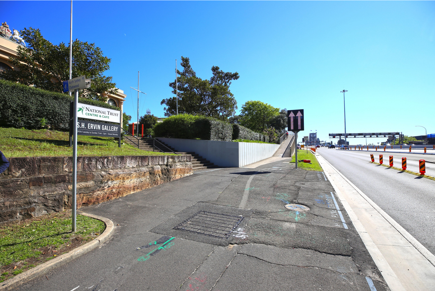
PHOTO - EXISTING