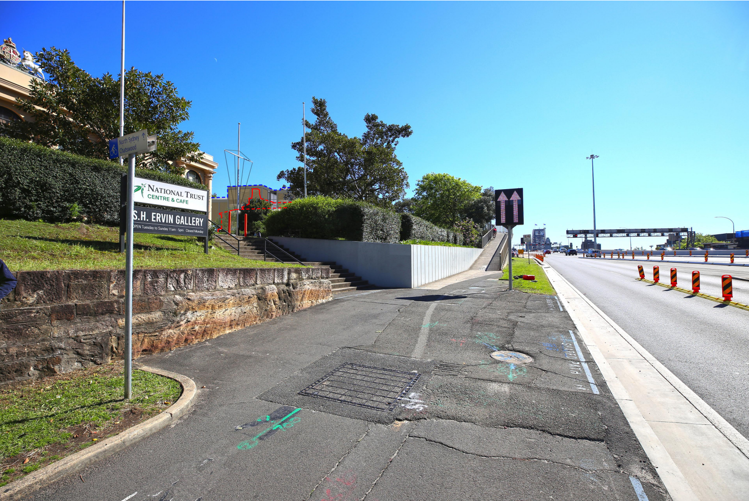
3D MODEL VIEW - PROPOSED

3D Model camera positions from Survey Terrain/Context buildings modelled indicatively Viewpoint 1-6 = 16mm focal length Viewpoint 7-11 = 35mm focal length