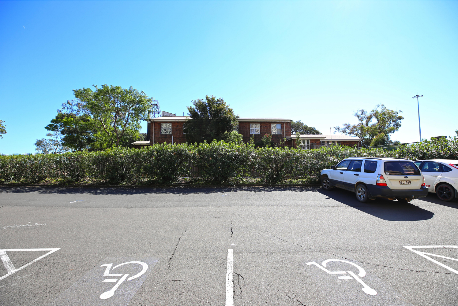
PHOTO - EXISTING