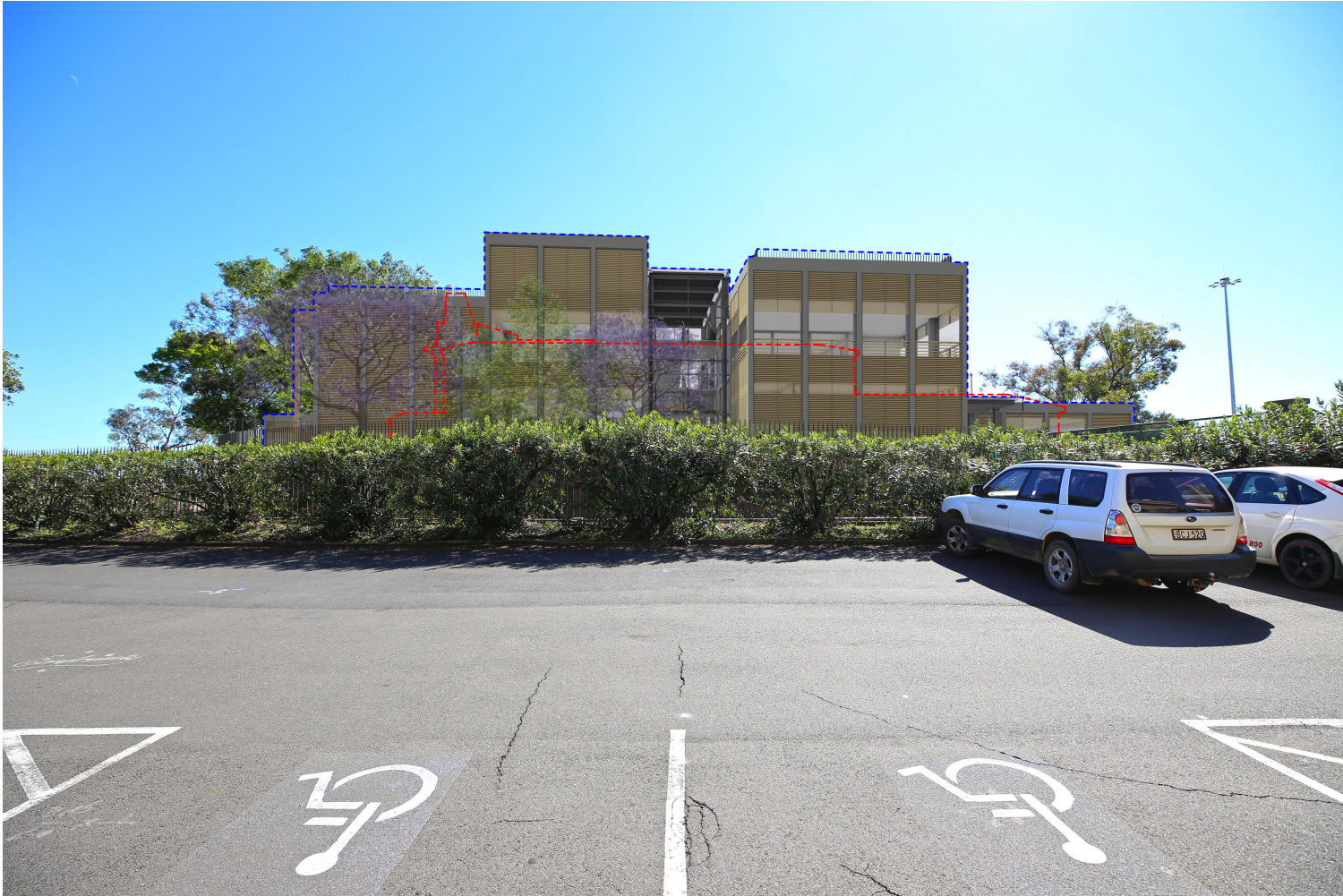
3D MODEL VIEW - PROPOSED

3D Model camera positions from Survey Terrain/Context buildings modelled indicatively Viewpoint 1-6 = 16mm focal length Viewpoint 7-11 = 35mm focal length