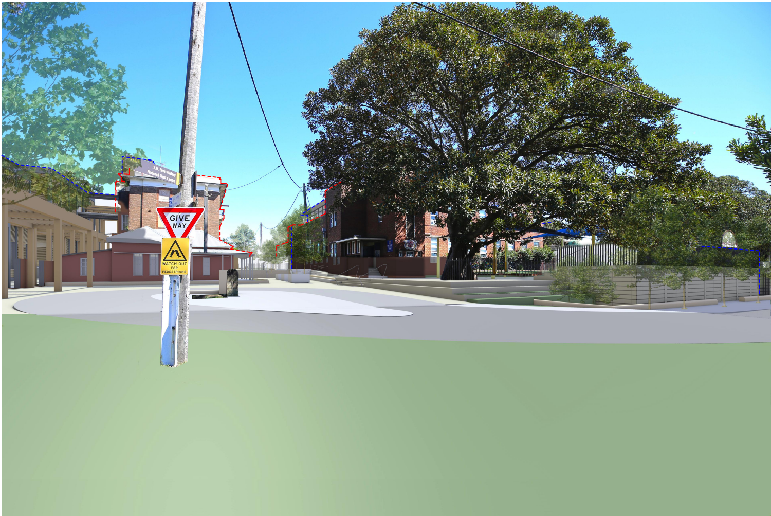
3D MODEL VIEW - PROPOSED

3D Model camera positions from Survey Terrain/Context buildings modelled indicatively Viewpoint 1-6 = 16mm focal length Viewpoint 7-11 = 35mm focal length