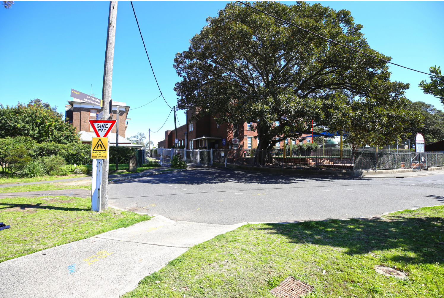
PHOTO - EXISTING