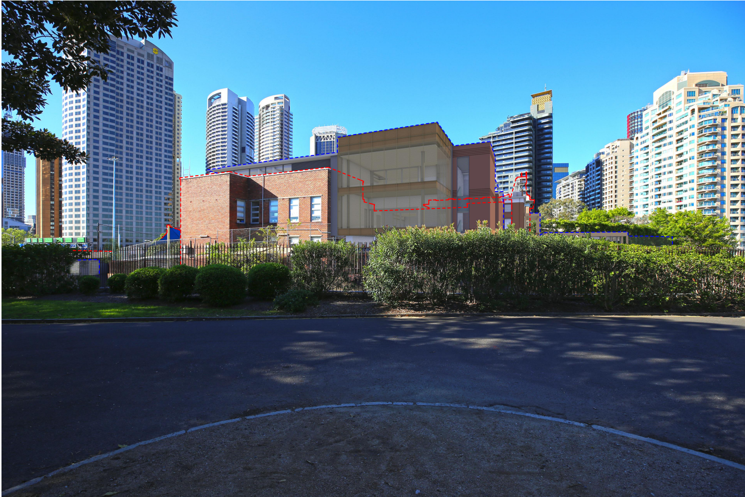
3D MODEL VIEW - PROPOSED

3D Model camera positions from Survey Terrain/Context buildings modelled indicatively Viewpoint 1-6 = 16mm focal length Viewpoint 7-11 = 35mm focal length