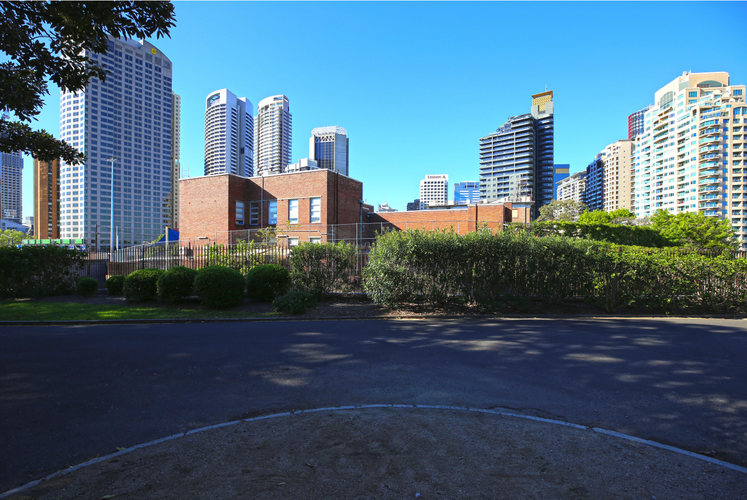
PHOTO - EXISTING