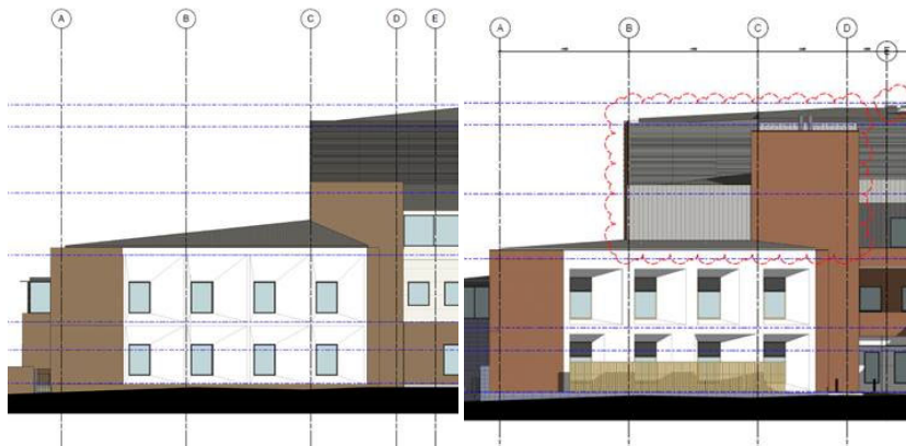
West Elevation: Original SSDA without expansion (left) and proposed Modification design with expansion (right)

The fire stair extension is clad in brickwork on the northern and eastern sides as the lower levels are already to be built in brickwork (as per the approved design and approved SSDA). As such, the project continued with brickwork on Level 3, noting this also ensures consistency with the approved design. This also unifies the expansion portion with the rest of the building and provides a seamless transition across the building. The brickwork façade was already visible in the western elevation and so by altering the material for Level 3 of the fire stairs, the visual impact would be detrimental to the original design and coherency.