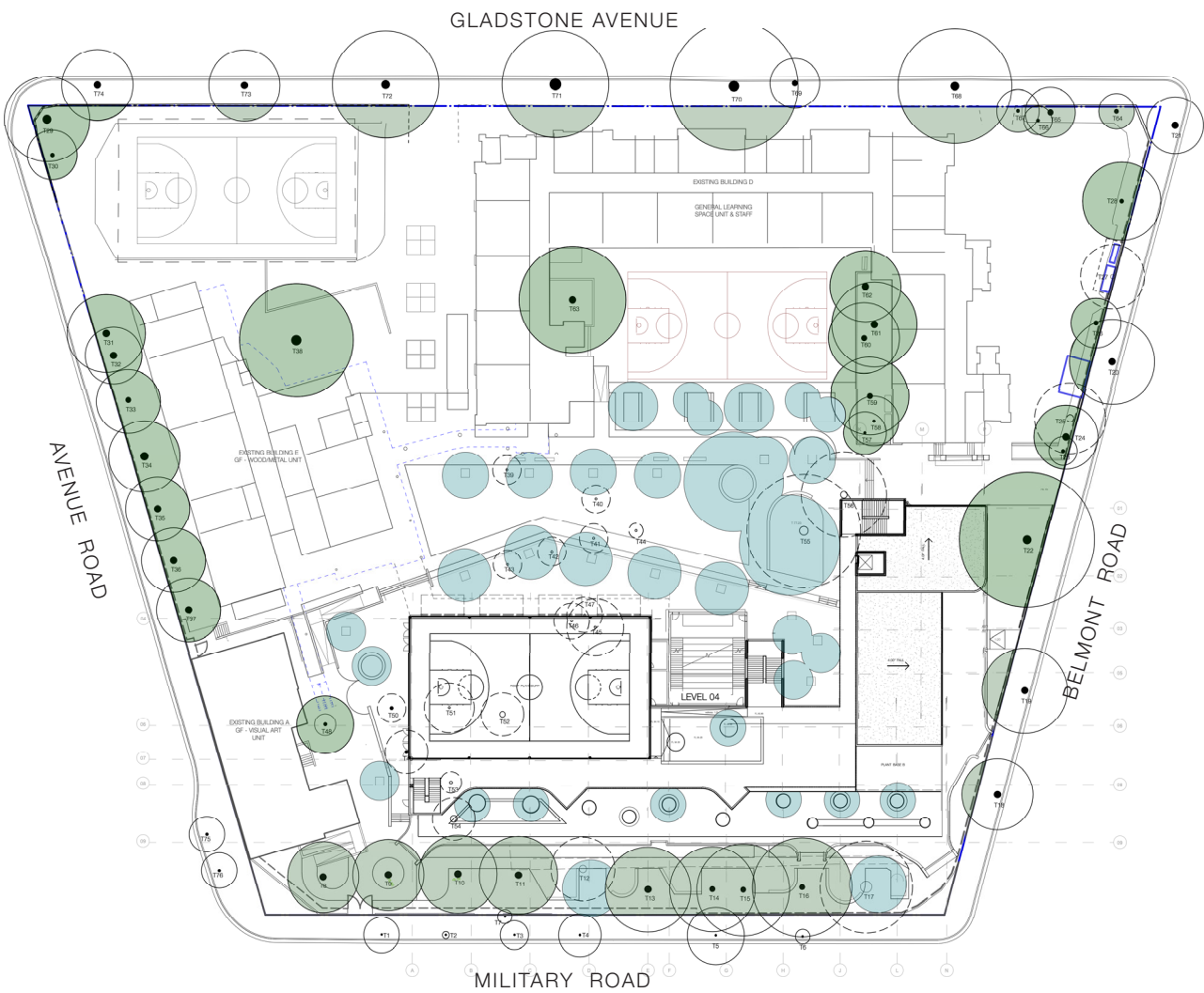
PROPOSED TREE CANOPY